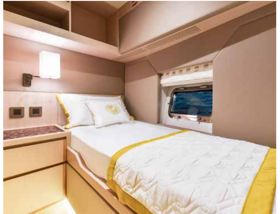
Forward VIP Guest Head | Guest Cabin