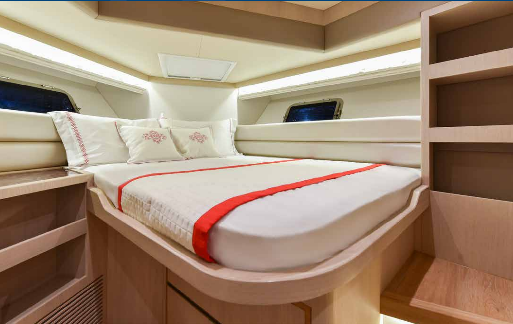
Forward VIP Guest Cabin