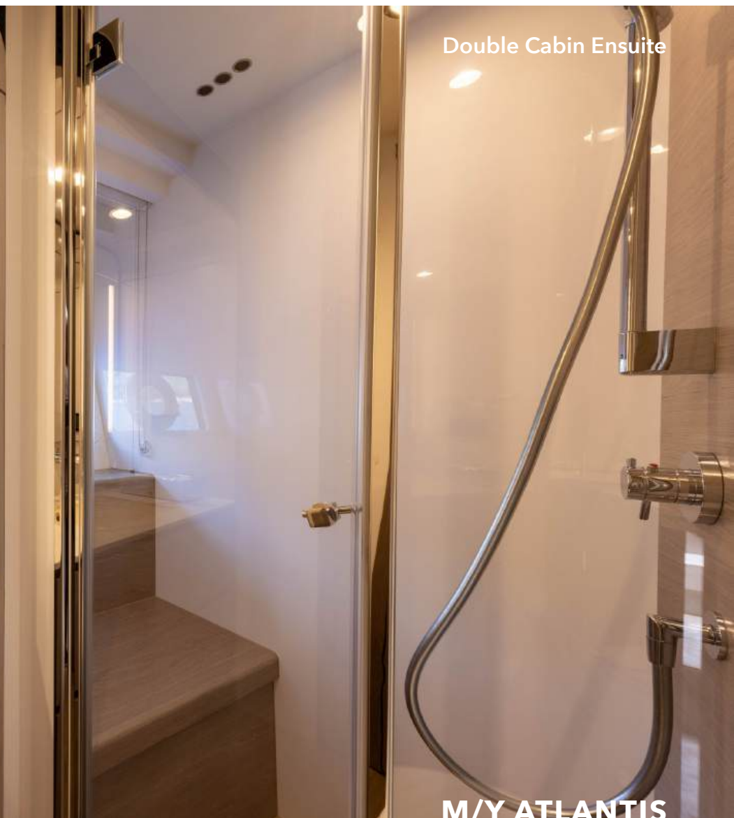
Double Cabin Ensuite