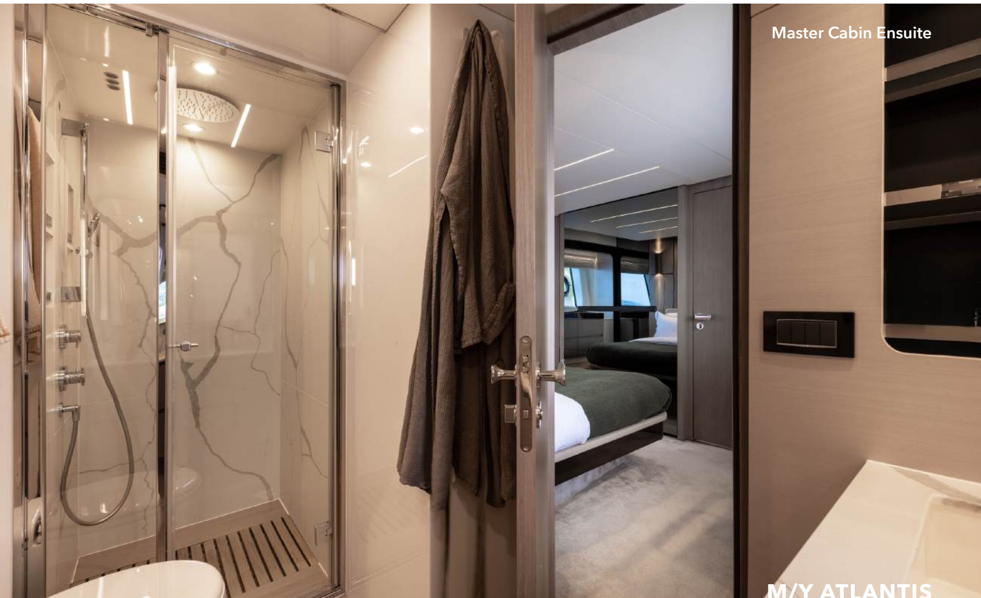
Master Cabin Ensuite