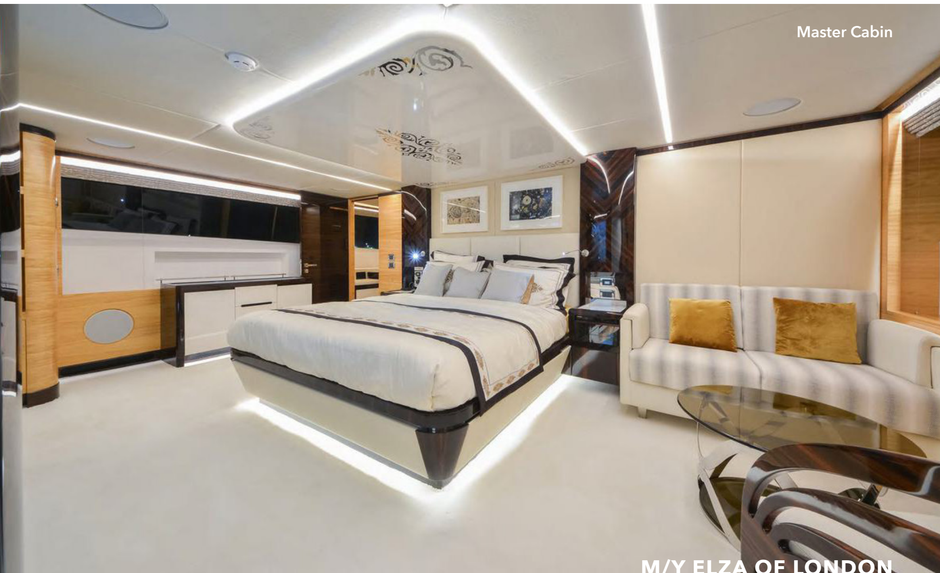
M/Y ELZA OF LONDON