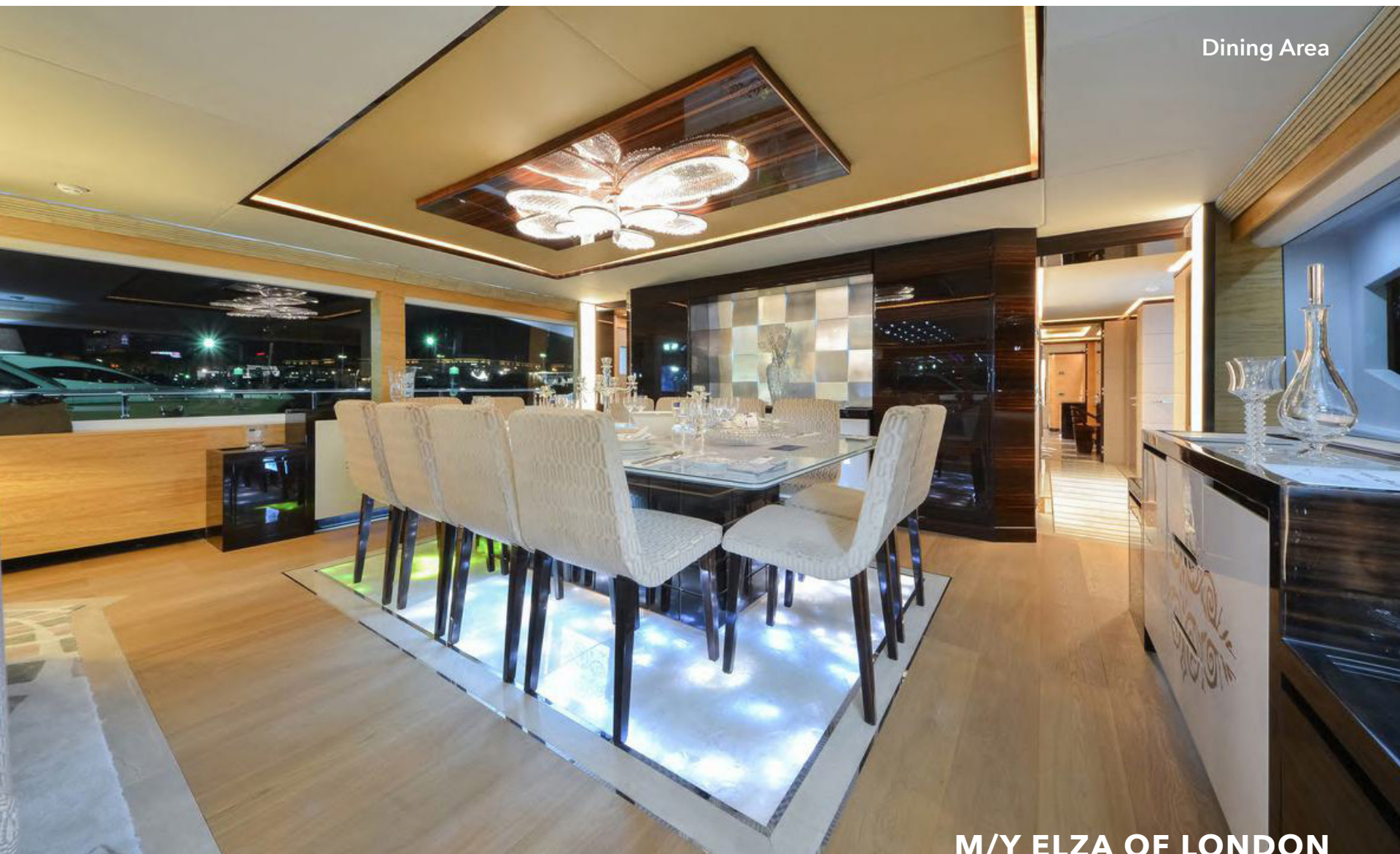
M/Y ELZA OF LONDON