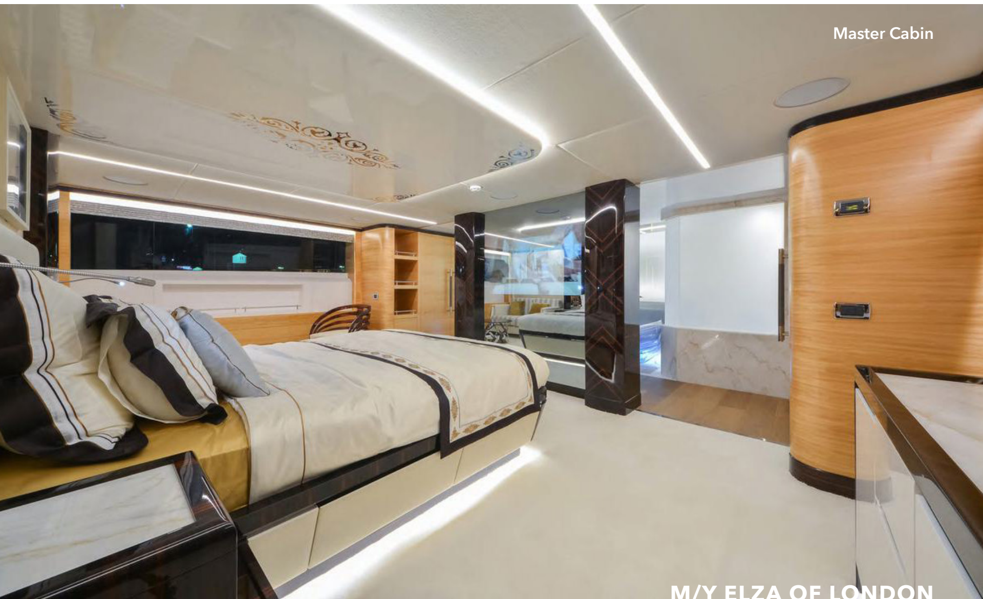
M/Y ELZA OF LONDON