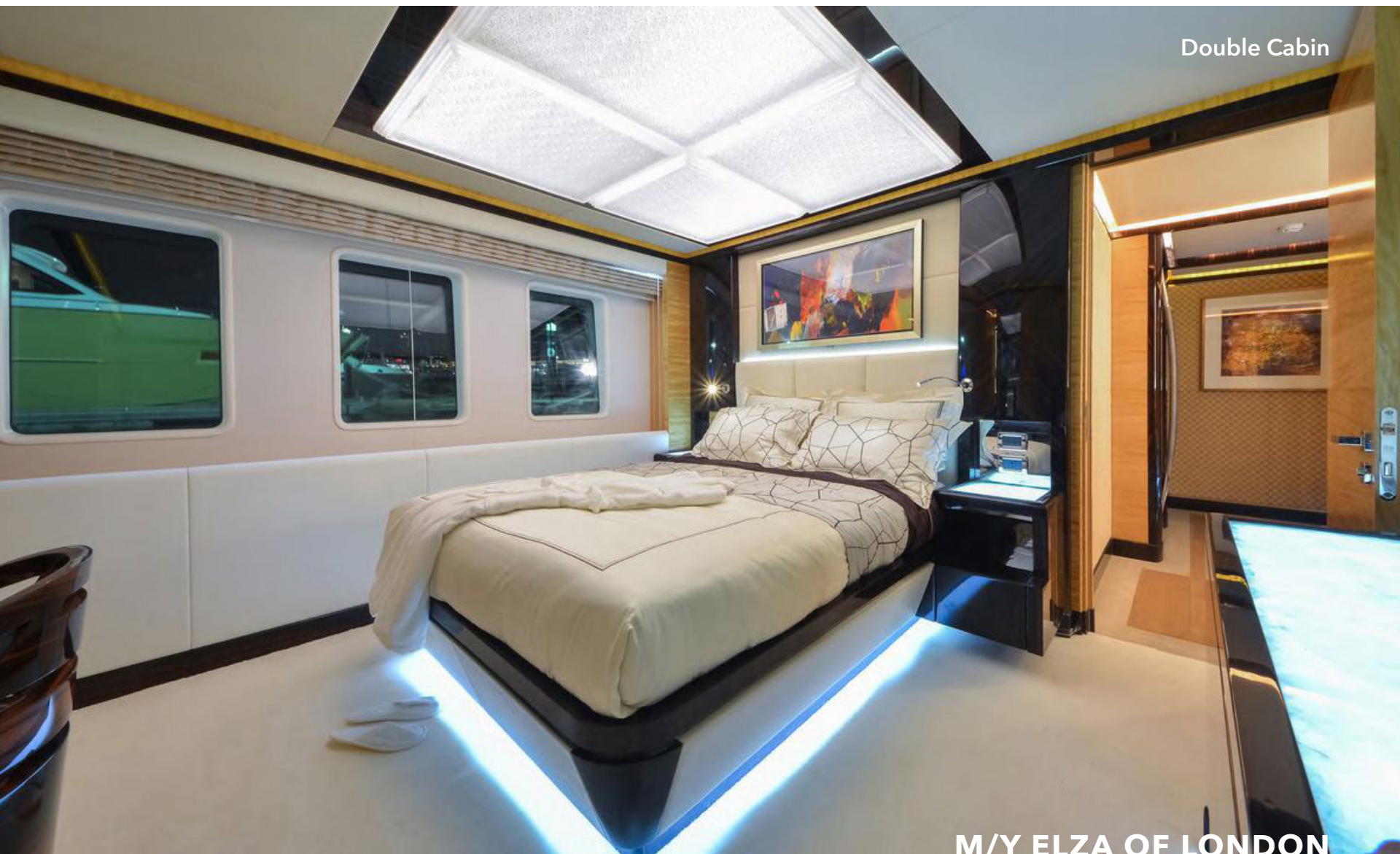
M/Y ELZA OF LONDON