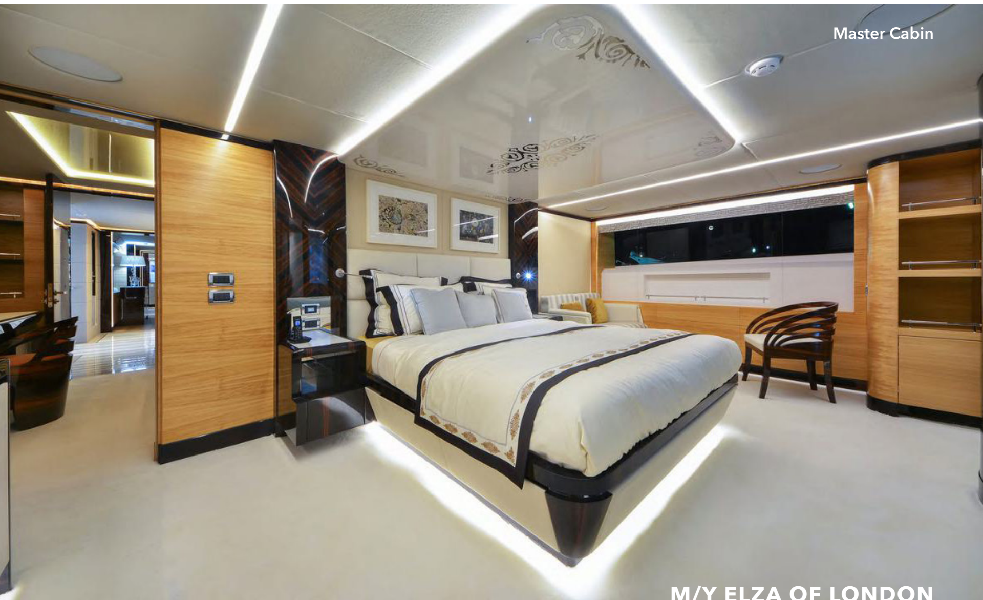
M/Y ELZA OF LONDON