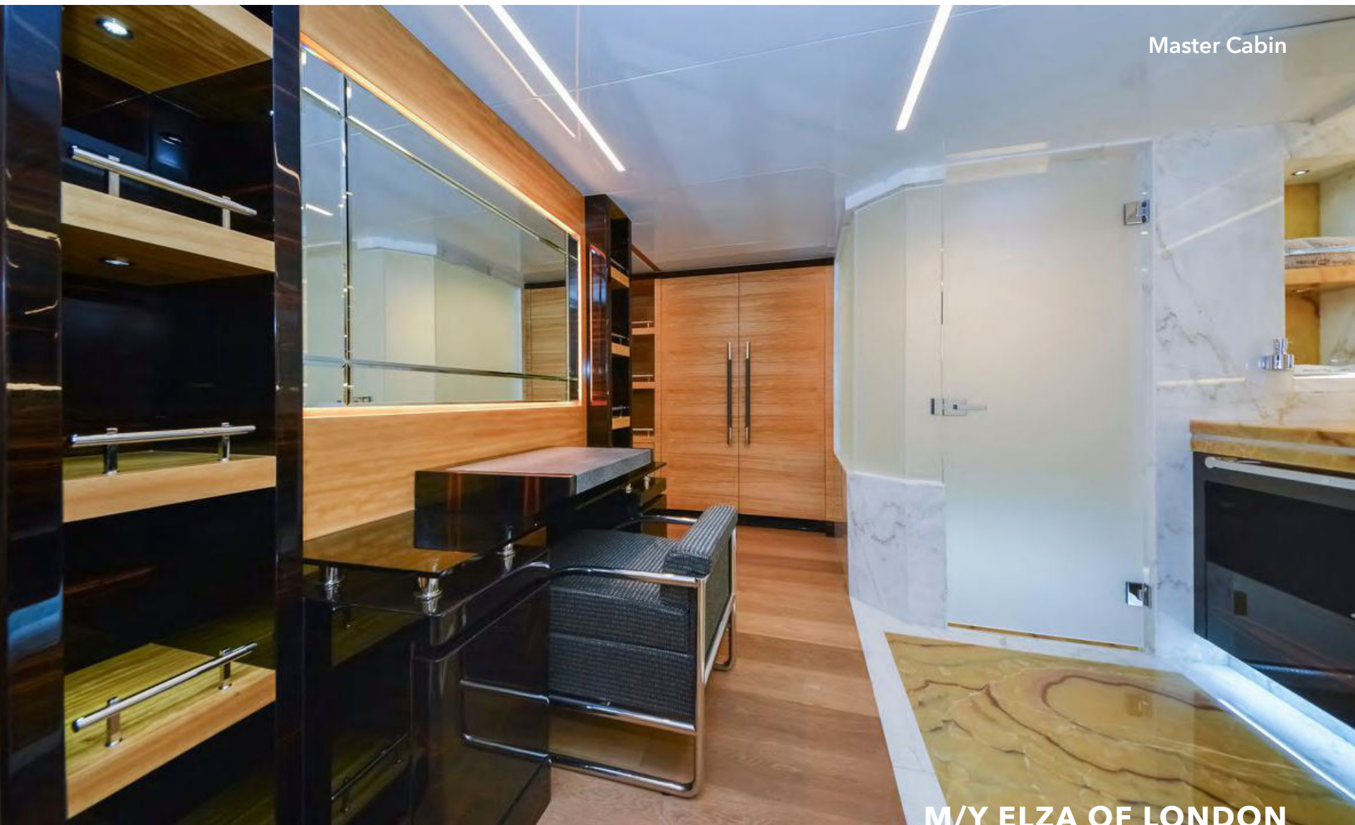
M/Y ELZA OF LONDON