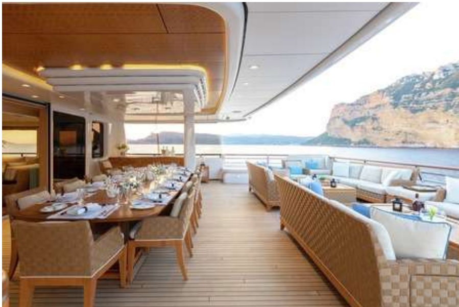
Upper deck - Dining