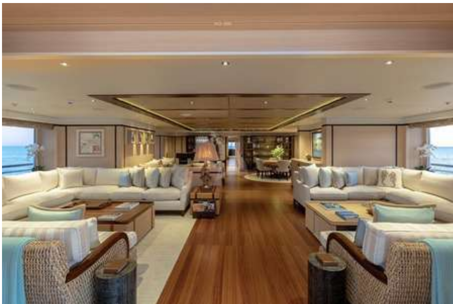
Upper deck - Saloon