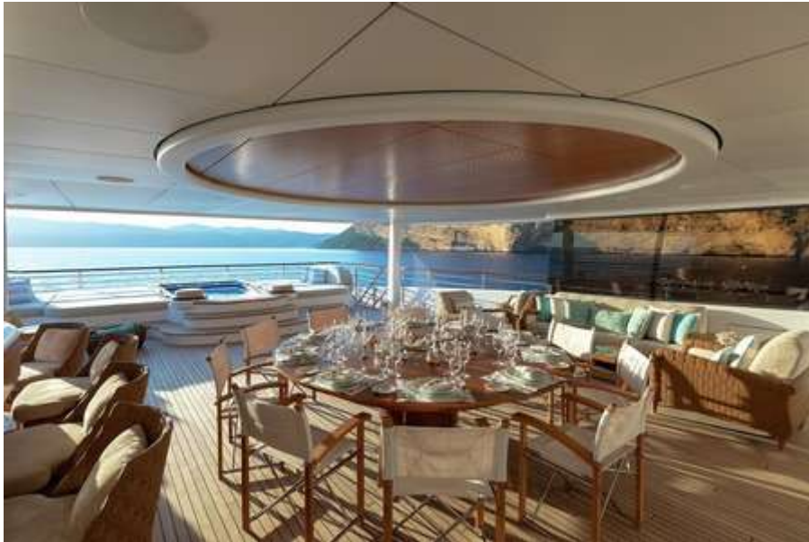
Bridge deck - Dining