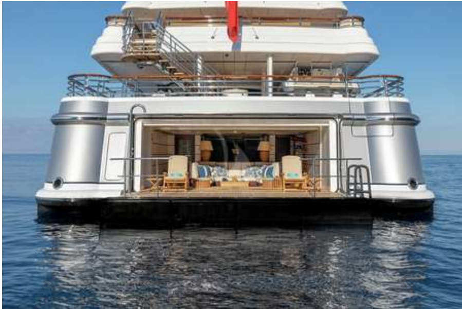
Lower deck - Beach club