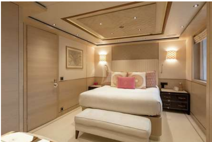
Upper deck - VIP suite 2