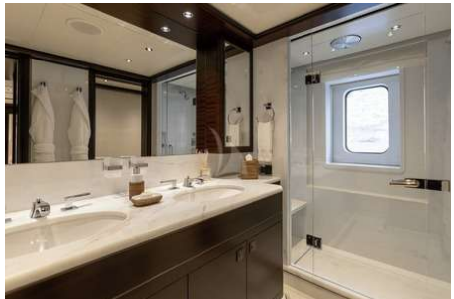
Guest cabins en suite