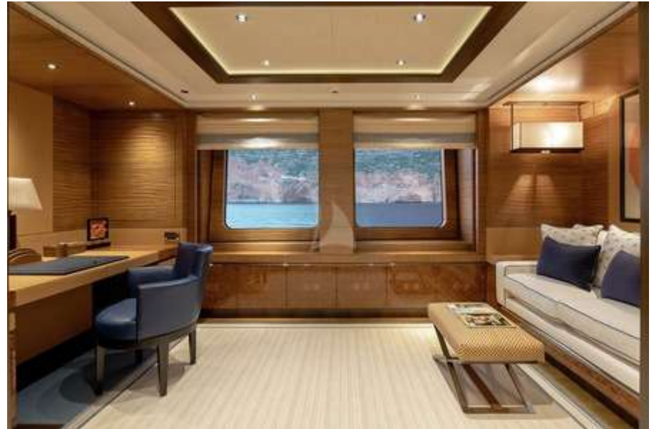
Main deck - Master private office