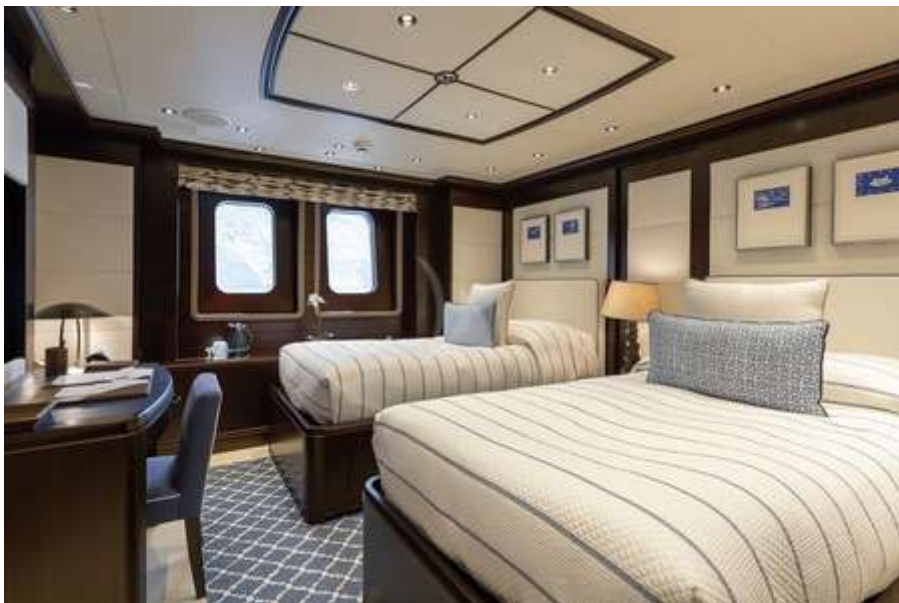
Lower deck - 2 x twin cabins convertible into double