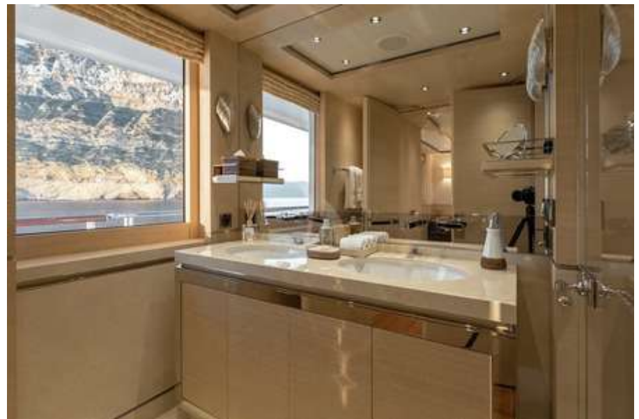
Upper deck - VIP suite bathroom