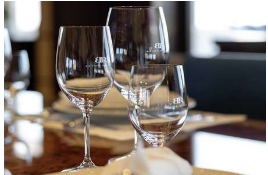
Main deck - Dining details