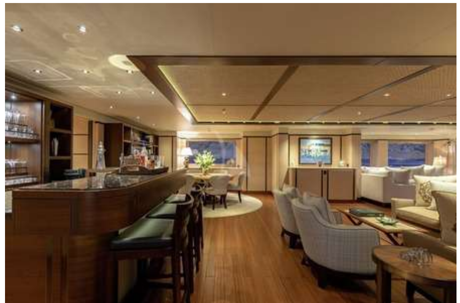
Upper deck - Saloon