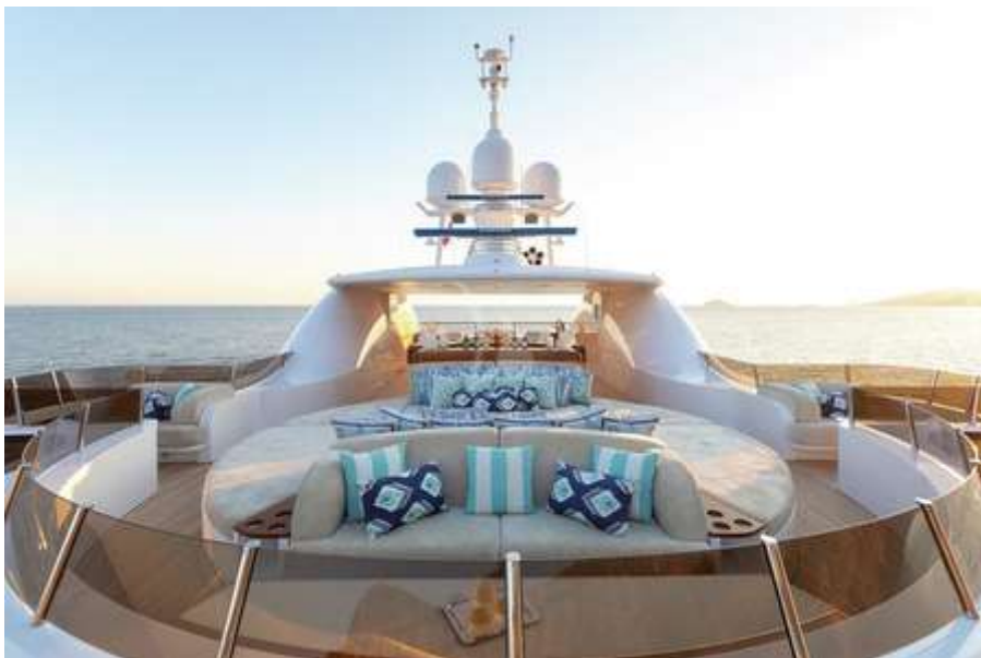
Sun deck - Lounging area