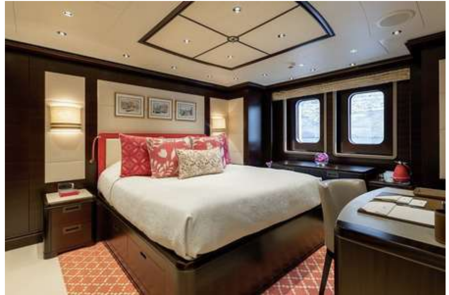
Lower deck - Double cabin