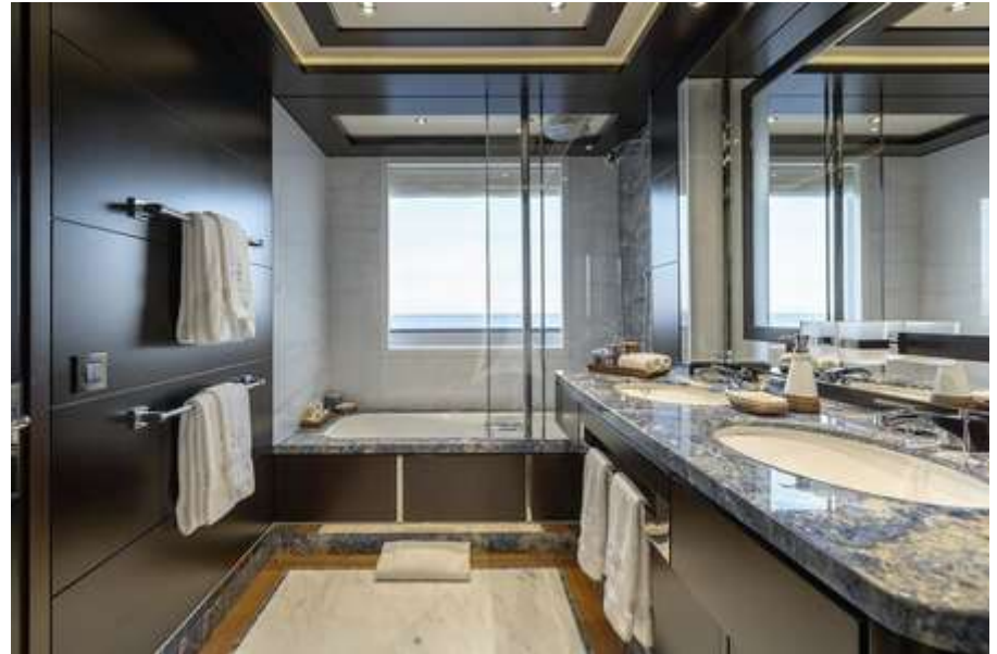
Upper deck - VIP suite bathroom