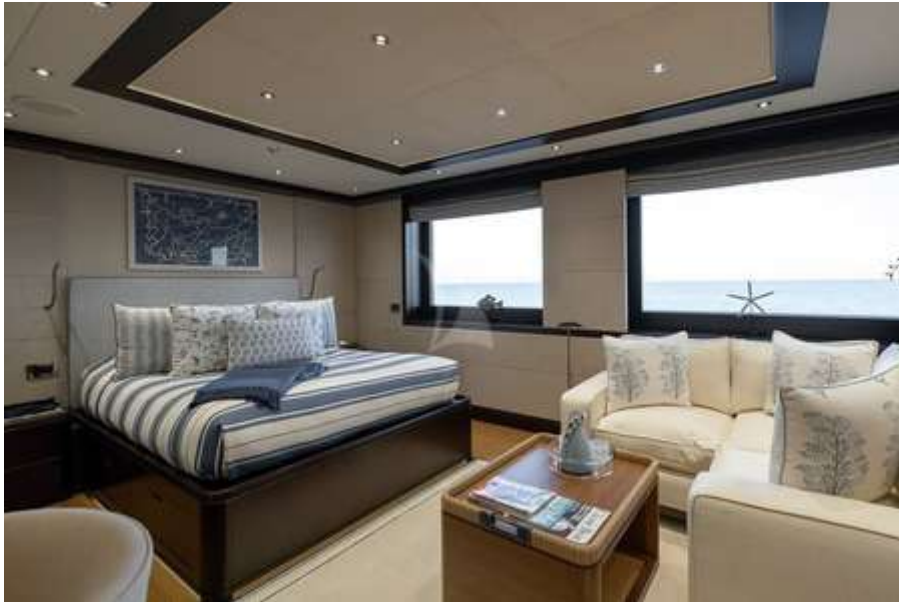
Upper deck - VIP suite 1