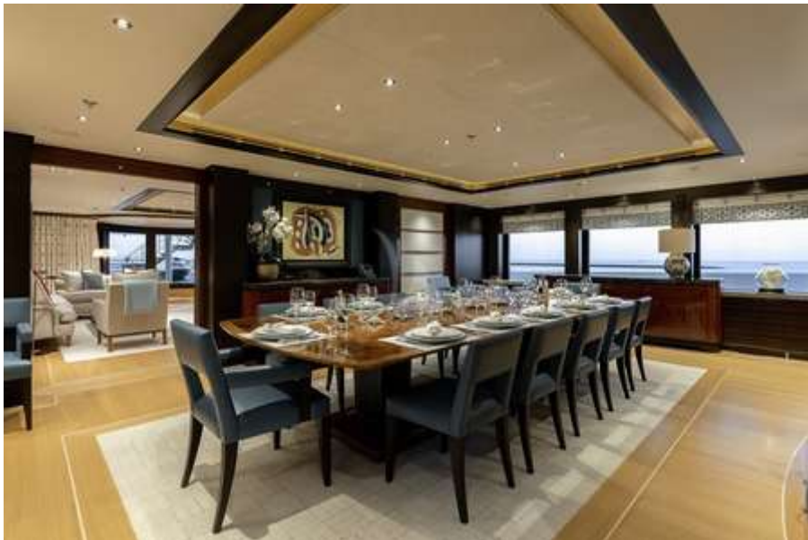
Main deck - Dining