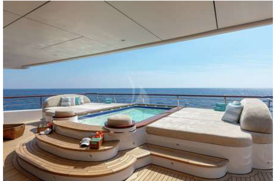
Bridge deck - Pool with jet stream