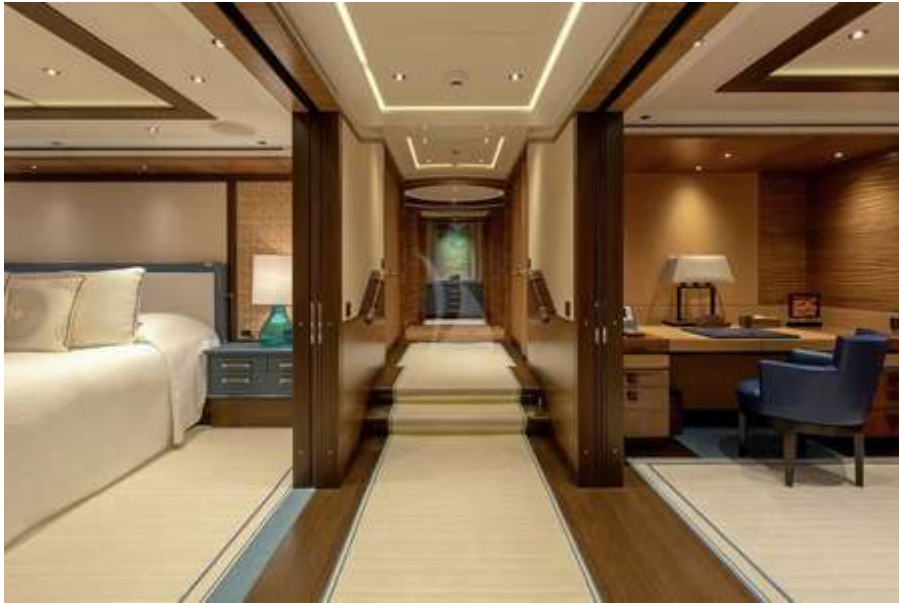
Main deck - Master suite