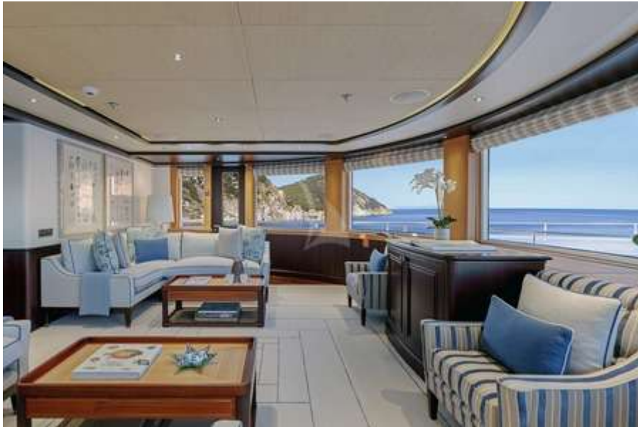
Upper deck - Observation lounge