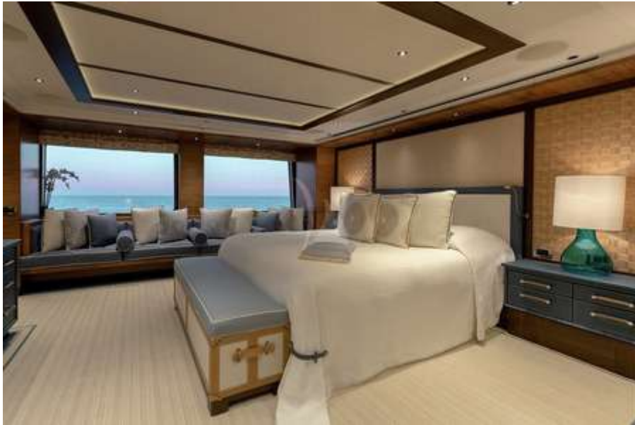
Main deck - Master suite