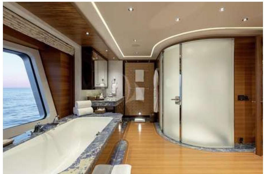
Master en suite