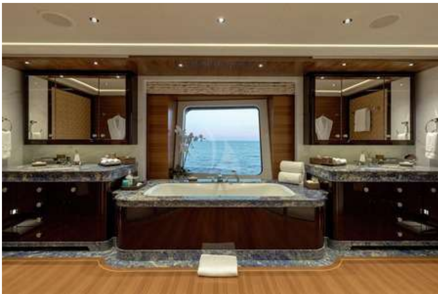
Master en suite