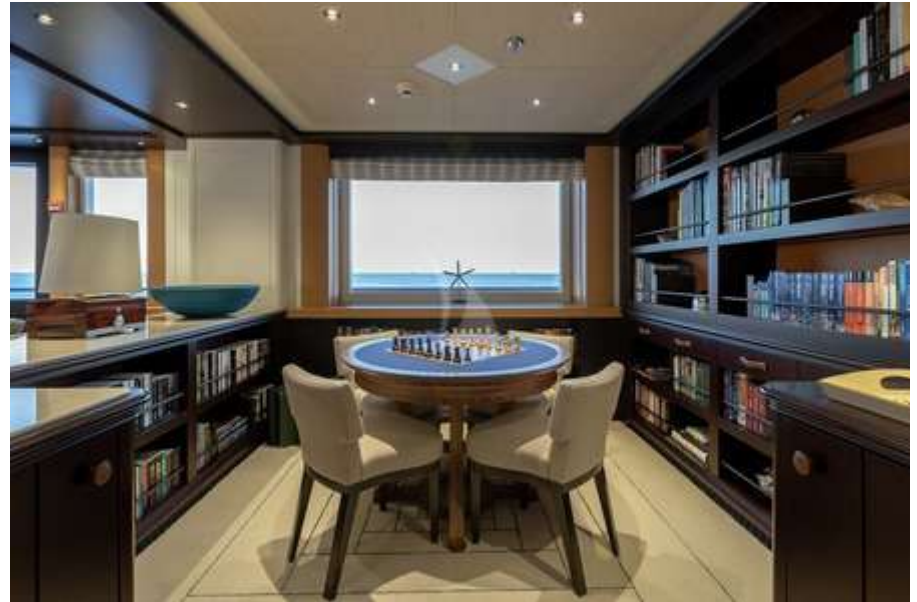
Upper deck - Observation lounge