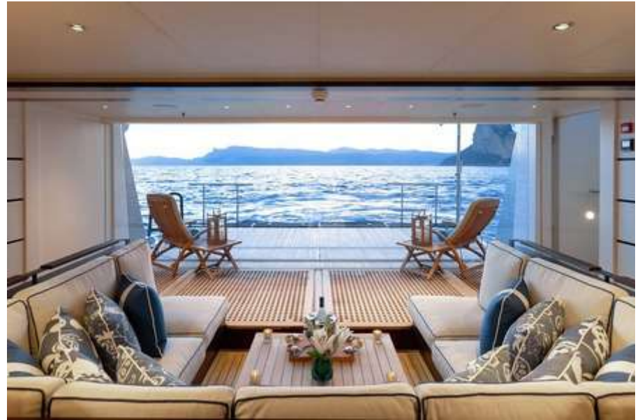
Lower deck - Beach club