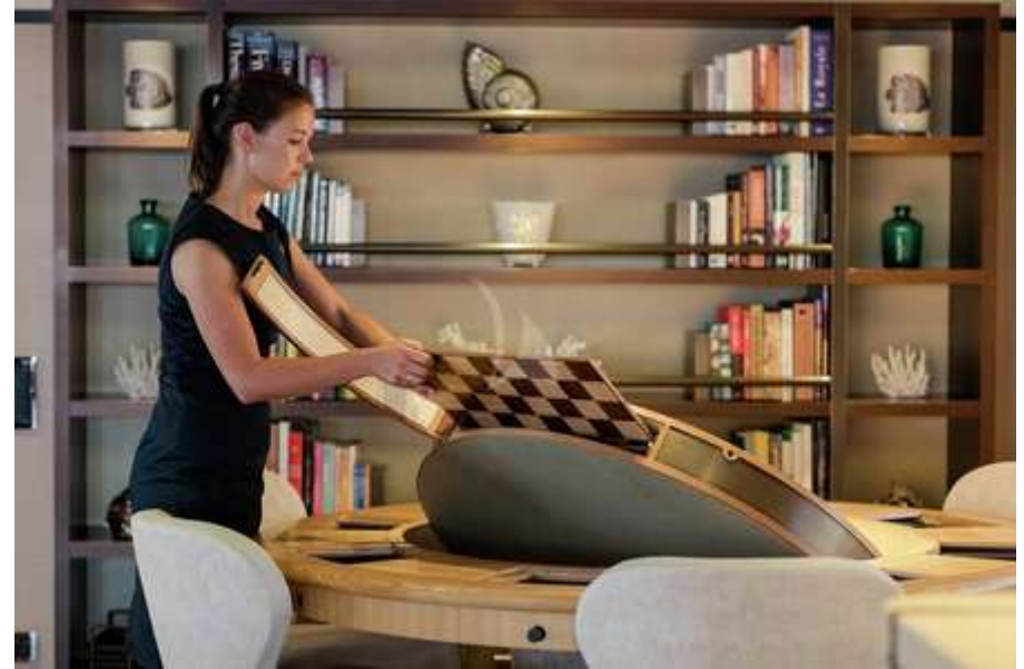
Upper deck - Saloon - Games table