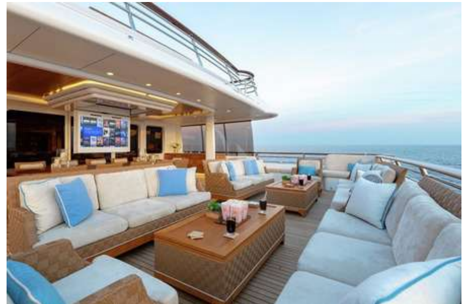
Upper deck - Outdoor cinema