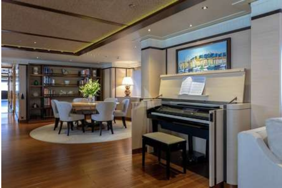
Upper deck - Saloon