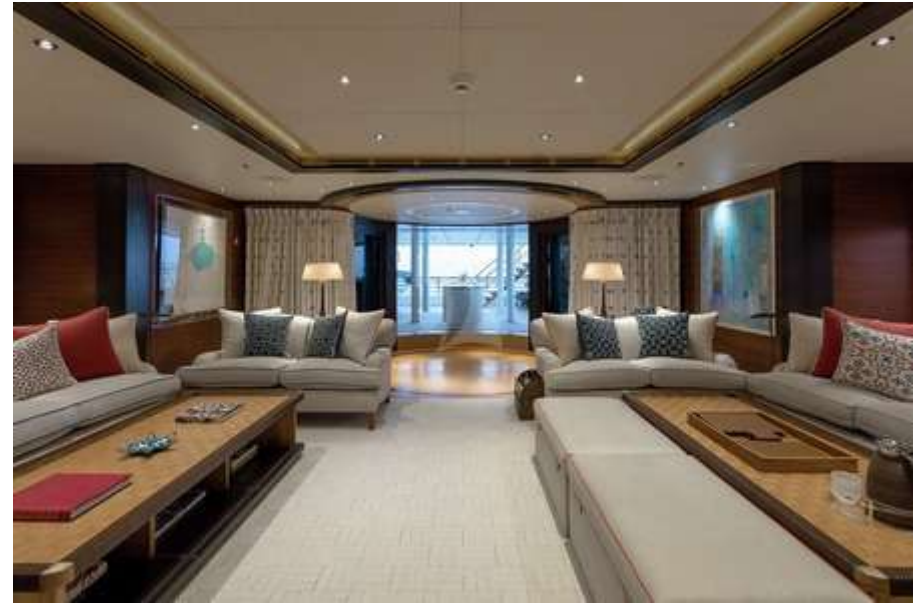
Main deck - Saloon