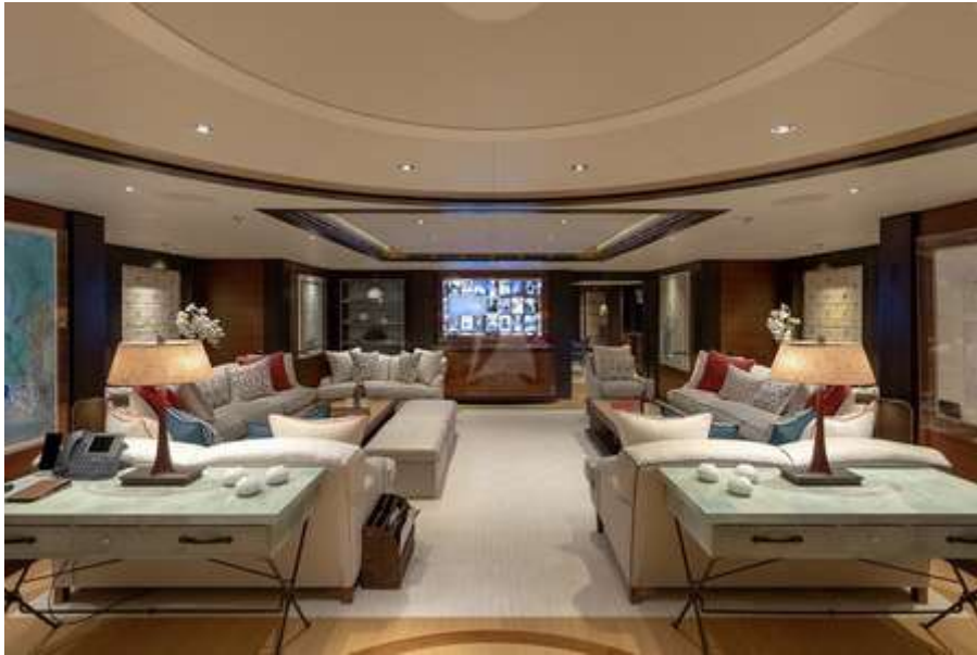
Main deck - Saloon