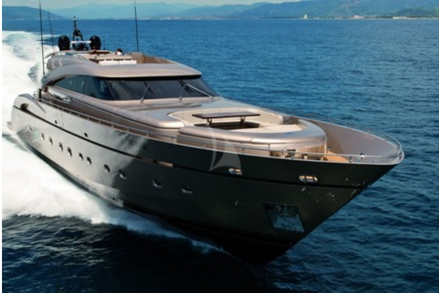
AB 116 Navigating