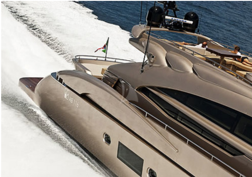
AB 116 Stern