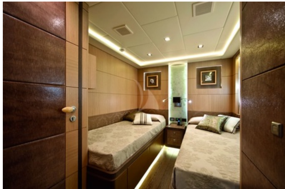
MUSA Twin Stateroom