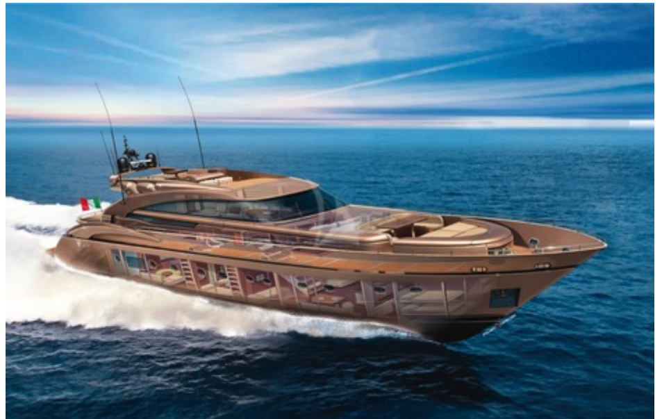
AB 116 Plan