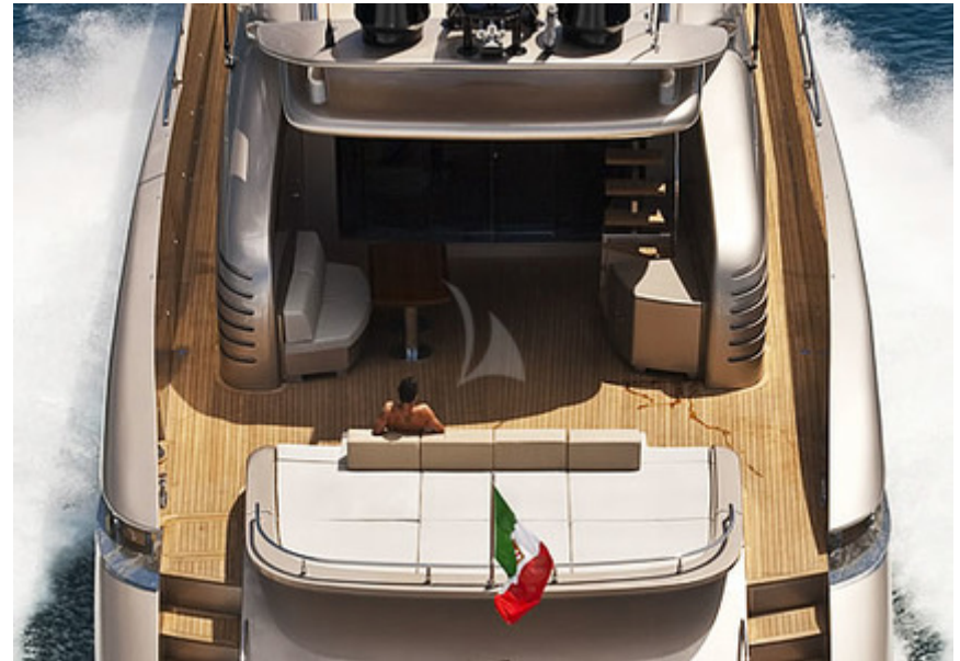
AB 116 Stern 2