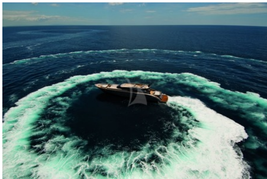
AB 116 Cruising