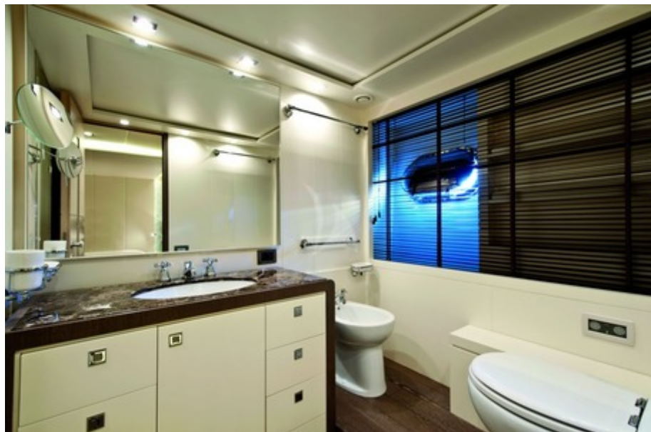
MUSA Head style