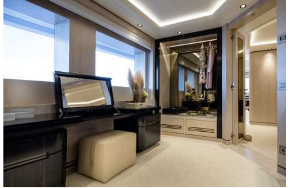
Owner's Suite Walk in Closet