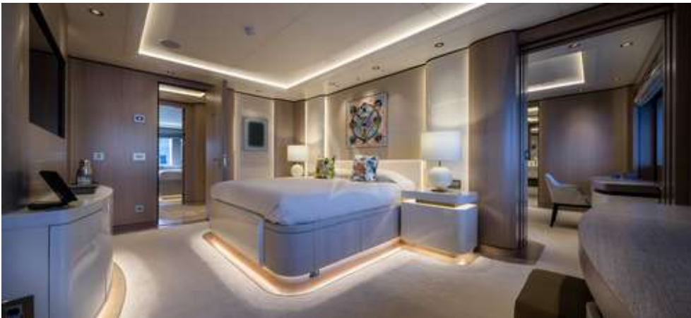
Salon Double Cabin (Guest Cabin 1 & 3)