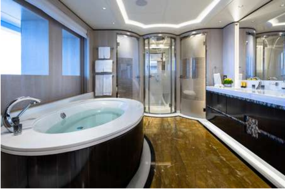
Owner's Suite En suite facilities