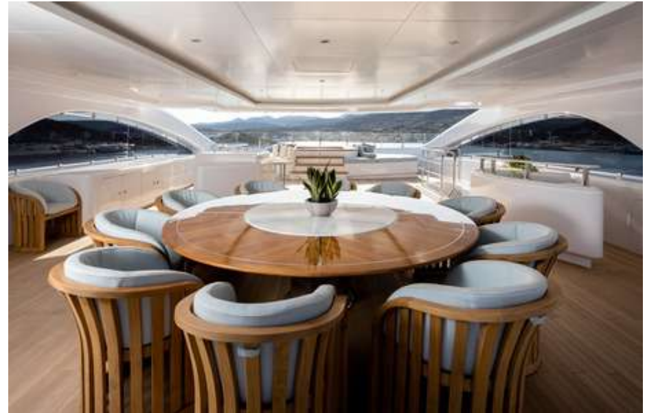
Dining Table Sundeck