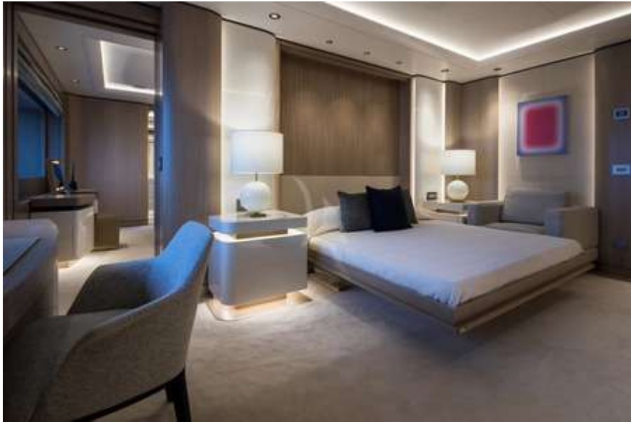
Salon Double Cabin Pullman bed