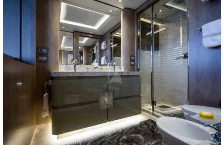
Guest Cabin 9 En suite facilities