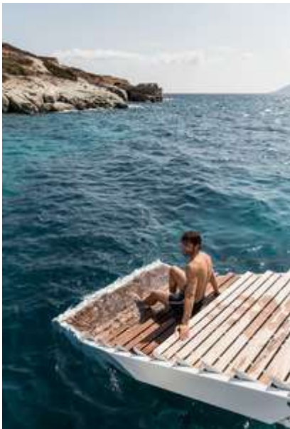
Hydraulic Swim Ladder