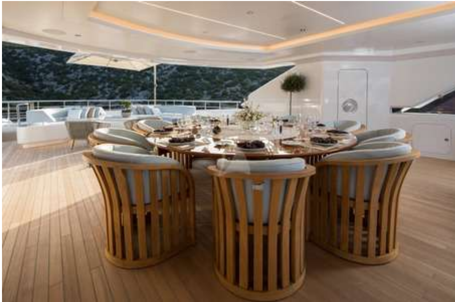
Dining Table Sundeck