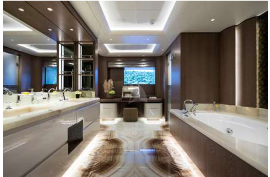
Master Cabin En suite facilities