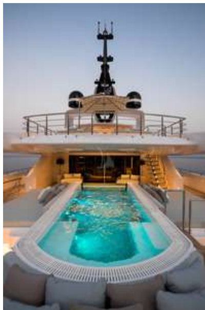
Bridge Deck Swimming Pool