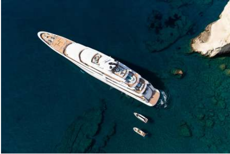
Tenders & Toys