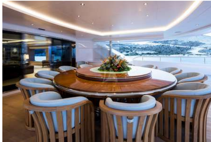
Dining Table Upper Deck