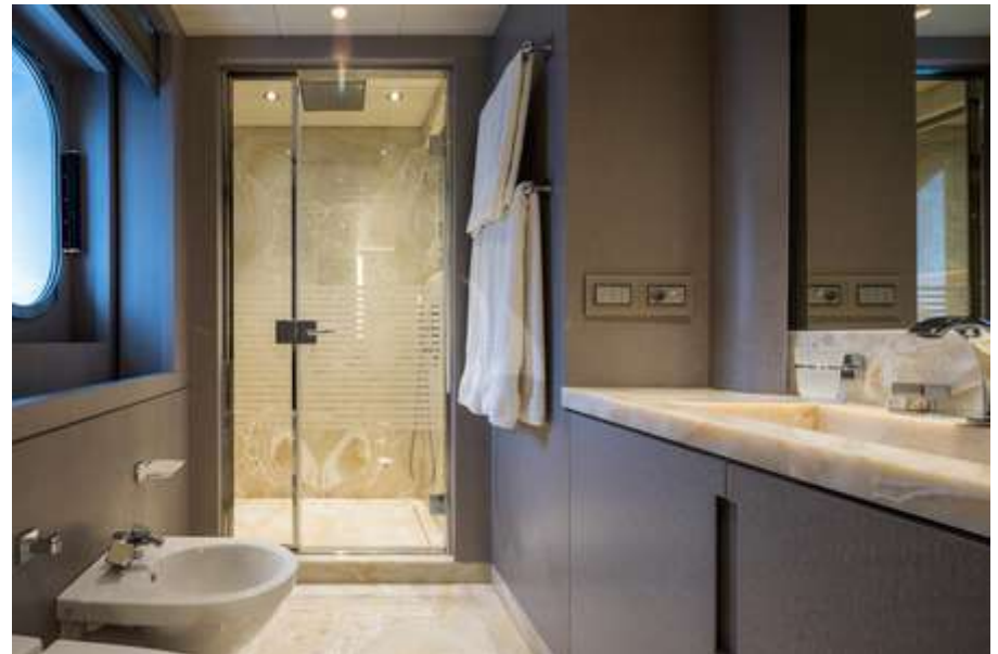
Staff Cabin En suite facilities