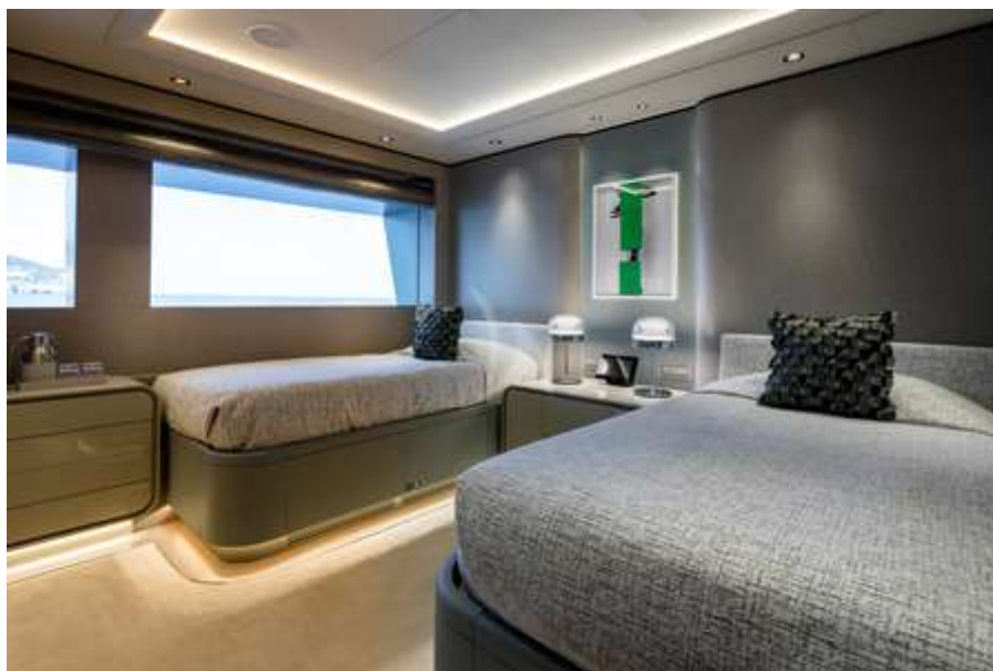
Guest Cabin 7