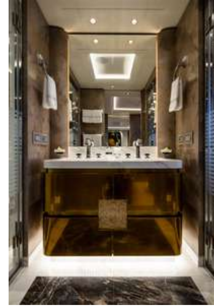
VIP Cabin En suite facilities