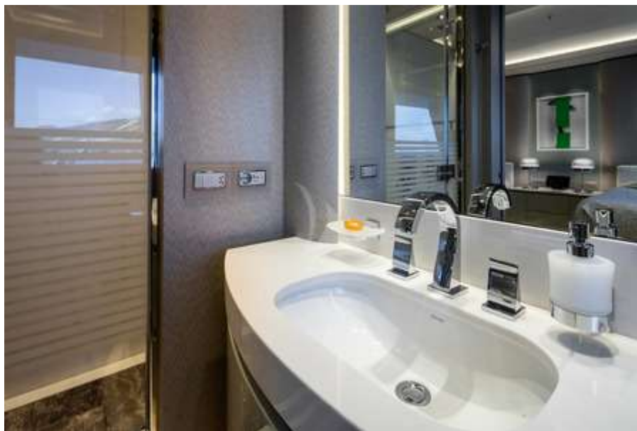
Guest Cabin 7 En suite facilities