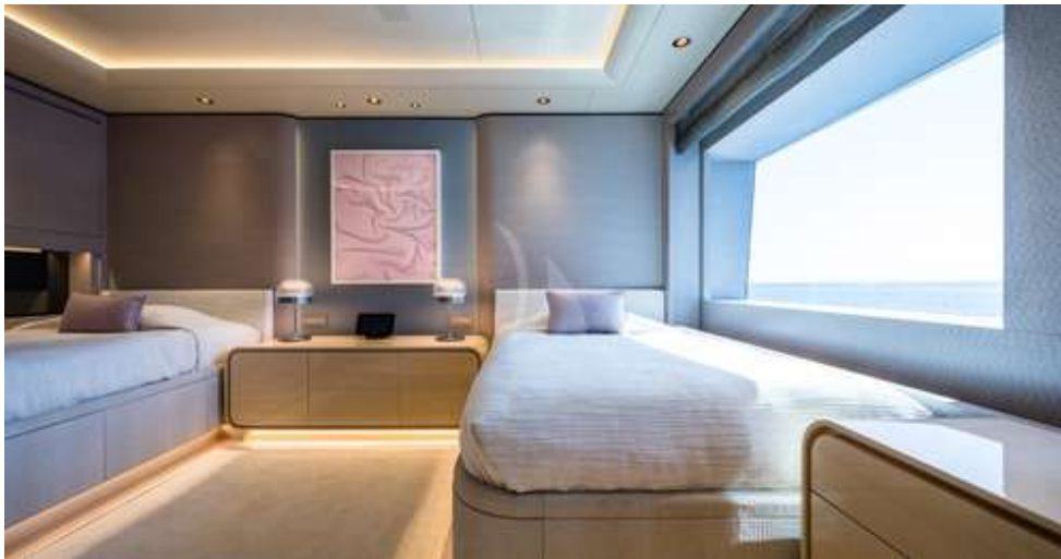
Guest Cabin 2