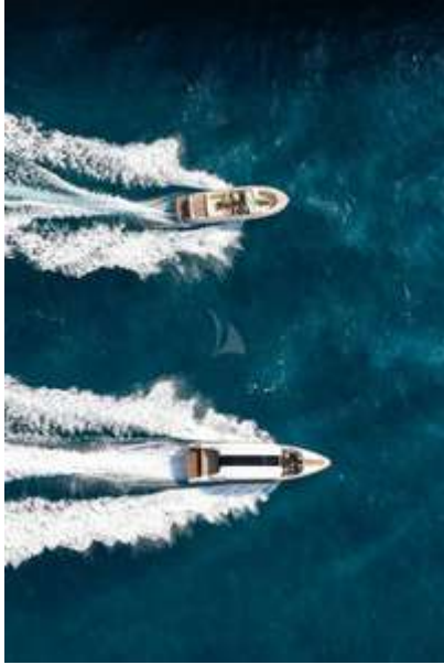
Limo Tender & Chris Craft