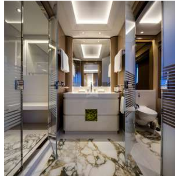
Salon Double Cabin En suite facilities