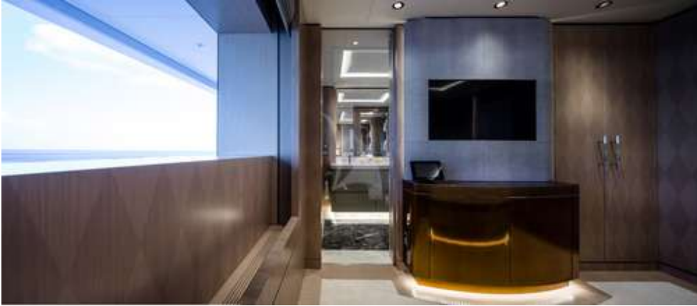
Guest Cabin 9