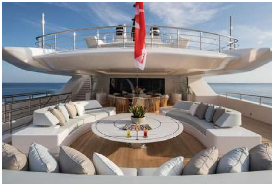
Upper Deck Aft