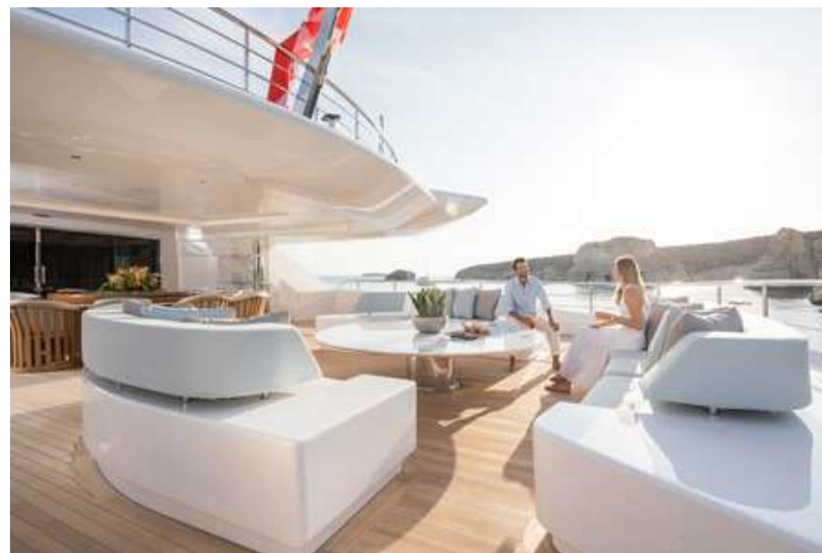
Upper Deck Aft