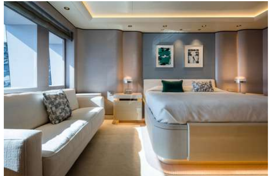
Guest Cabin 4