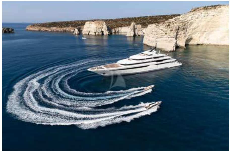
Tenders & Toys