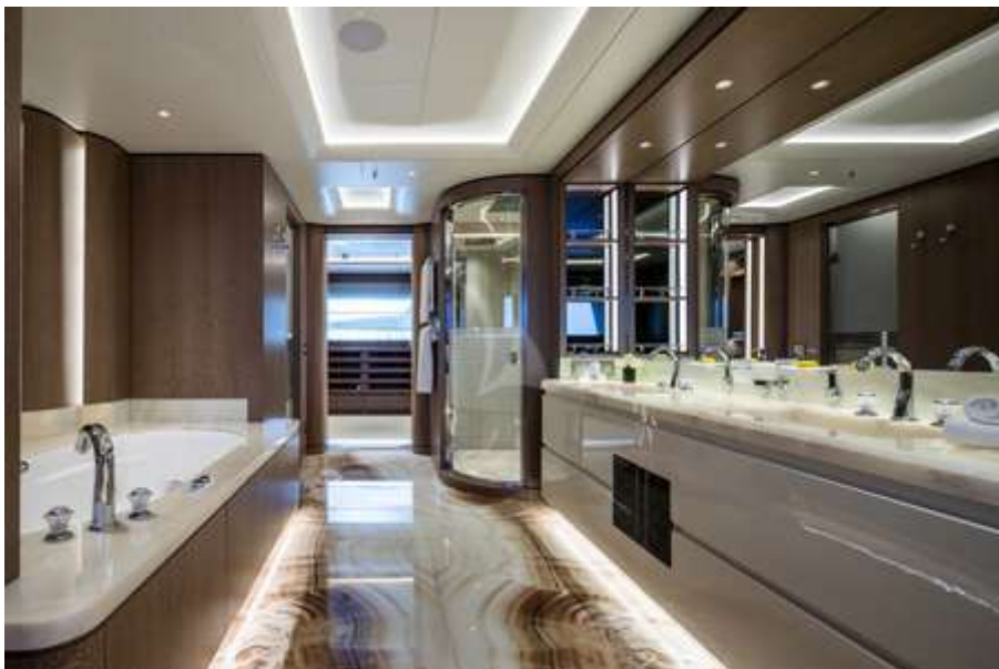
Master Cabin En suite facilities