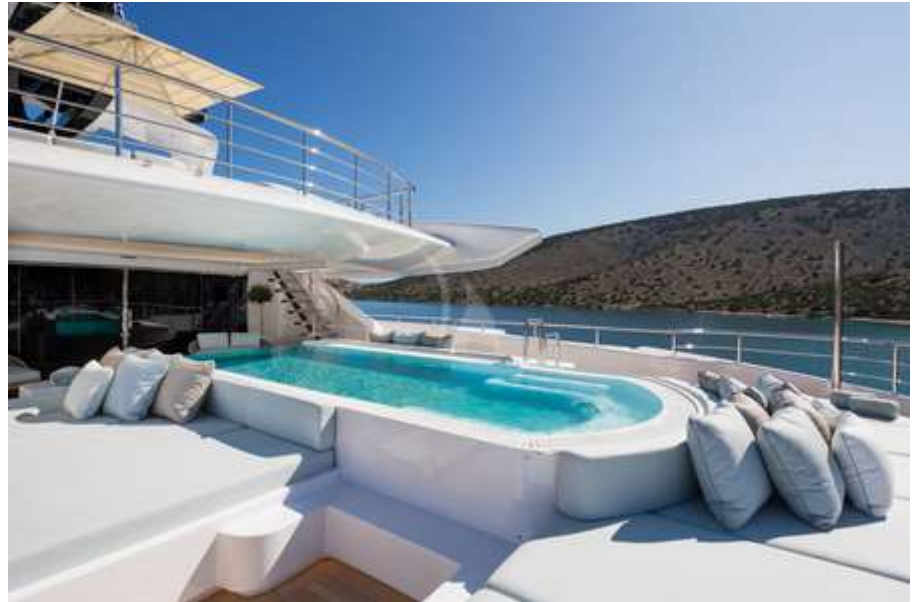
Bridge Deck Swimming Pool