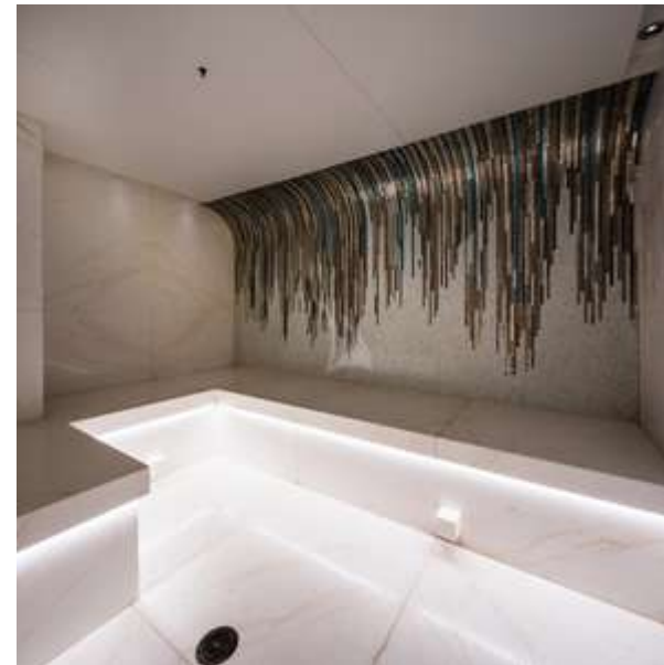
Turkish hammam Beach House