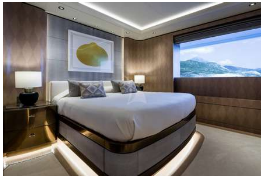
Guest Cabin 9