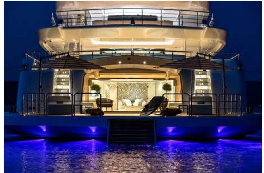
Beach House Night