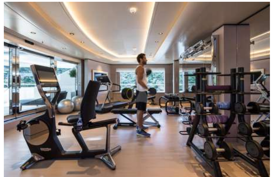
Gym Bridge Deck