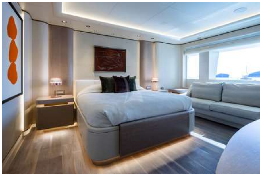
Guest Cabin 6