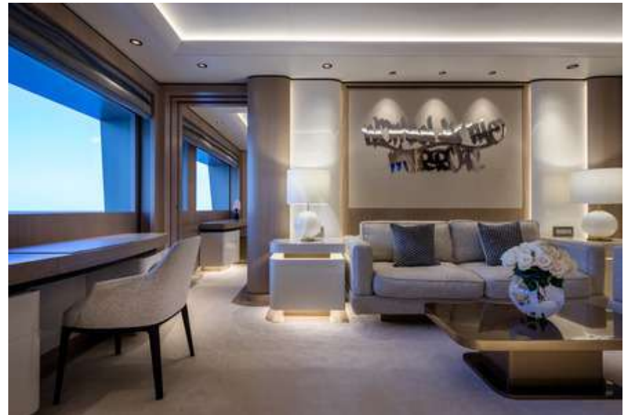
Salon Double Cabin