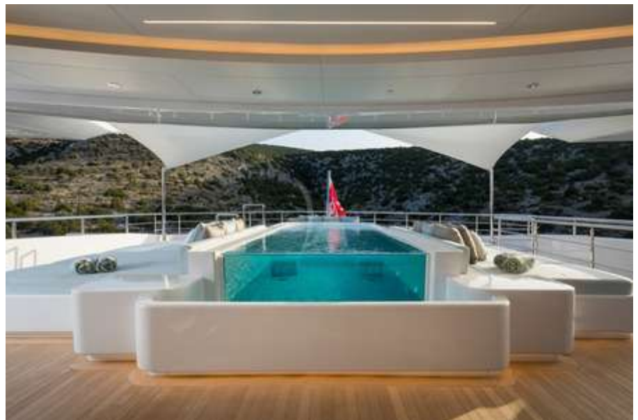
Bridge Deck Swimming Pool