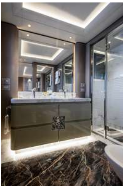
Guest Cabin 8 En suite facilities