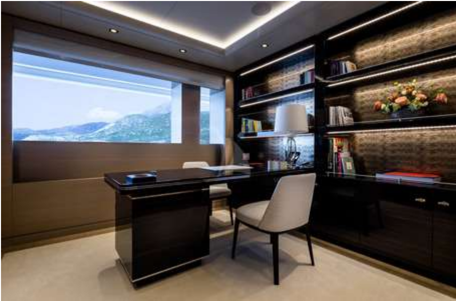
Study Room Upper Deck