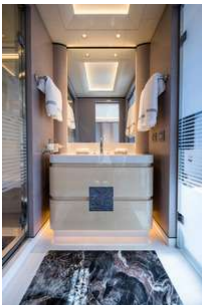
Guest Cabin 4 En suite facilities