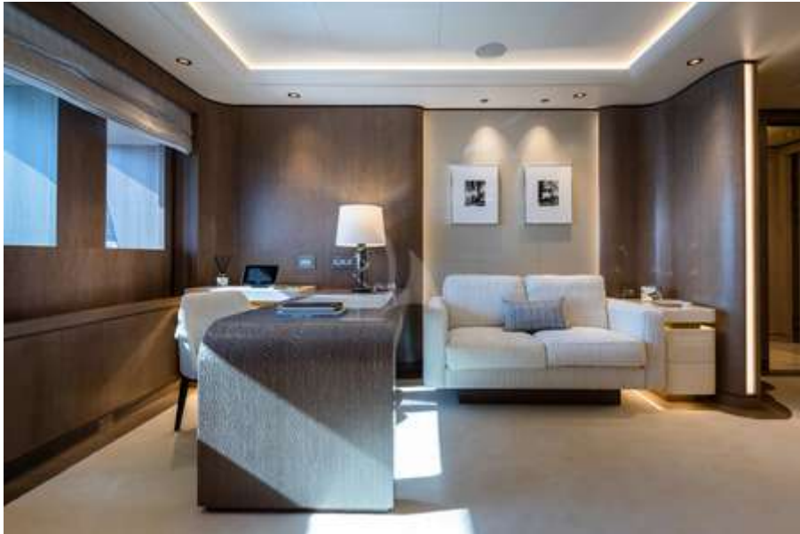
Master Cabin Office