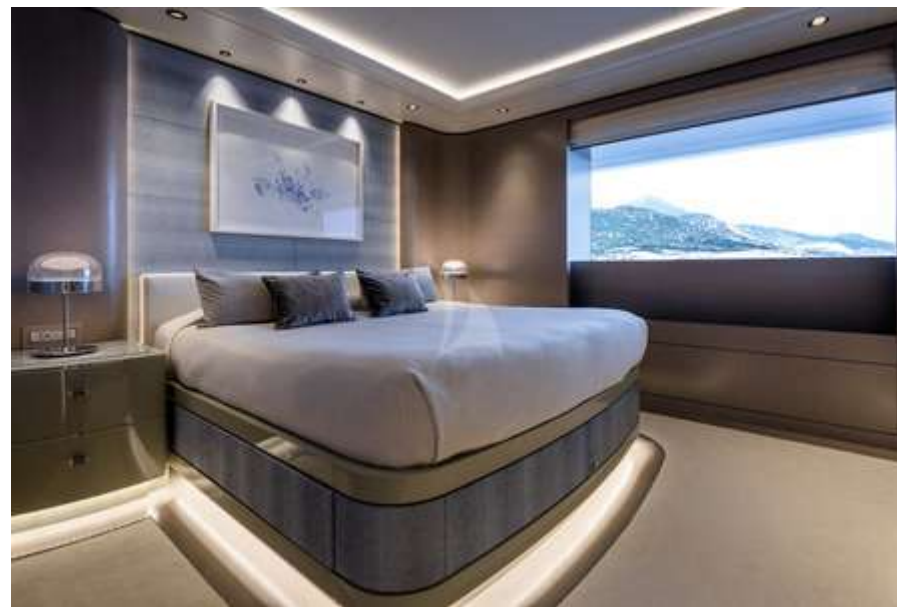
Guest Cabin 8