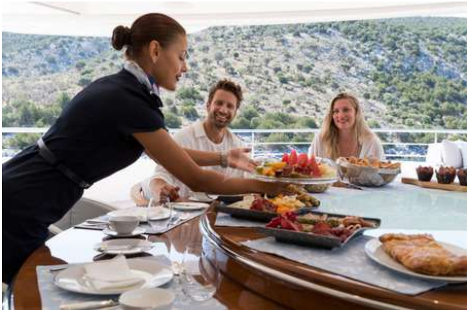
Dining Table Upper Deck