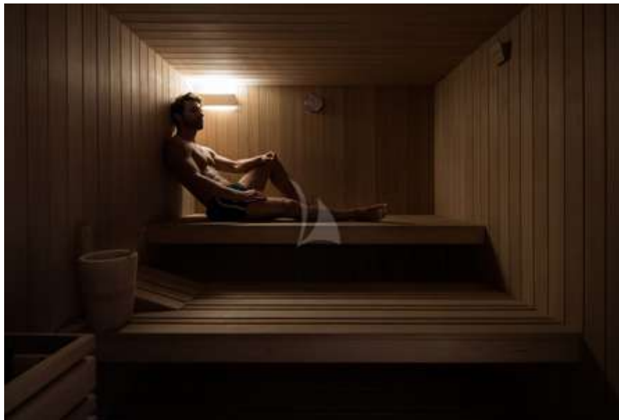
Dry Finnish Sauna Beach House