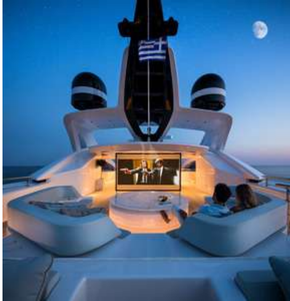
Outdoor Cinema Sundeck