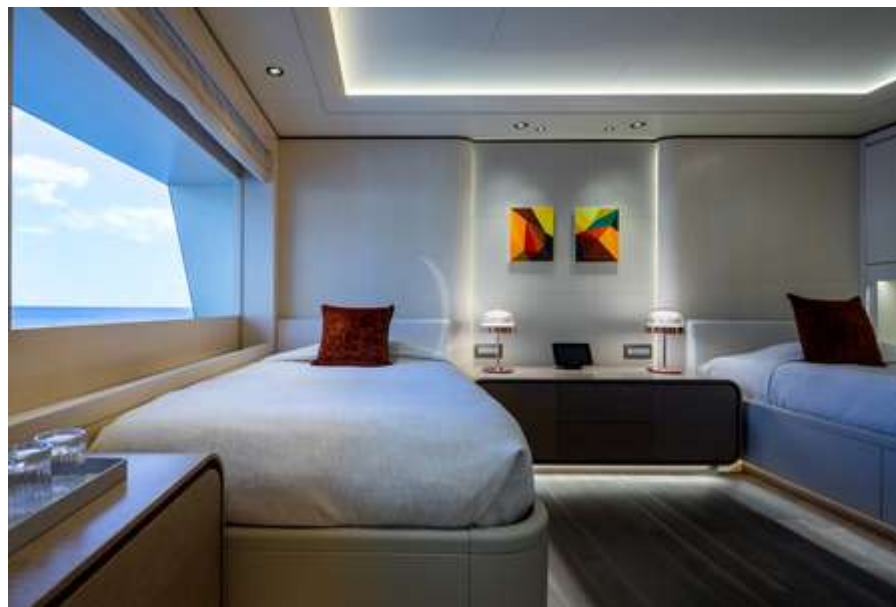
Guest Cabin 5