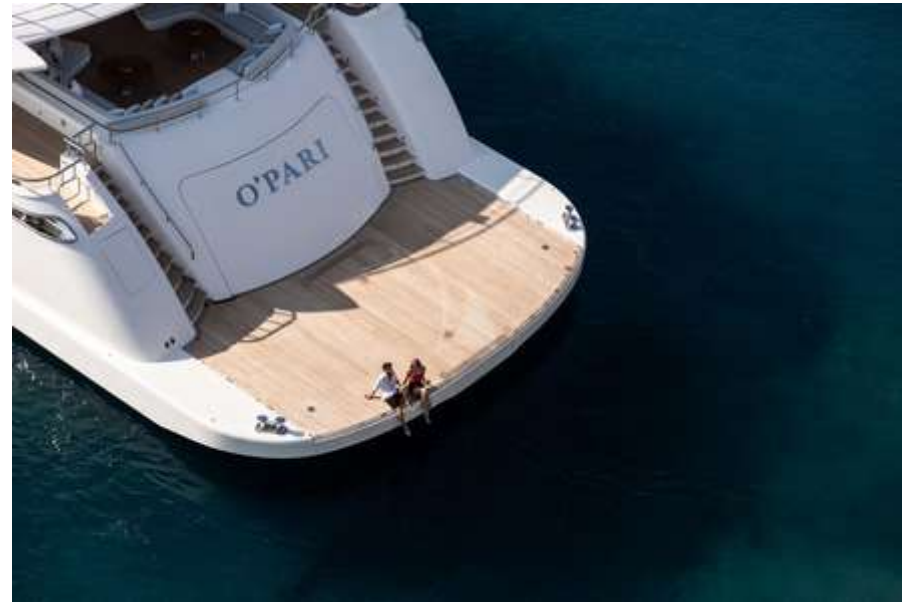
Swimming Platform Aerial