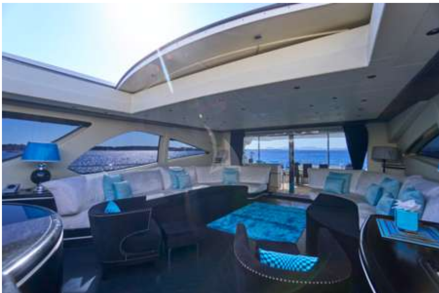
Living Room with Open Hard Top 1