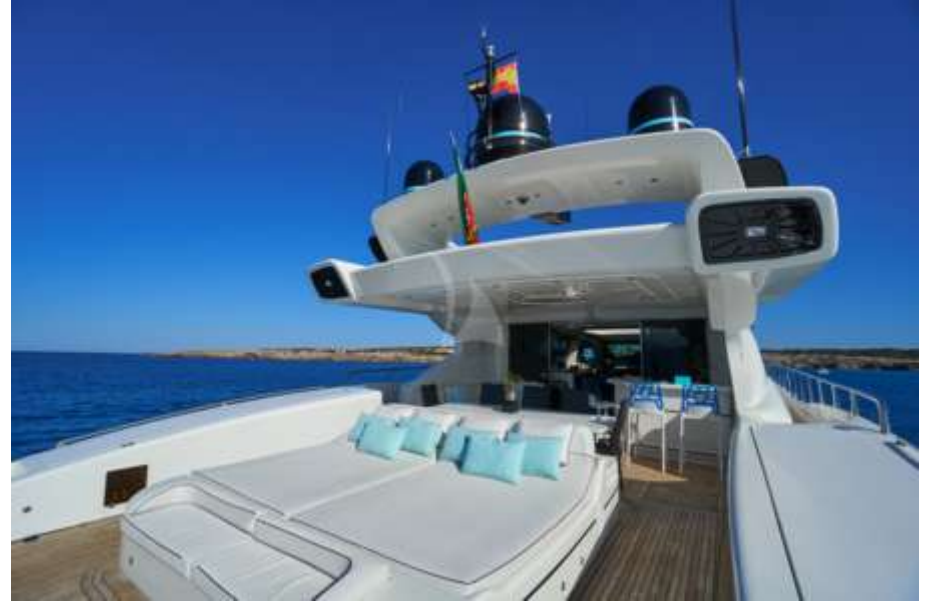
Aft Deck Sunbath 1