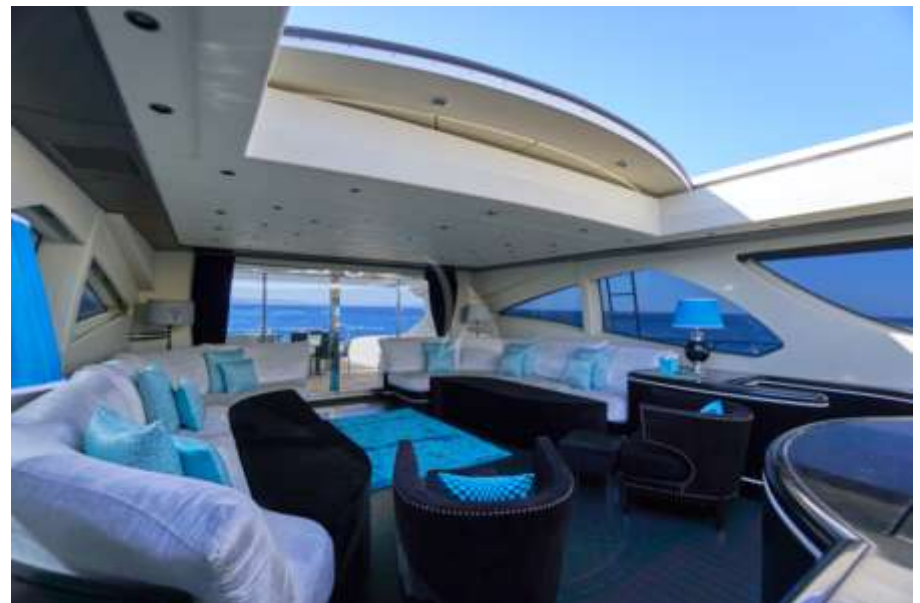
Living Room with Open Hard Top 2