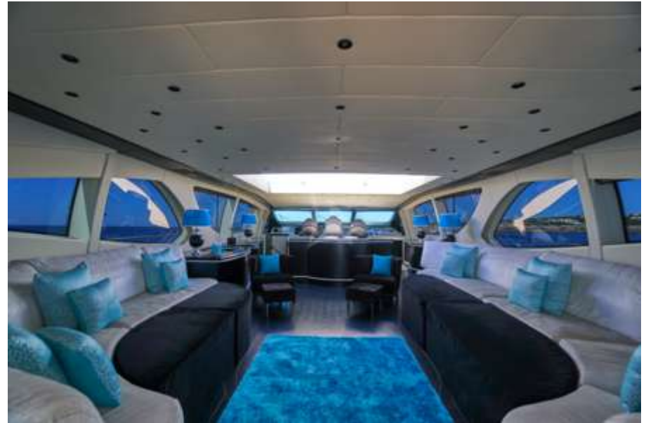
Living Room picture 2