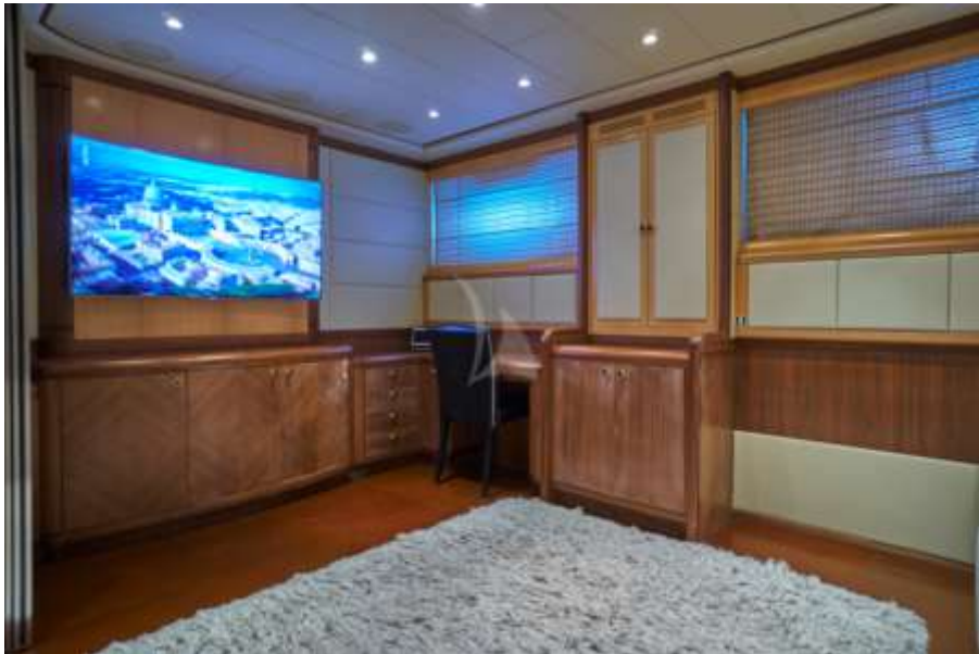
Lower Deck Living Space