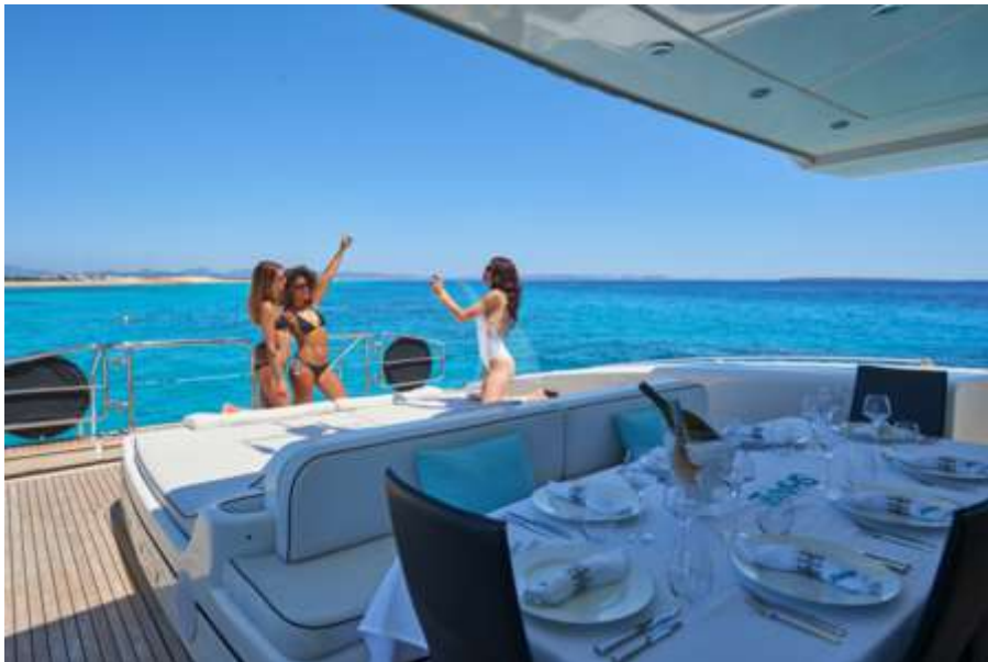
Aft Deck Sunbath 2