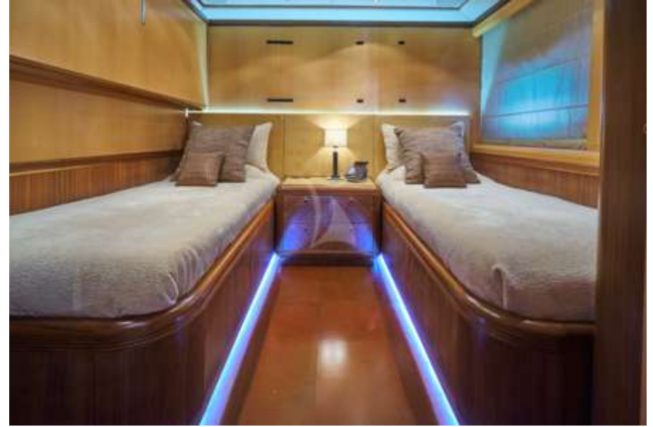
Twin Cabin with Pullman