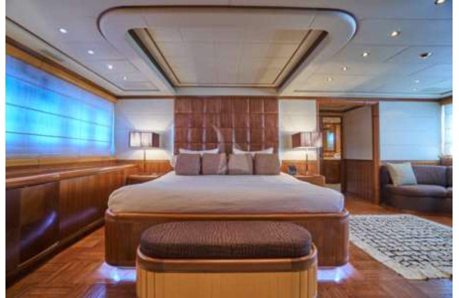
Master Cabin picture 1