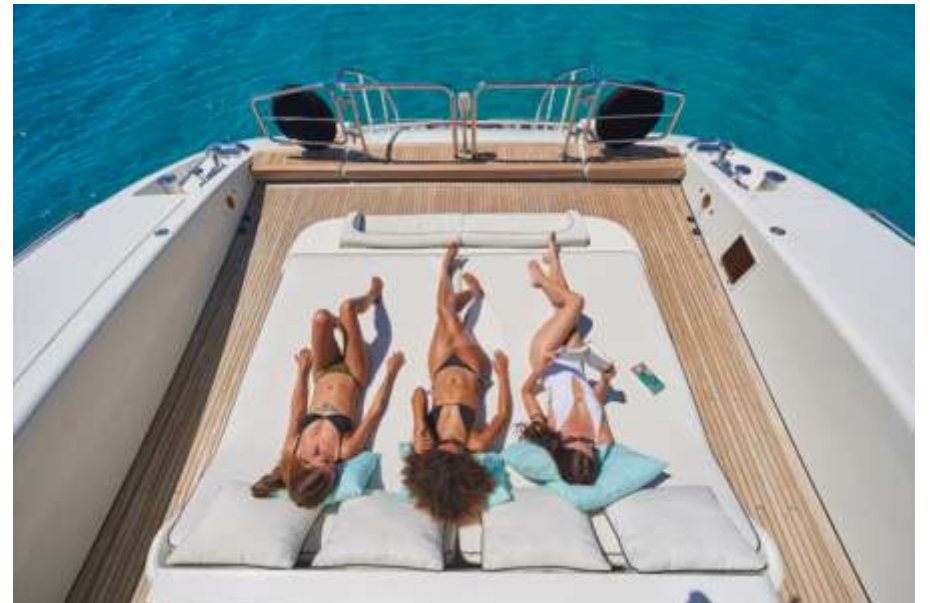
Aft Deck Sunbath 3