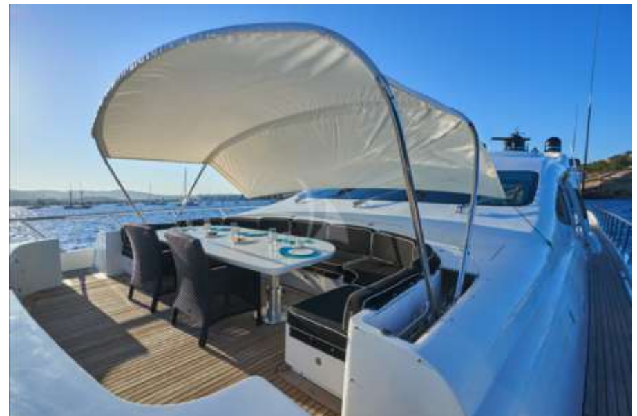
Foredeck Alfresco Area