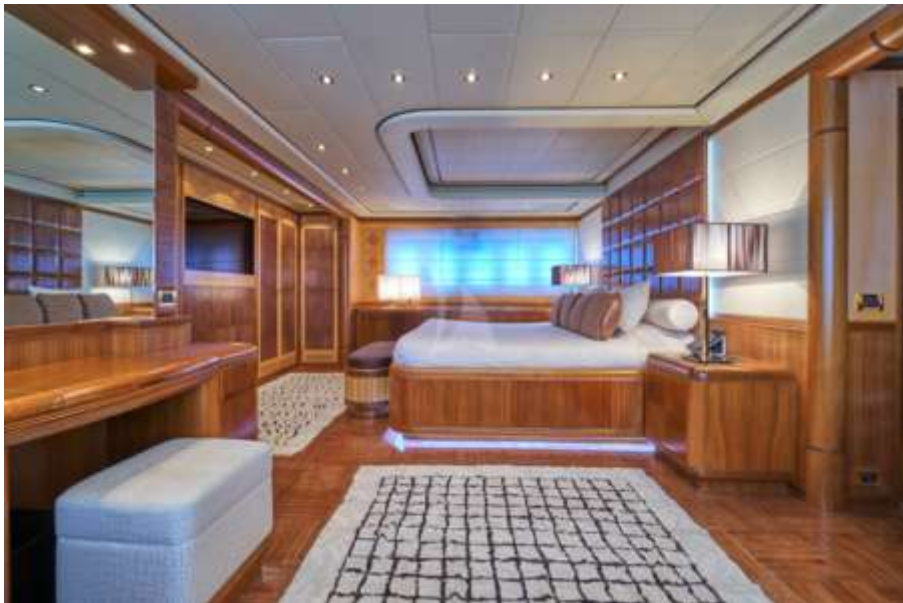
Master Cabin picture 2