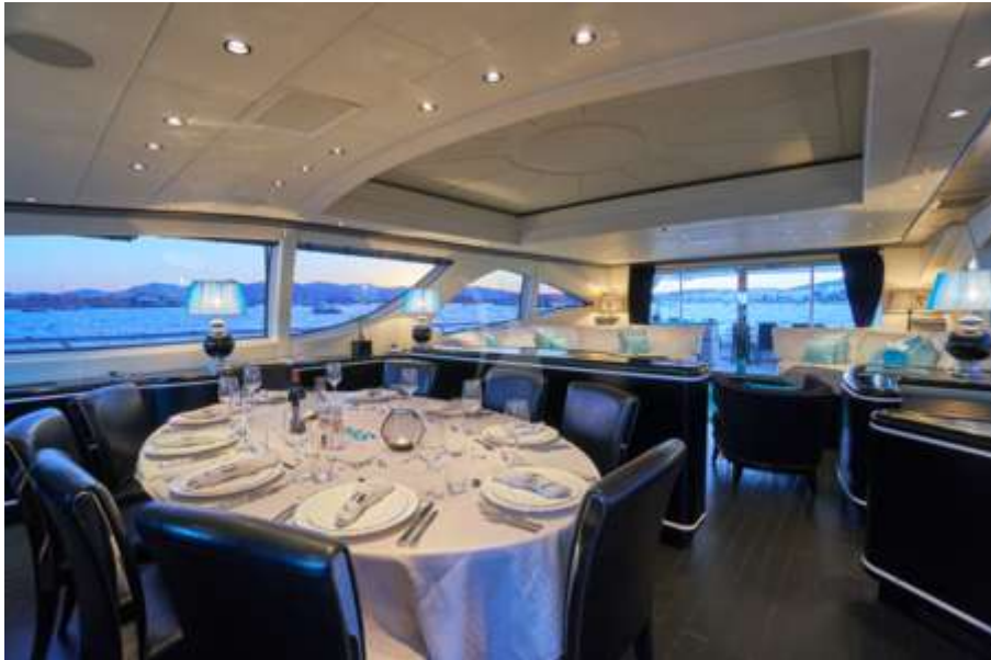
Living Room picture 1