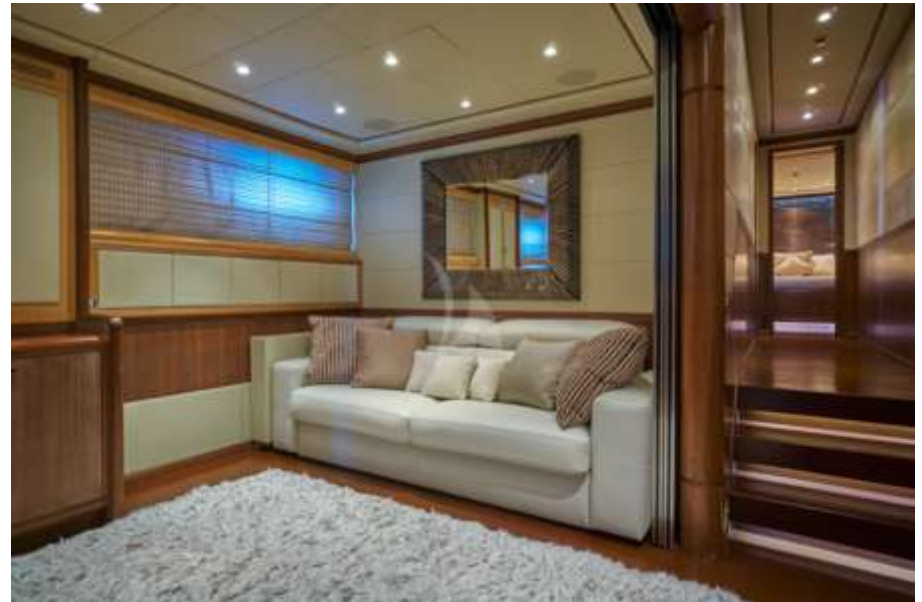
Lower Deck Living Space convertible to Double Bed