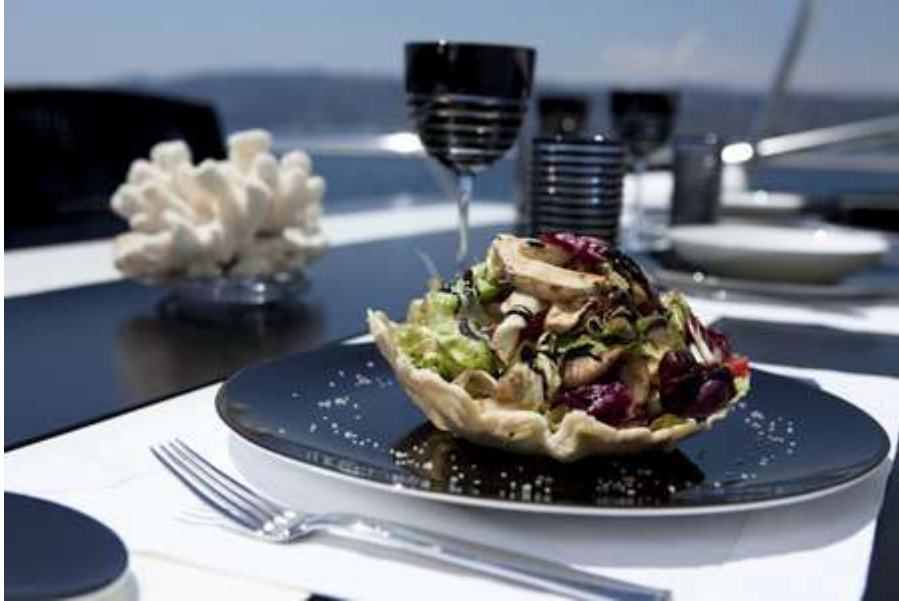
SHANE - Sample dish