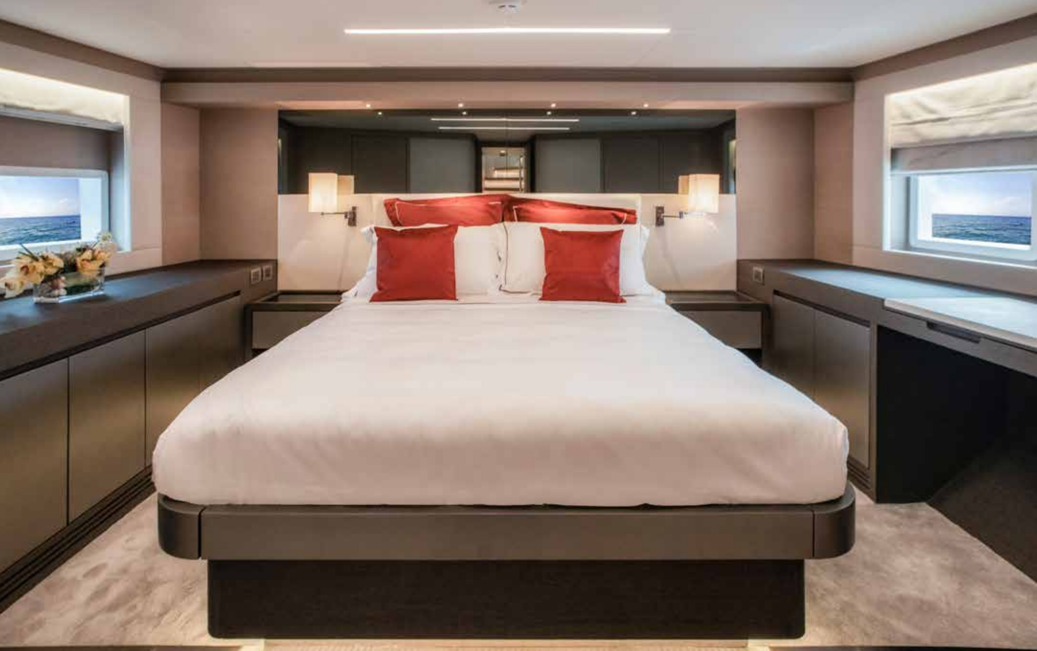
Forward VIP Stateroom