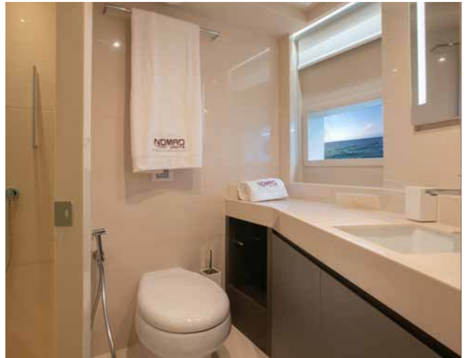
Twin Guest Stateroom | VIP En Suite