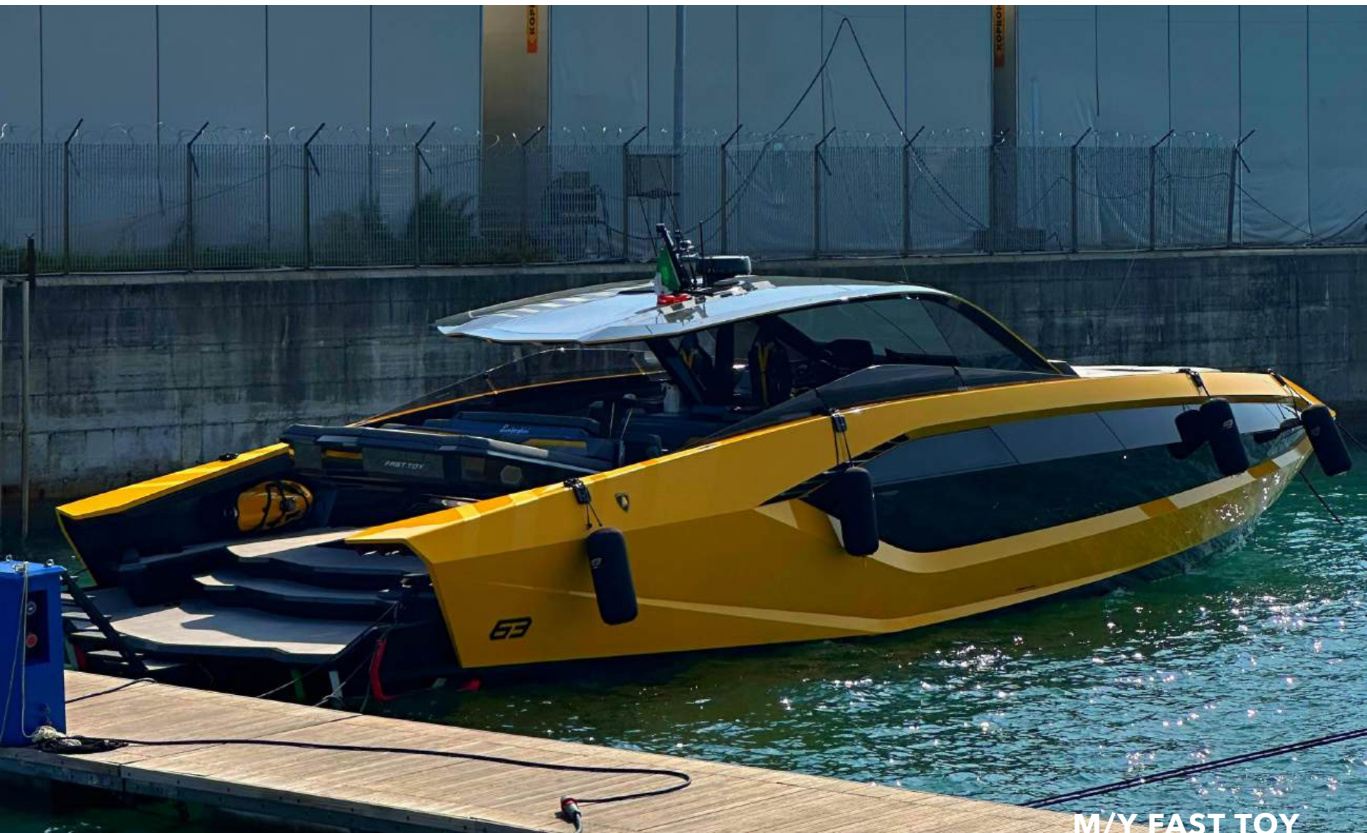
M/Y FAST TOY