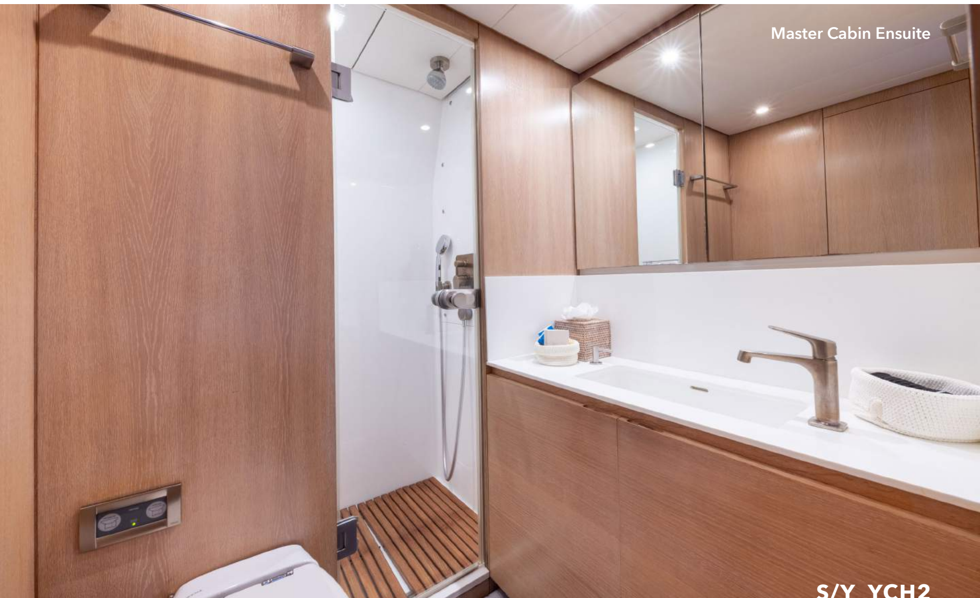
Master Cabin Ensuite