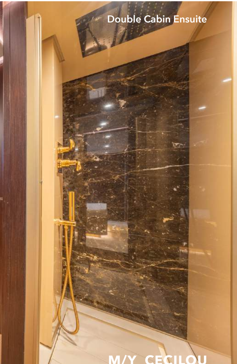
Double Cabin Ensuite