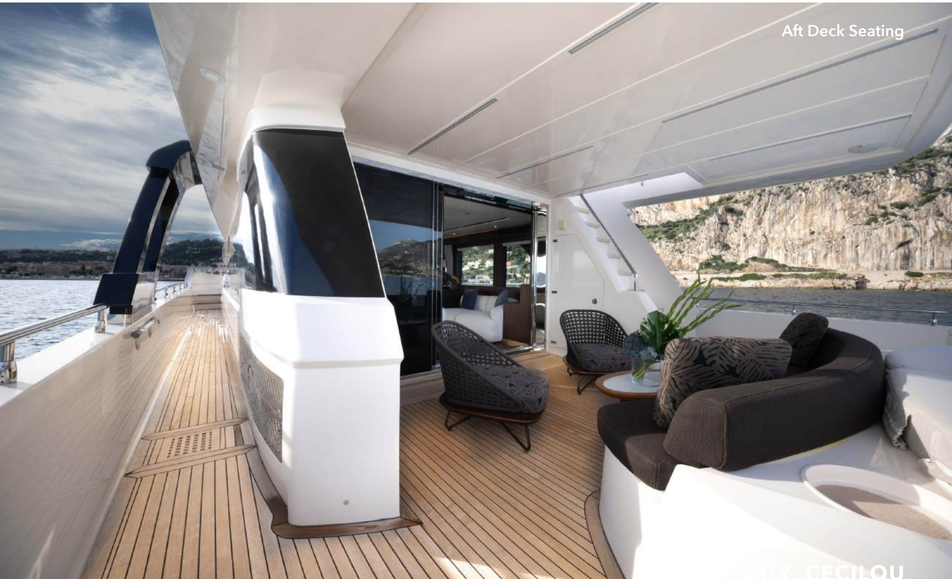
Aft Deck Seating