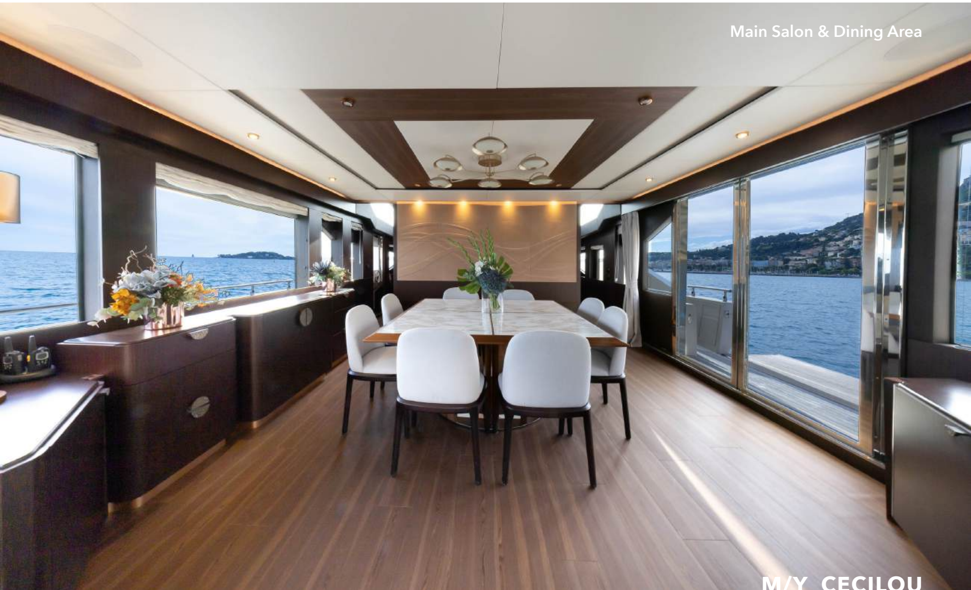
Main Salon & Dining Area