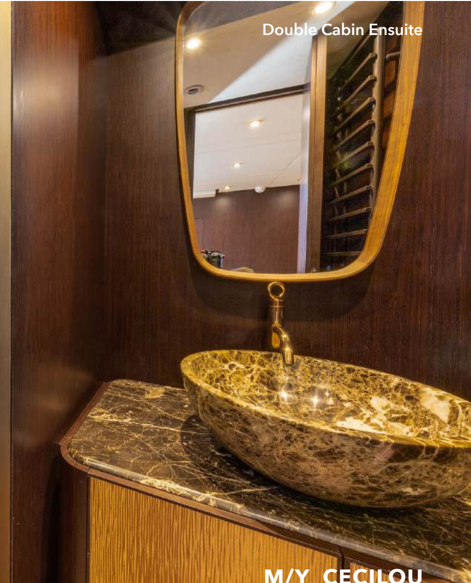
Double Cabin Ensuite