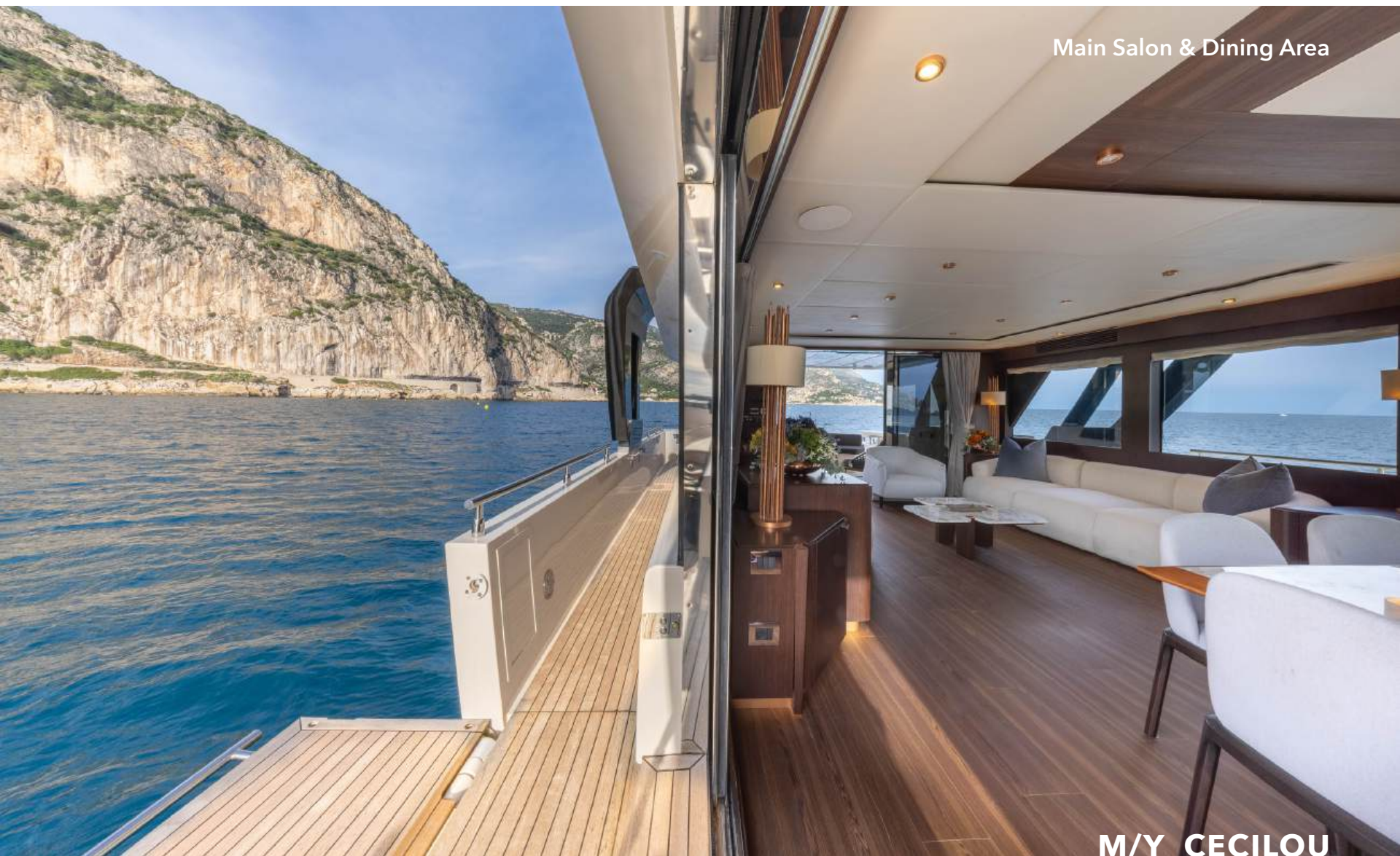
Main Salon & Dining Area