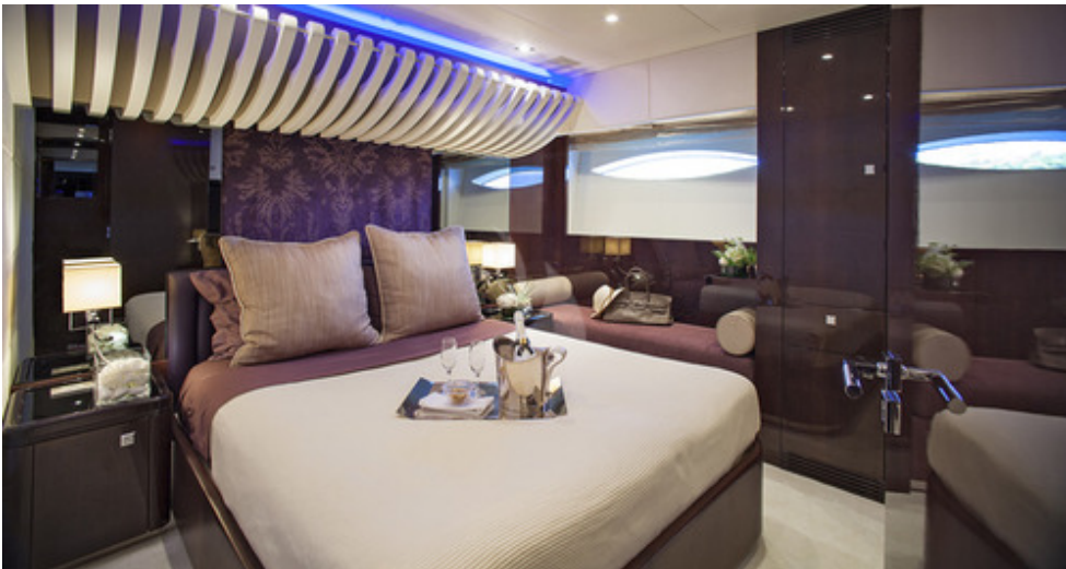
VIP I Suite