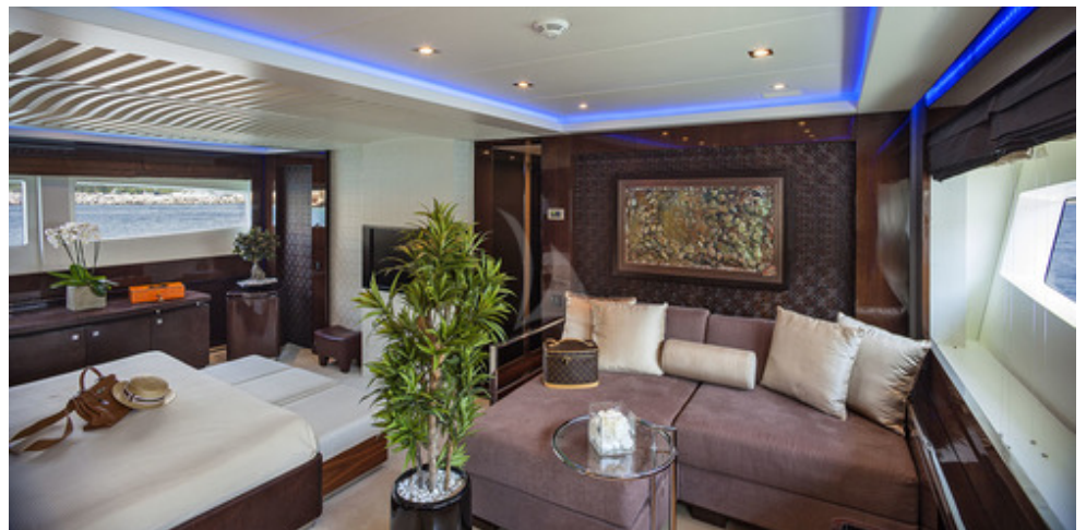
master presidential a