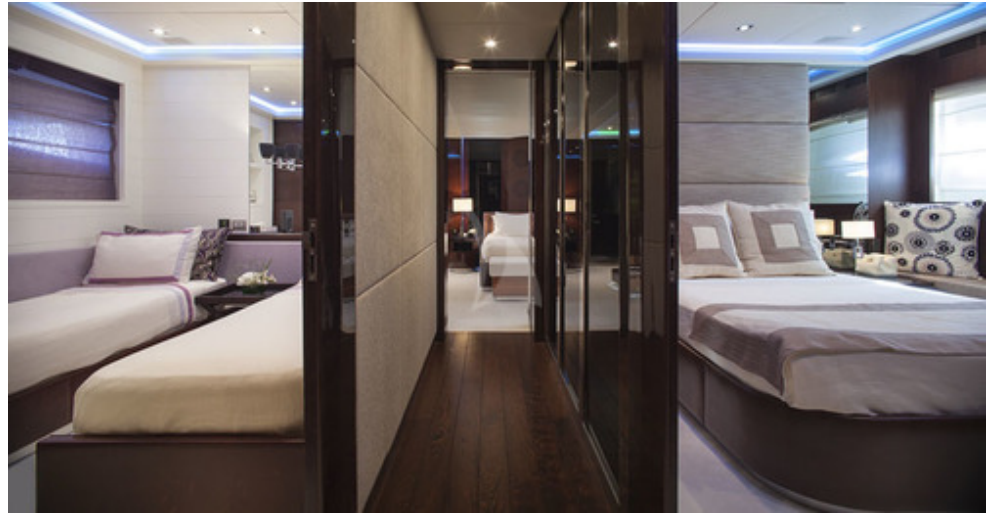
Parallel View VIP and Twin