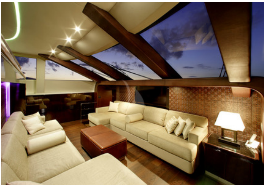
bow private playroom