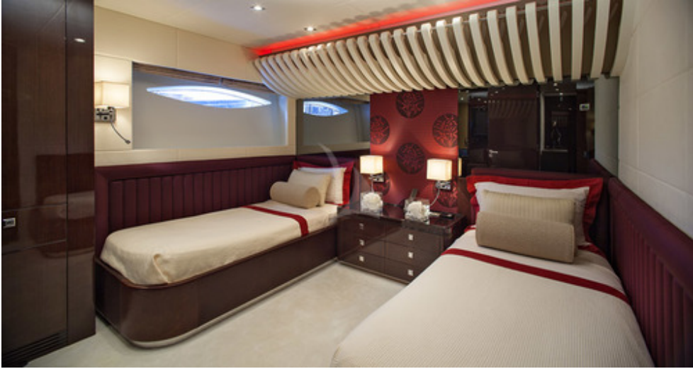
Twin II stateroom