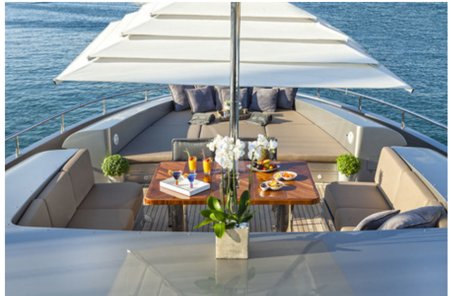
bow private space b