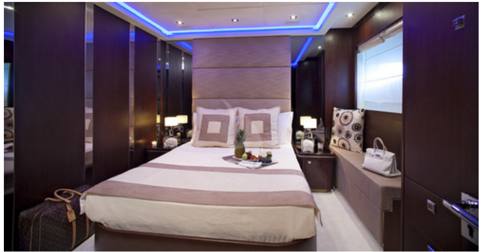
VIP II Suite