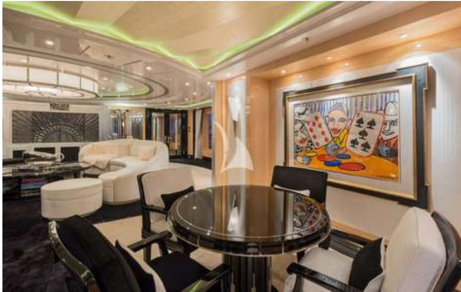
Upper Deck Salon - Gaming Table