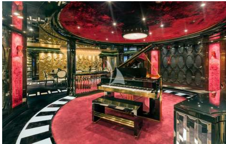
Piano & Music Rotunda