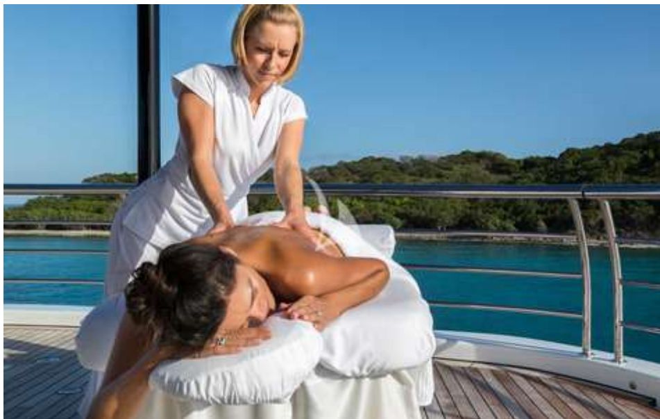
Bridge Deck - Massage Station