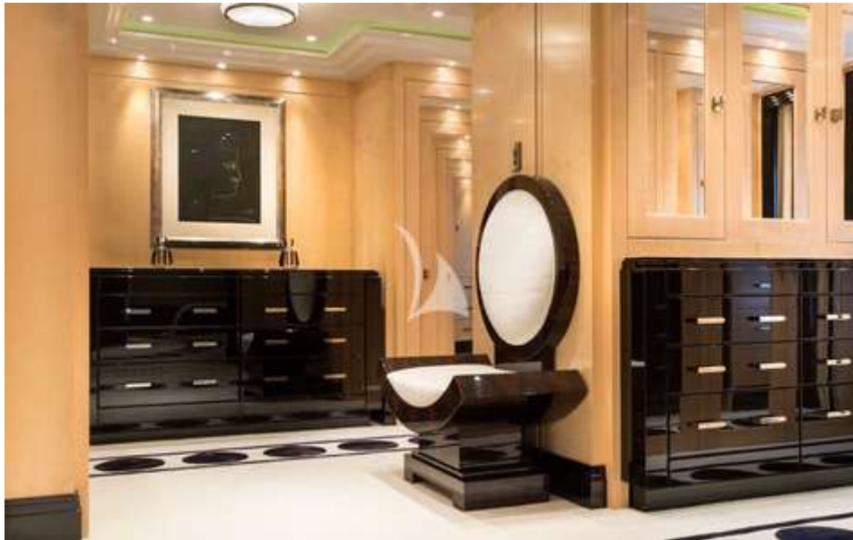
Master Suite Wardrobe