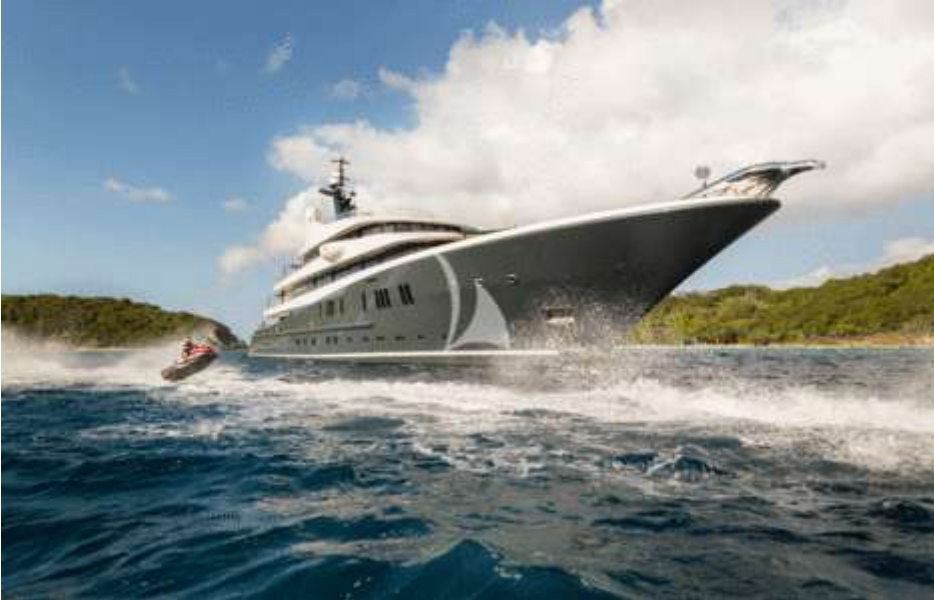
M/Y PHOENIX 2