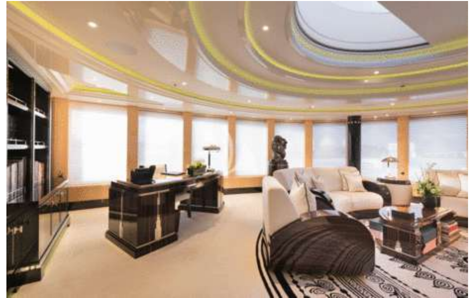
Observation Lounge - Owner's Office