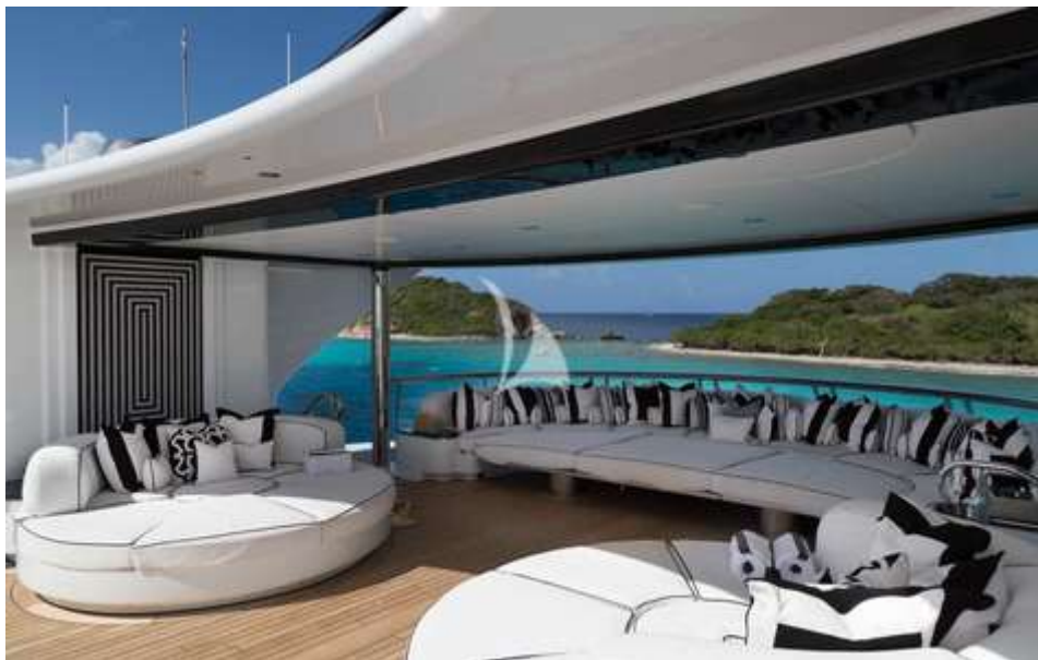
Sun Deck Aft Lounge