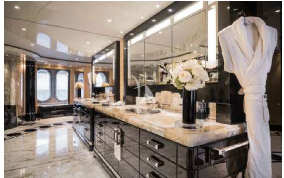
Master Suite - His & Her Baths