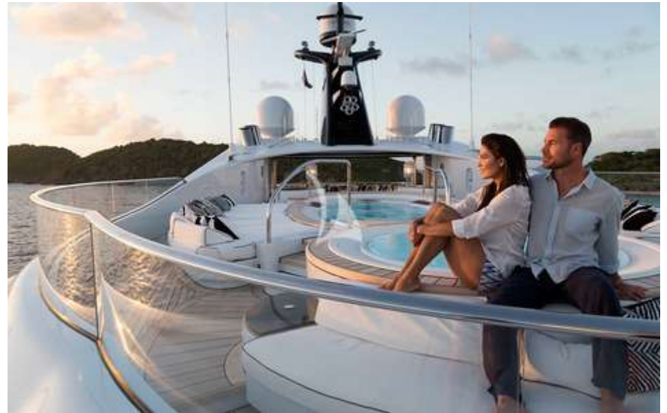
Pool & Jacuzzi