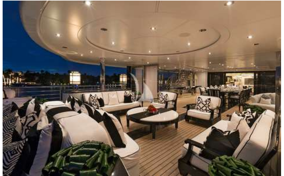
Aft Deck Lounge