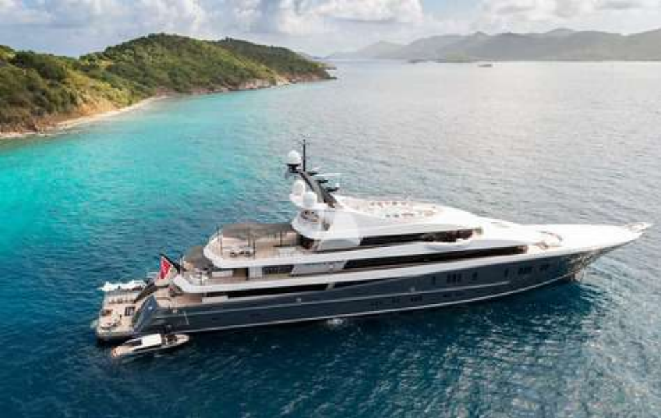
M/Y PHOENIX 2