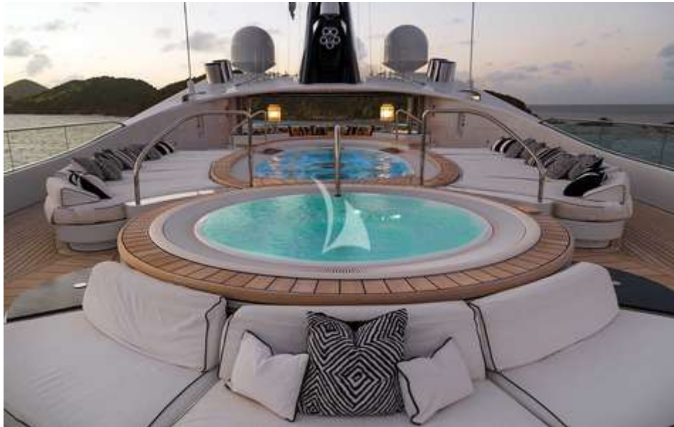
Pool & Jacuzzi