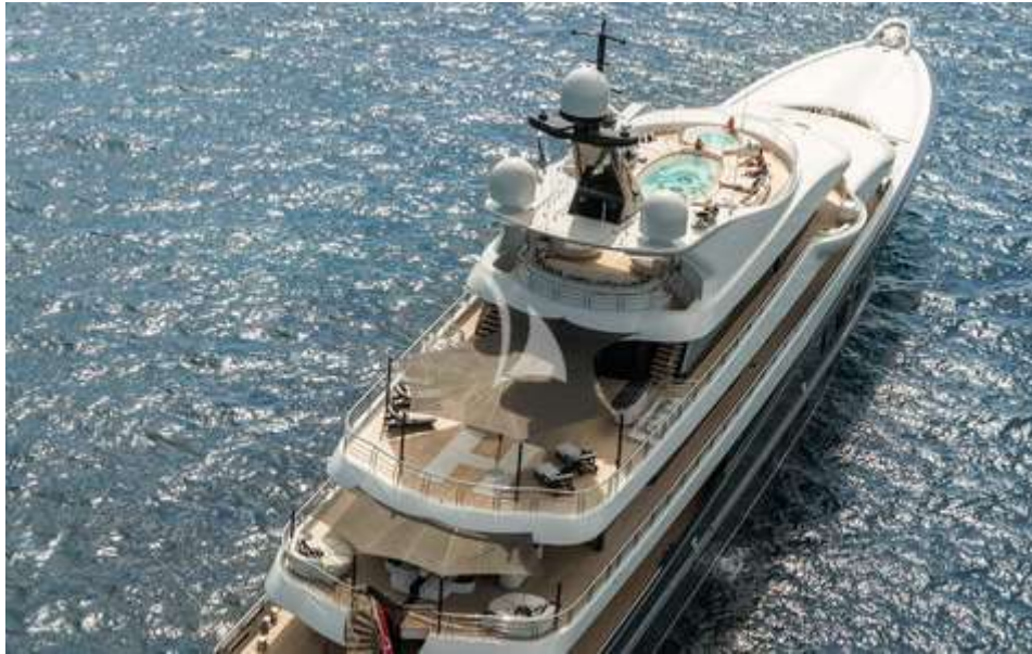
M/Y PHOENIX 2