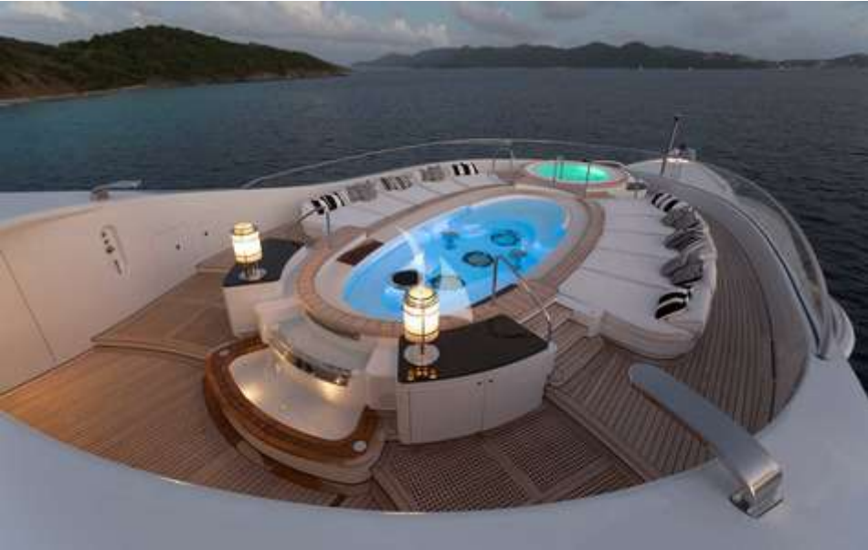
Sun Deck Pool & Jacuzzi