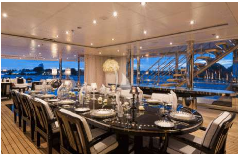
Aft Deck Dining - Sliding Glass Doors Around