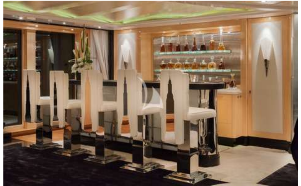
Upper Deck Lounge Bar