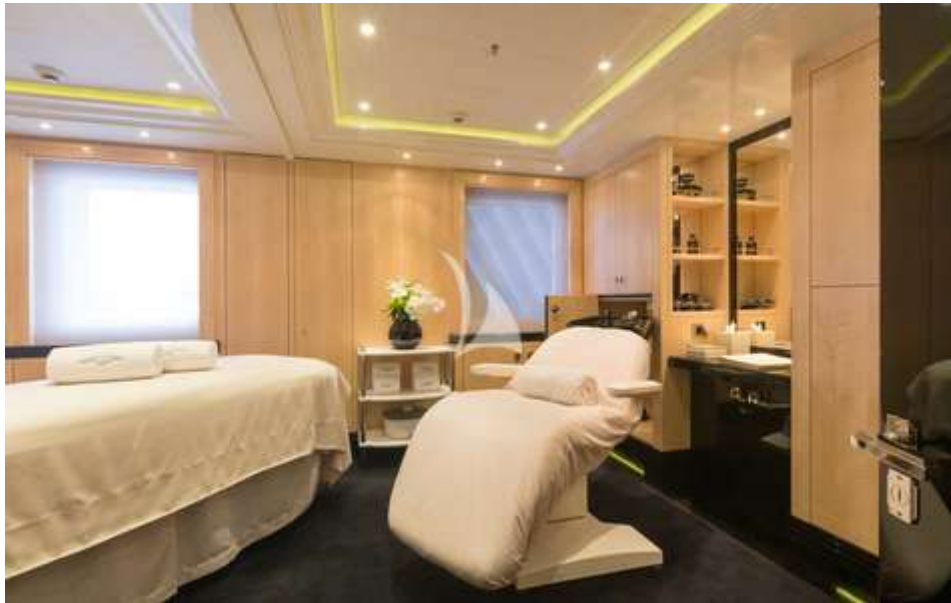
Spa & Beauty Salon