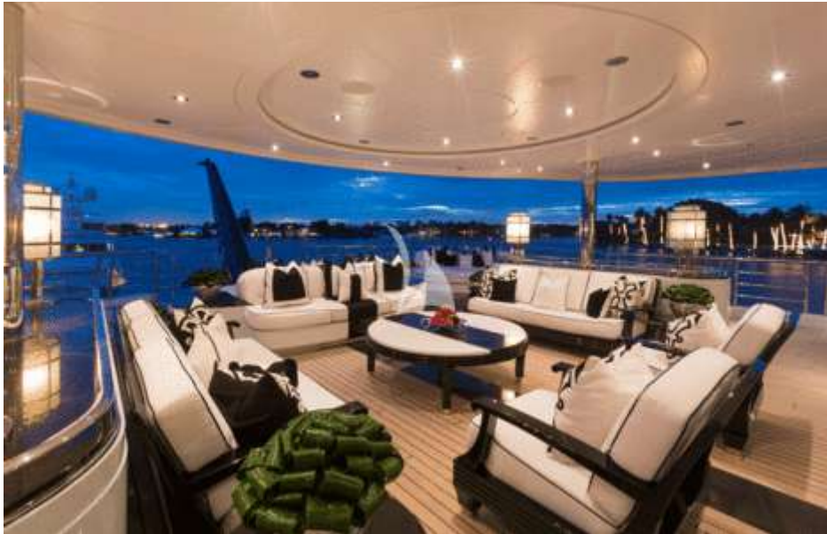
Aft Deck Lounge