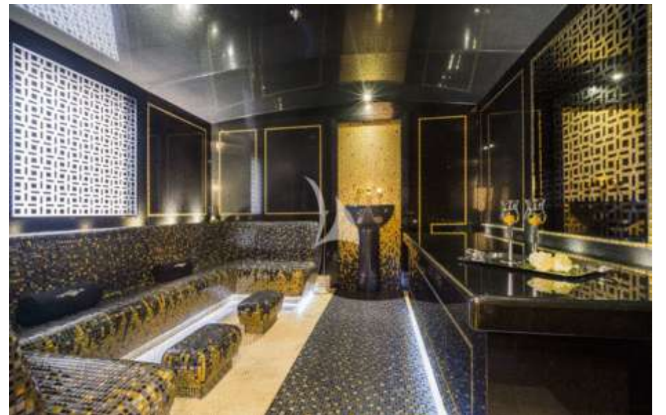
Hammam / Steam Room