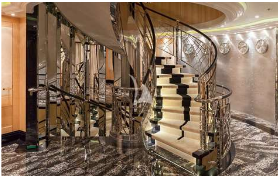
Main Deck Foyer Reception Hall