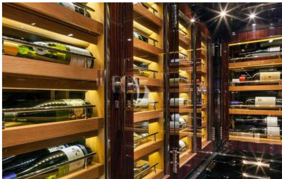
Wine Room & Sommelier Station