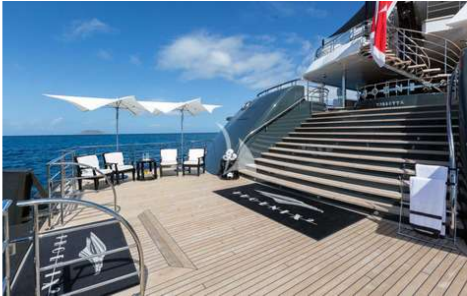
Swim Platform & Beach Deck