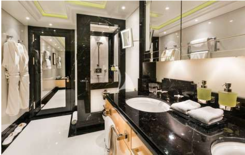
Guest Suite Bathroom