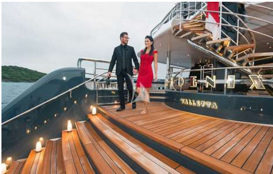
Swim Platform & Beach Deck