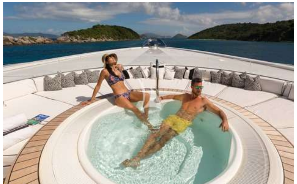
Forward Deck Jacuzzi with Sun Lounge