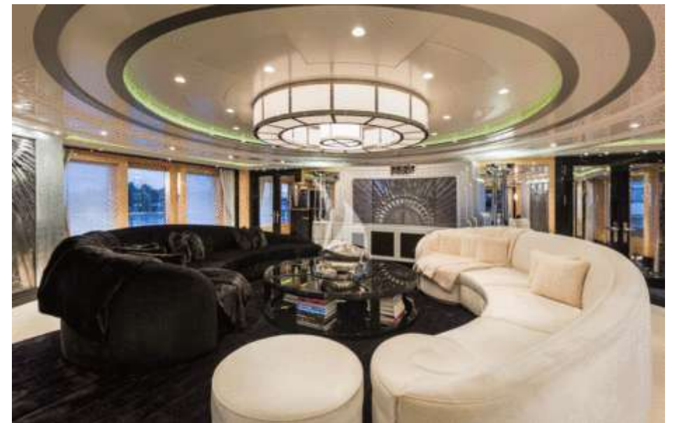
Upper Deck Salon