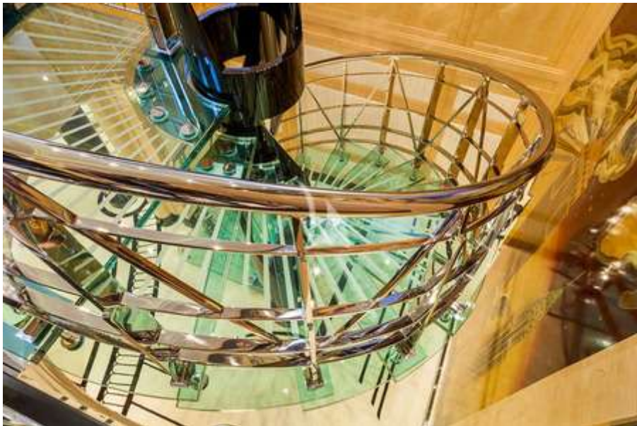
Stairway Between Master Suite & Owner's Lounge