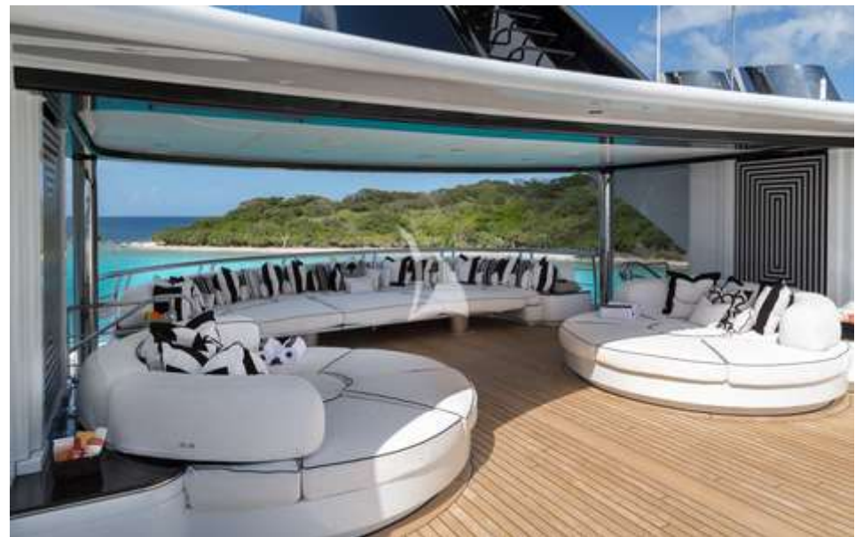
Sun Deck Aft Lounge