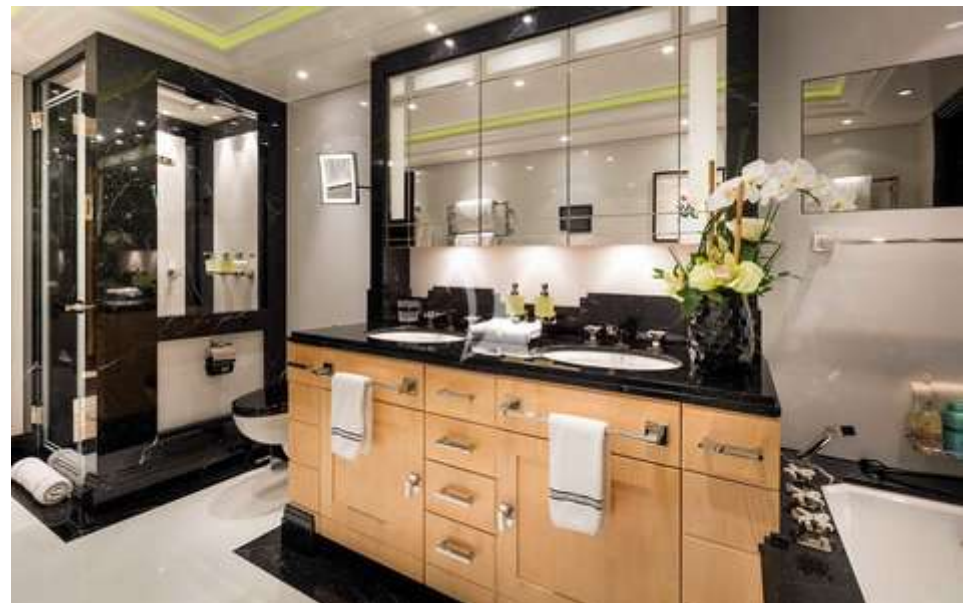
Guest Suite Bathroom