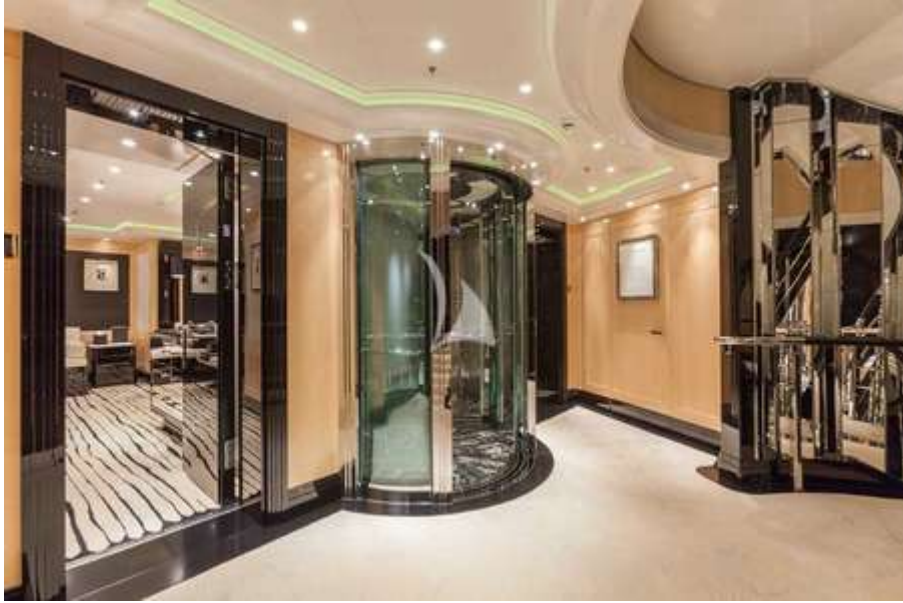
Main Deck - Reception with Lift