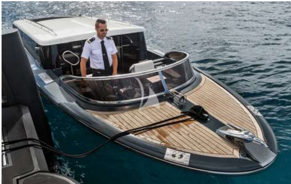
Stern Tender Boarding