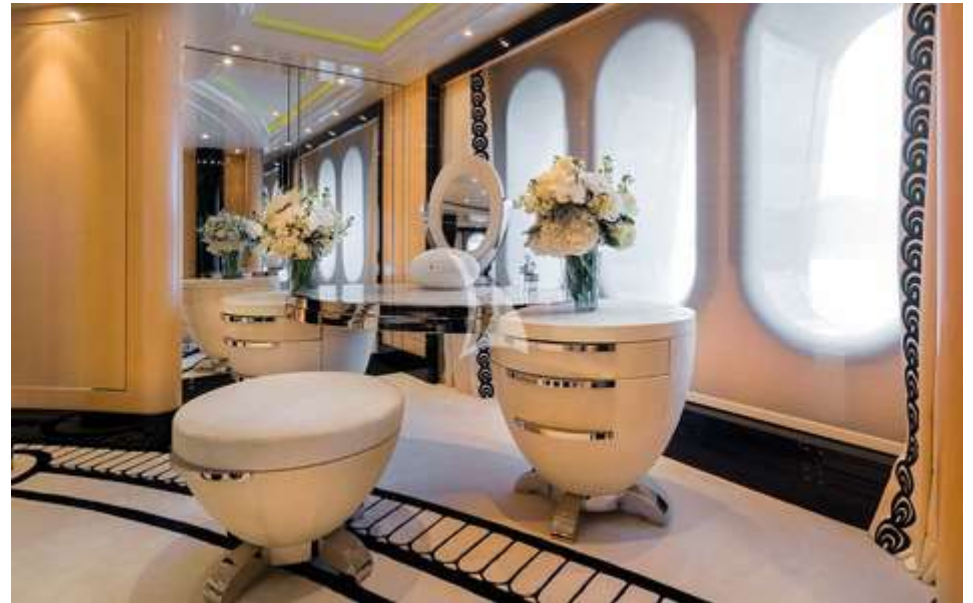
Master Suite - Vanity