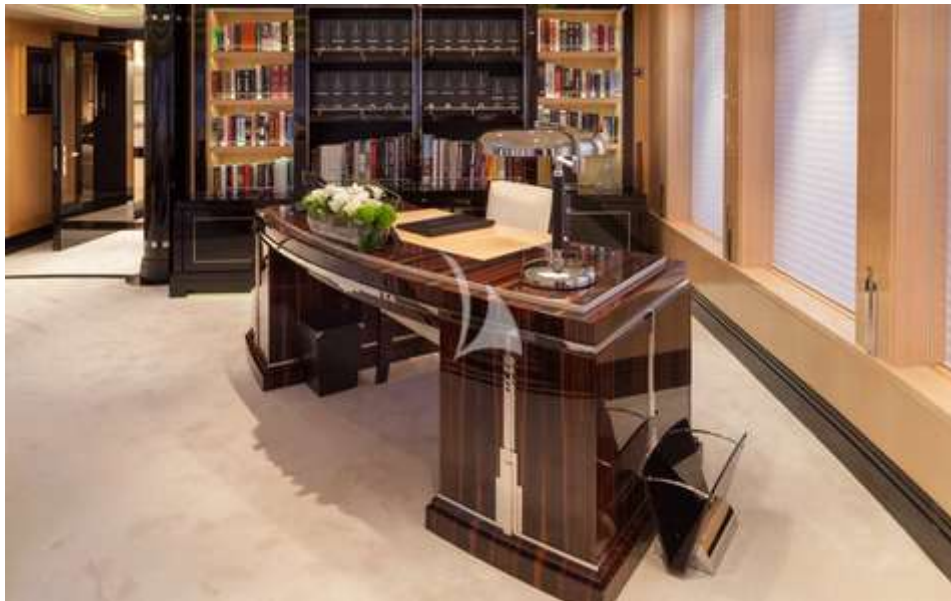
Observation Lounge - Owner's Office