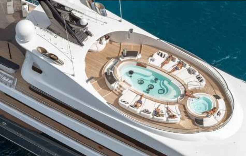
Sun Deck Pool & Jacuzzi