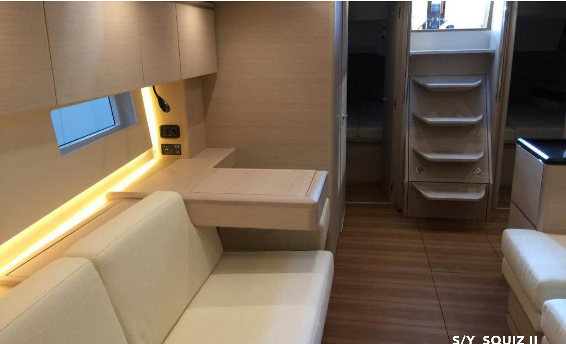
S/Y SOUIZ II