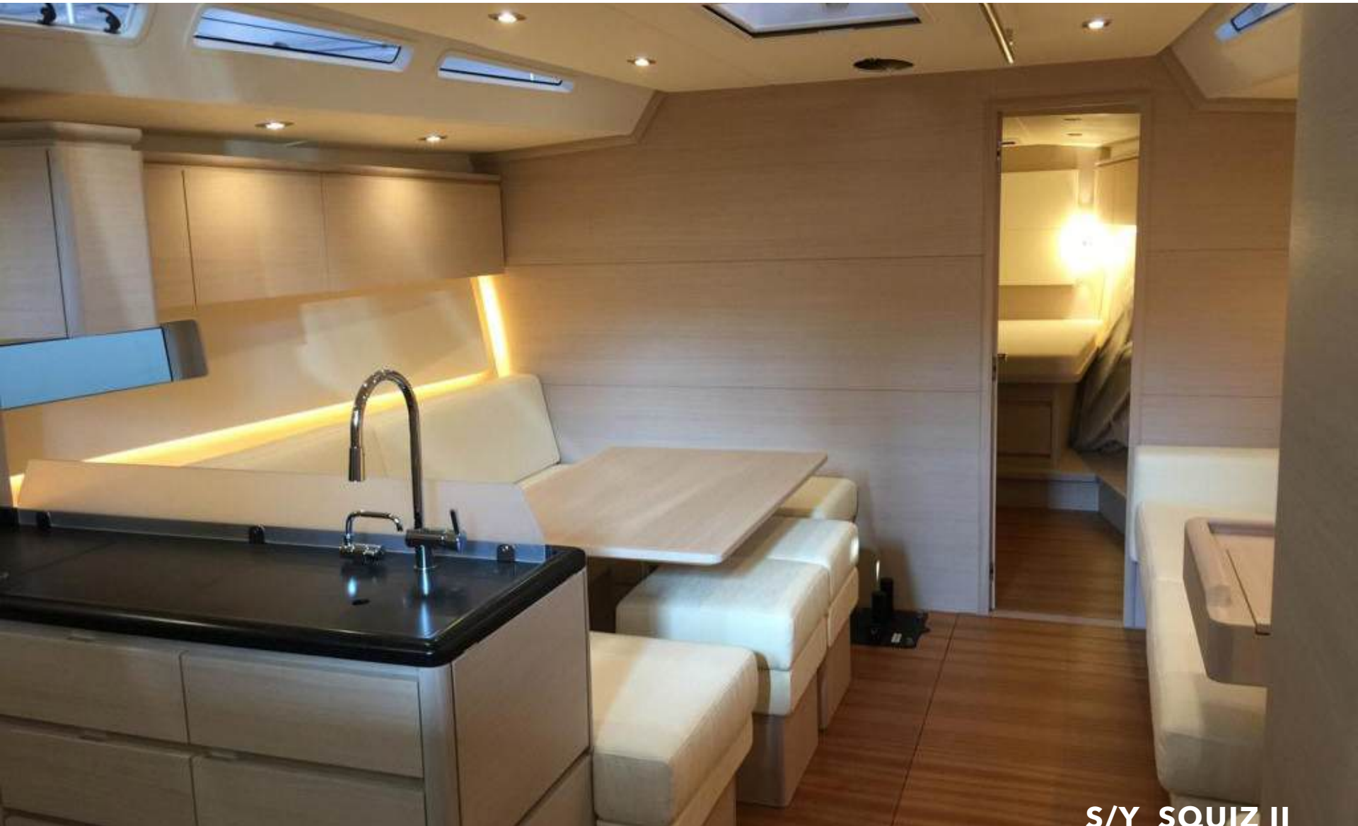
S/Y SOUZI II