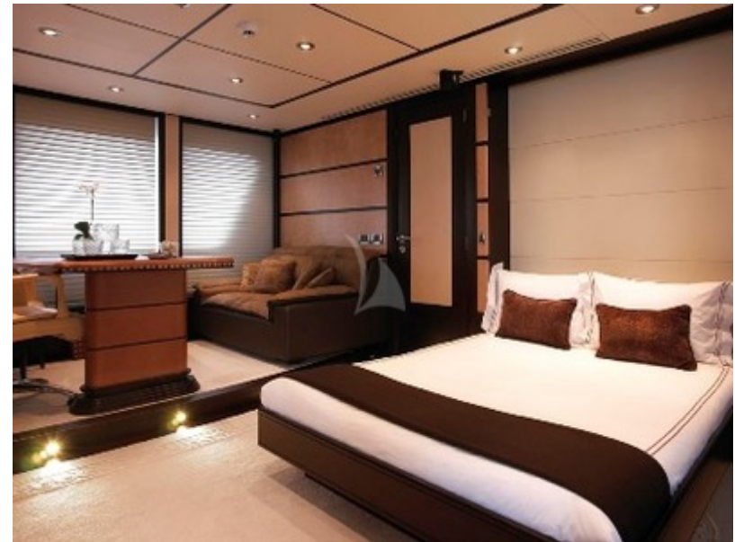
Office as convertible 6th stateroom