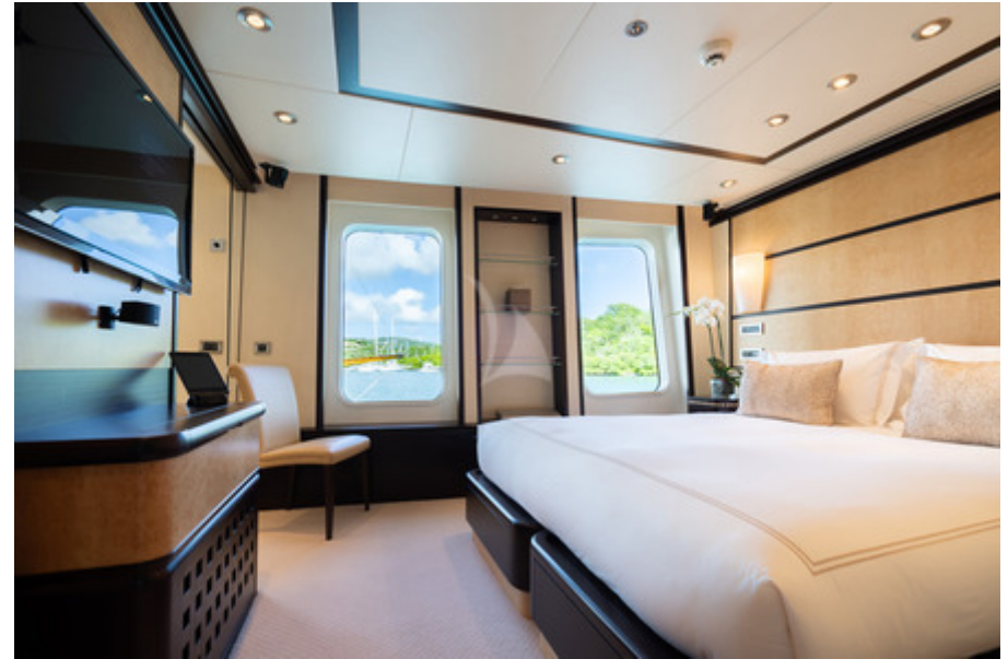
Guest Stateroom - can convert to twins