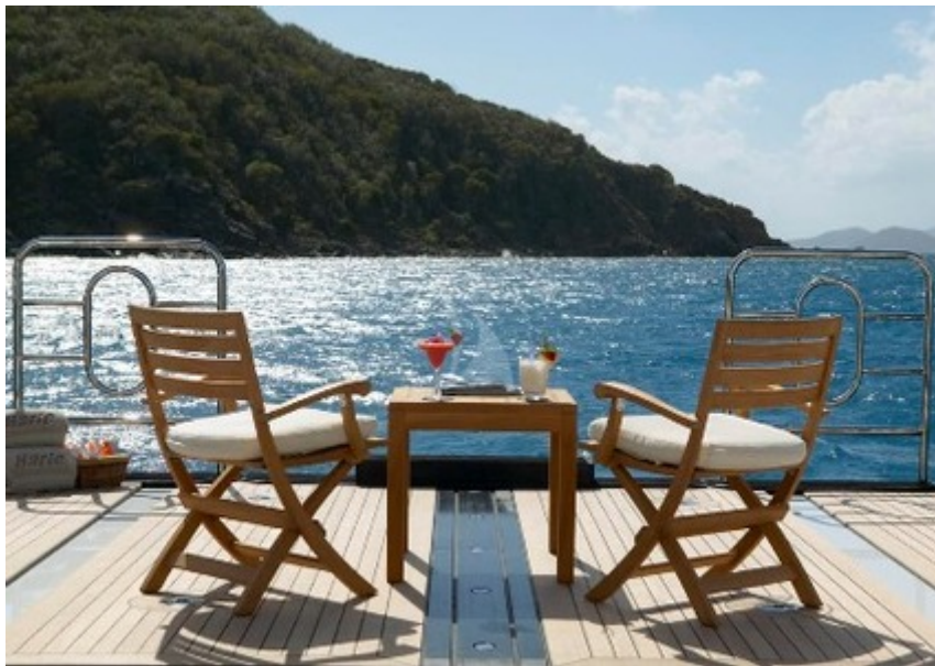
Swim Platform/"Beach Club"