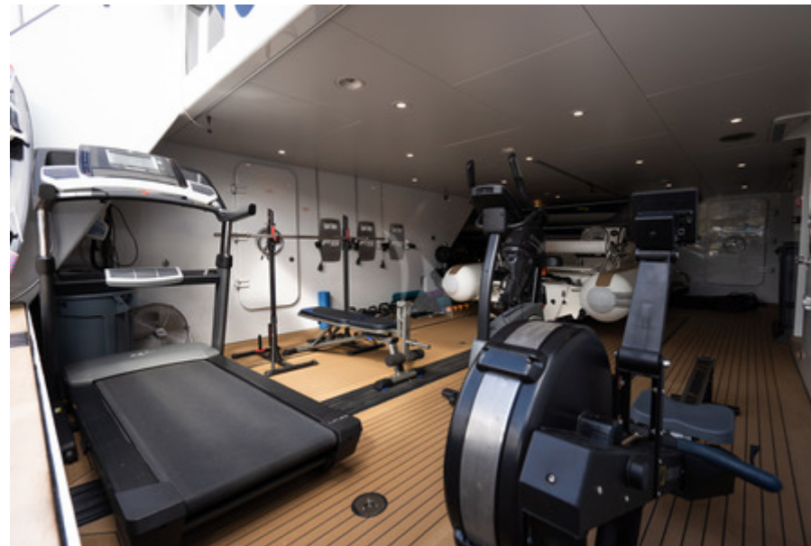
HARLE's gym in Beach Club