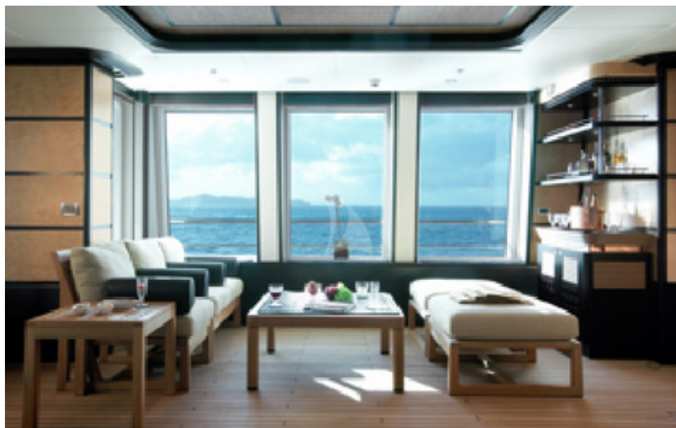
Skylounge - windows slide open for Alfresco experience