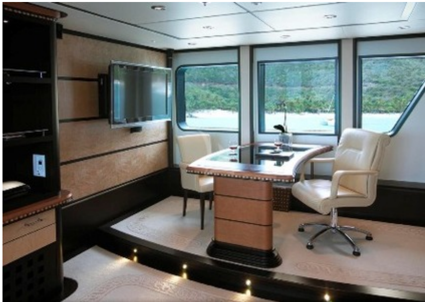
Great views and natural light in office