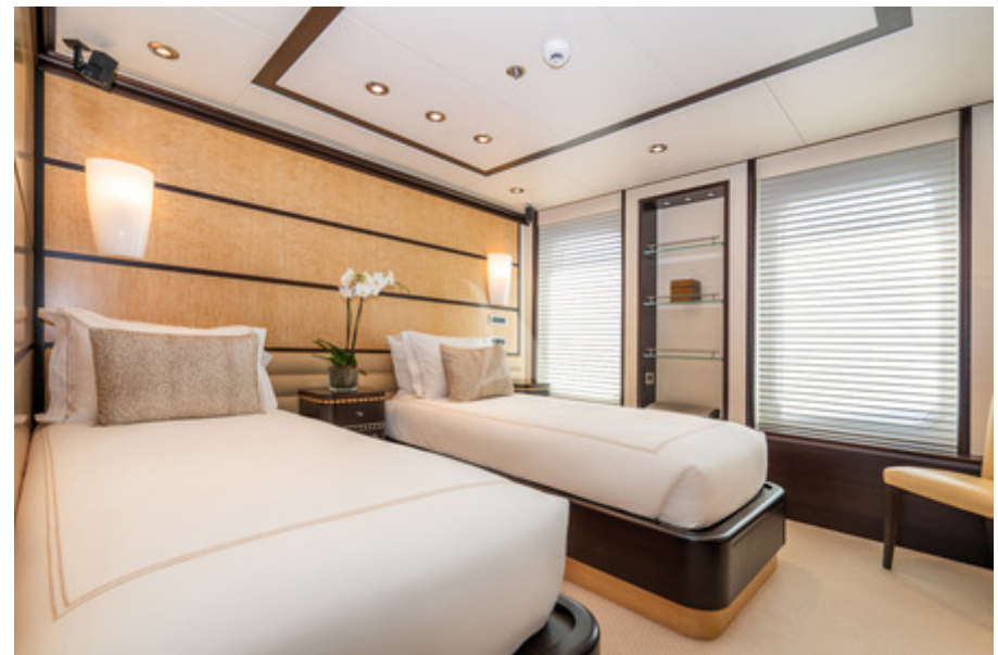
Guest Stateroom - can convert to a double