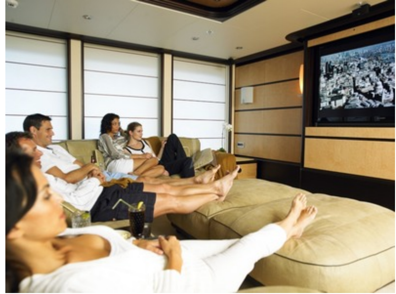
Relaxing in the Main Salon