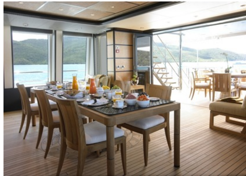
Skylounge with innovative sliding windows creating an alfresco effect throughout