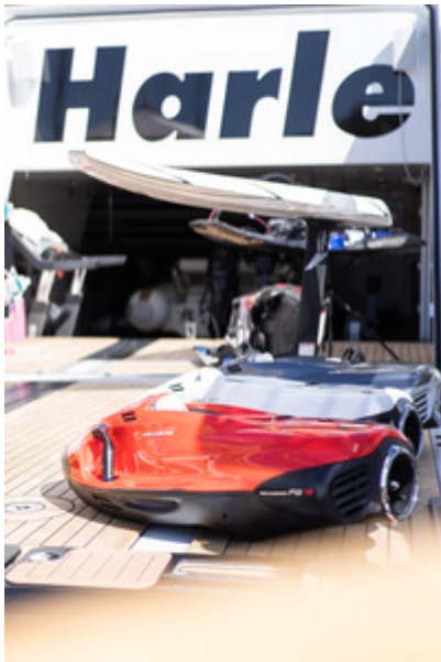
HARLE's 3 Sea Bobs & Jet Surf