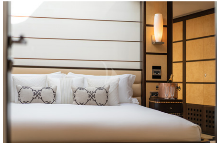
Master bed - crisp, beautiful linens