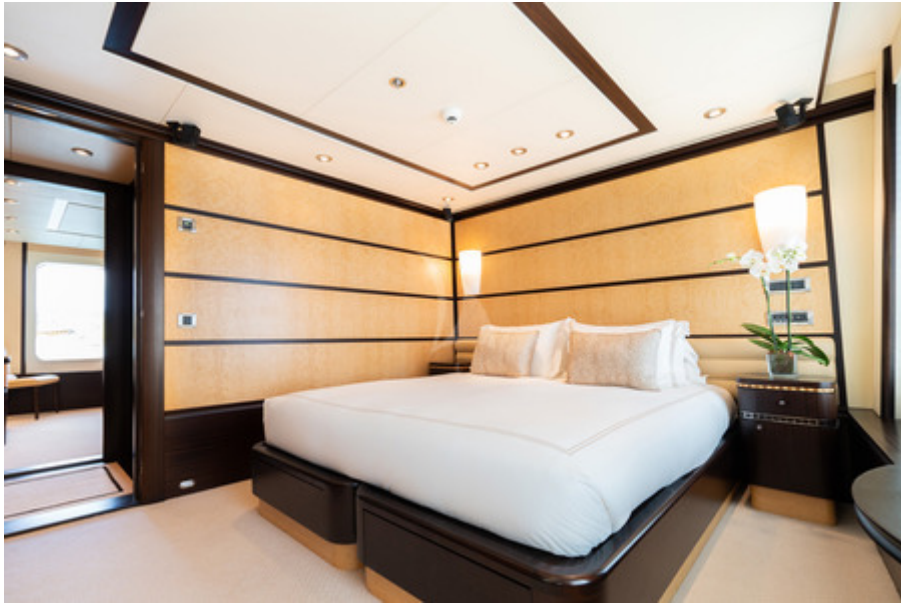
Guest Stateroom - can convert to a double