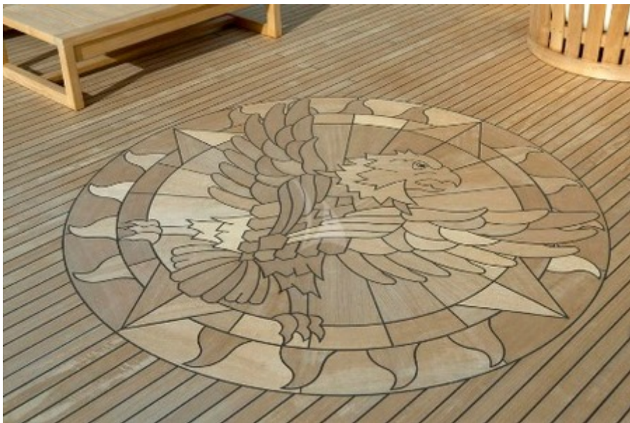
Sun Deck teak decor