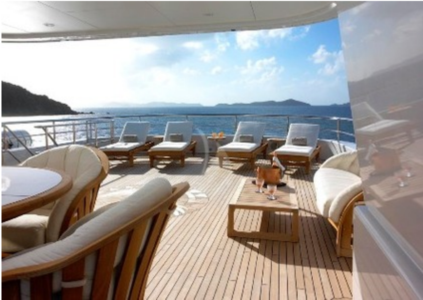
Sun Deck lounges