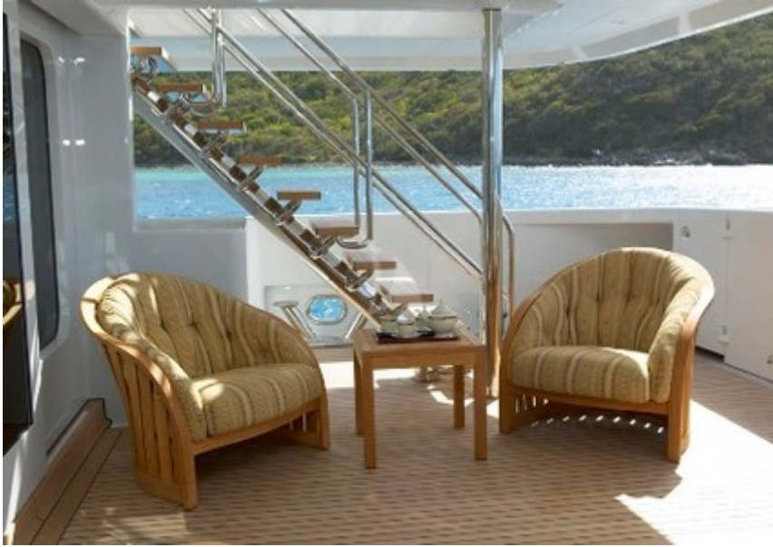
Main Aft Deck