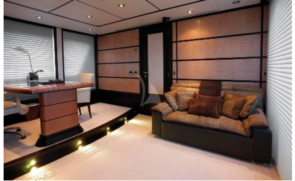
Office full view