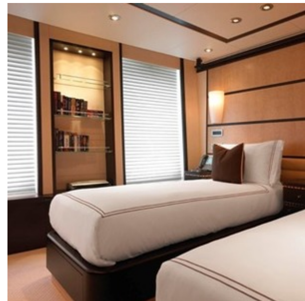
Guest Stateroom - can convert to a double