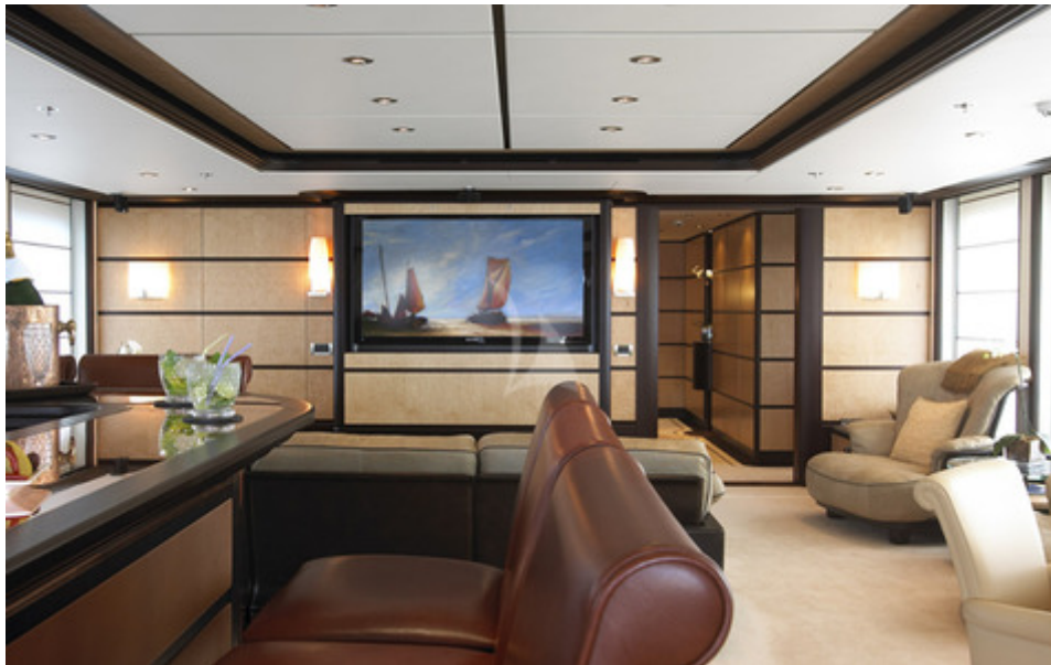
Main Salon looking Forward