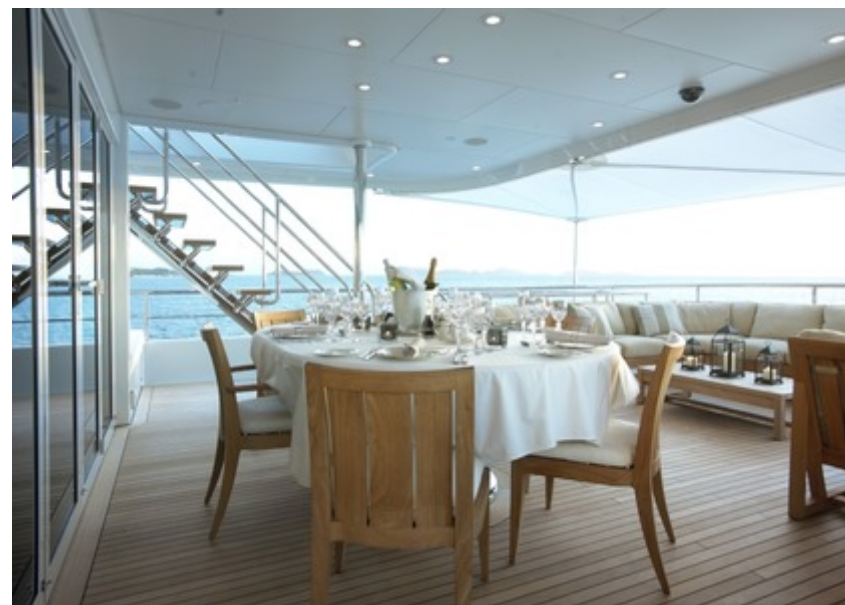
Skylounge deck dining