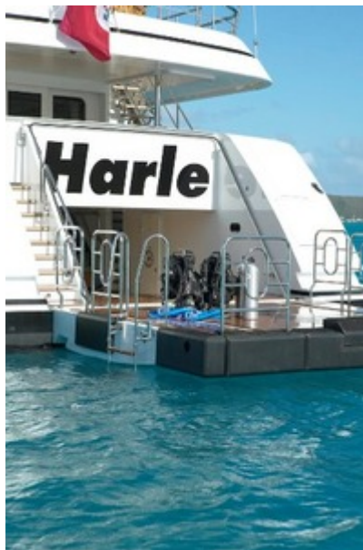
Swim Platform/"Beach Club"