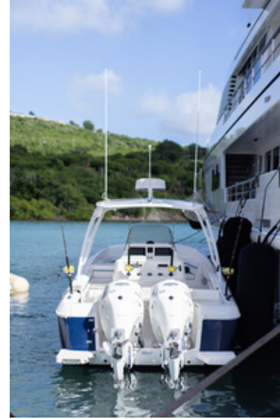
HARLE's 32' Intrepid with dayhead