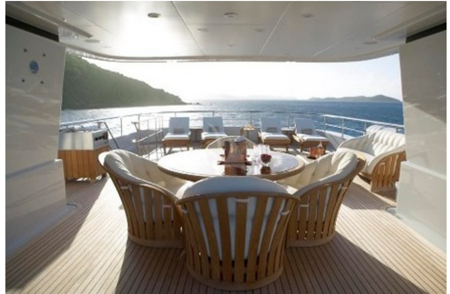
Sun Deck dining