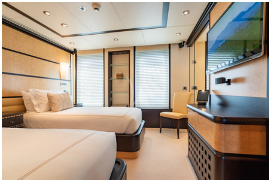
Guest Stateroom - can convert to a double