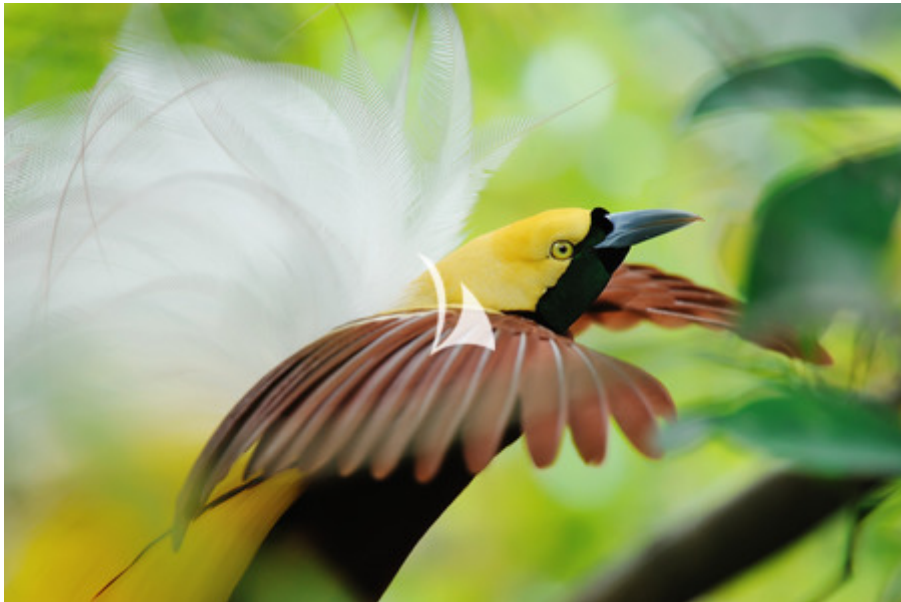
Bird of Paradise-Raja Ampat