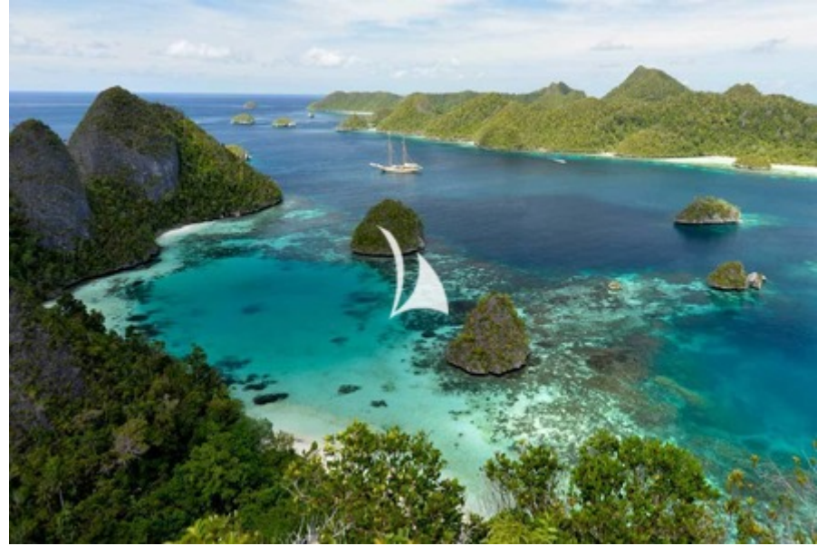
Wayag - the jewel of Raja Ampat