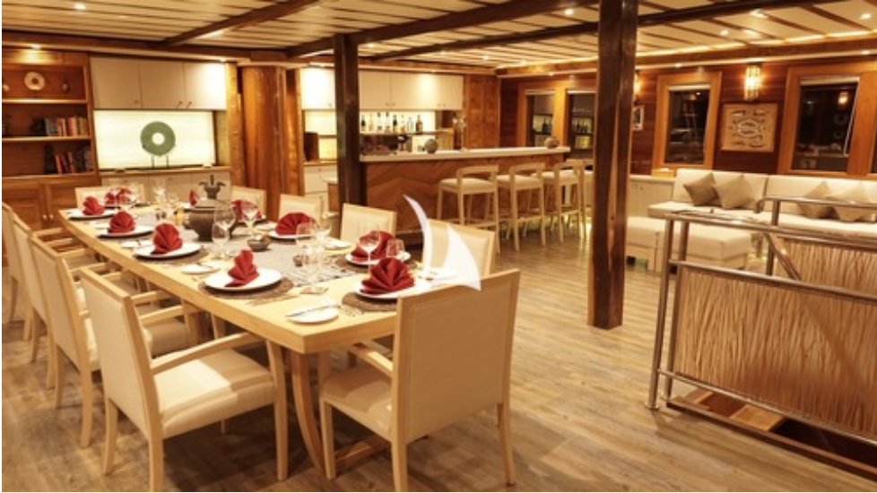
Main salon, dining and saloon area