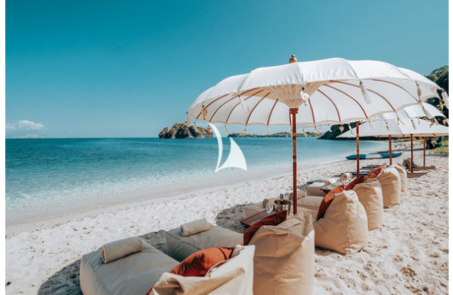
Beach set up