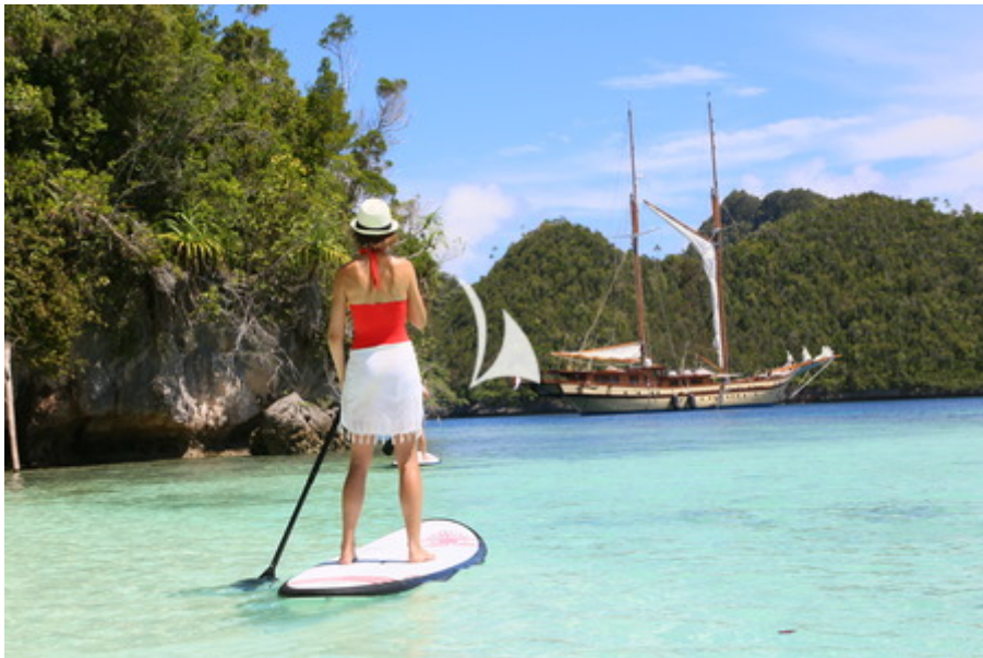
Exploring by paddleboard