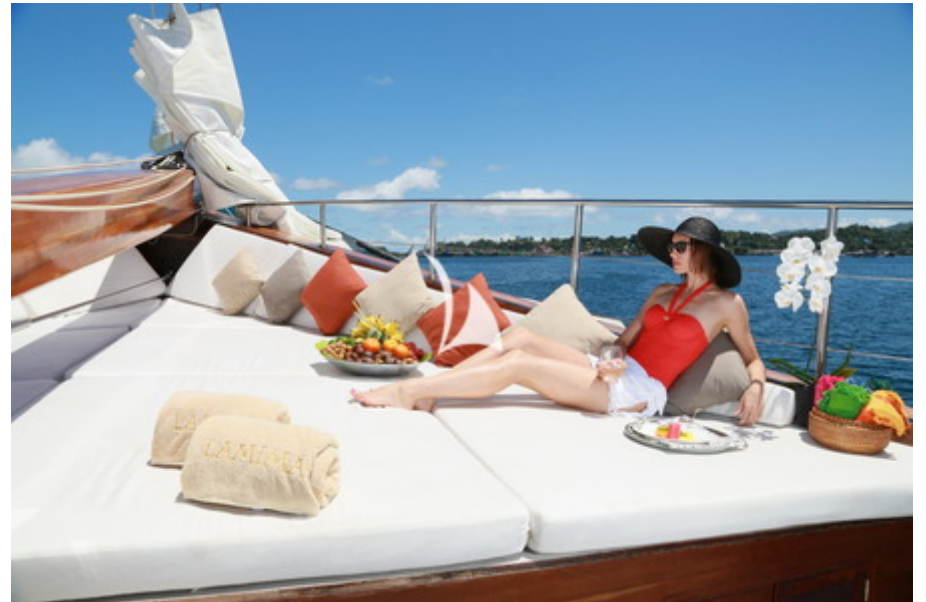
Bow seating area