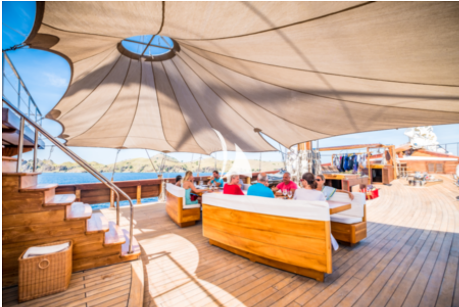
On deck dining