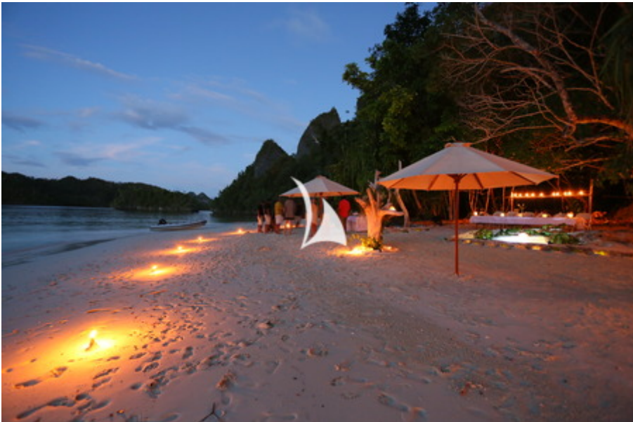
Beach BBQ setup