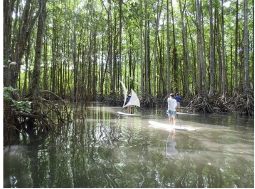
Exploring the mangroves