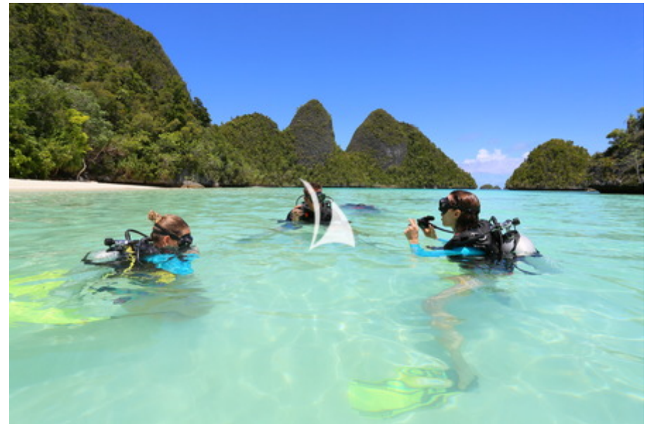
Diving-instruction and certification included