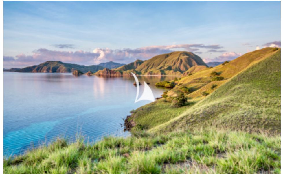
Beautiful views in Komodo