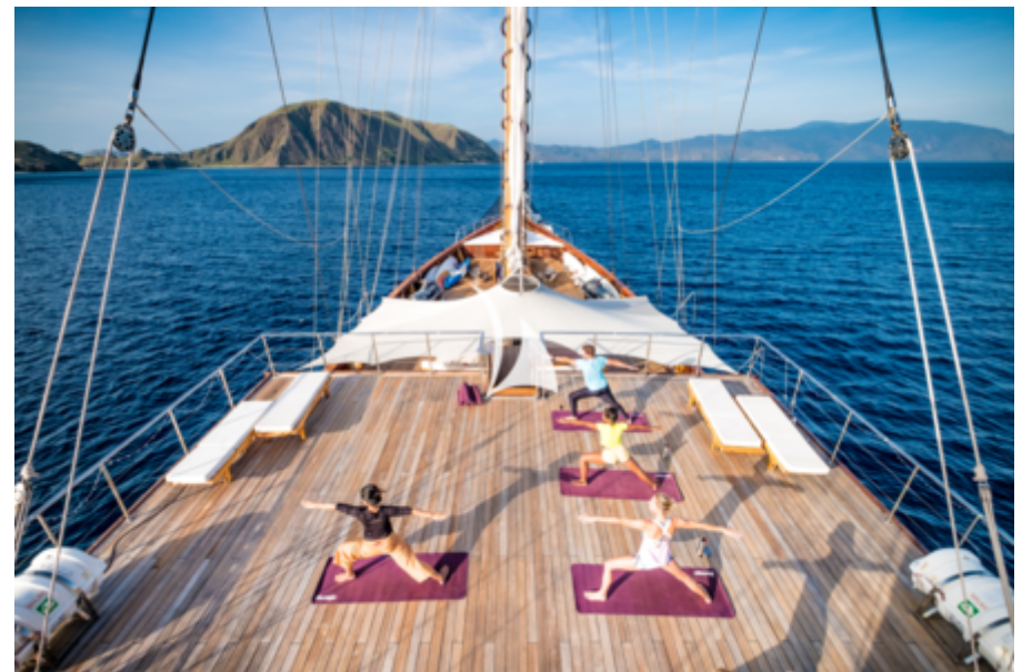
Qualified Yoga instructor onboard