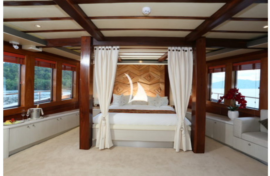
Full beam Master cabin