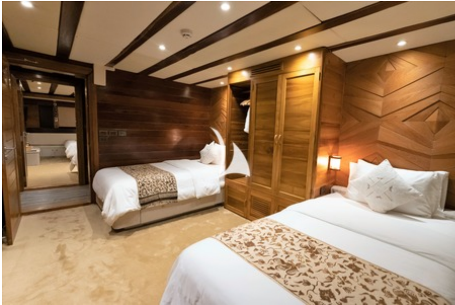
Guest Twin cabin