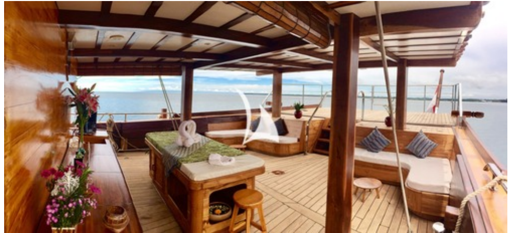
SPA area: All treatments included