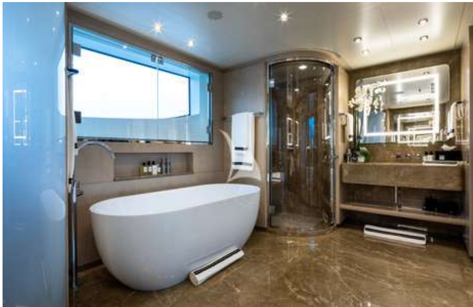
Second Master's Ensuite