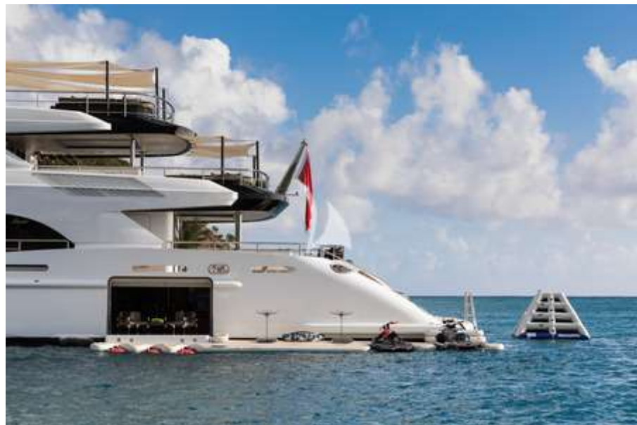
Inflatable Dock Station