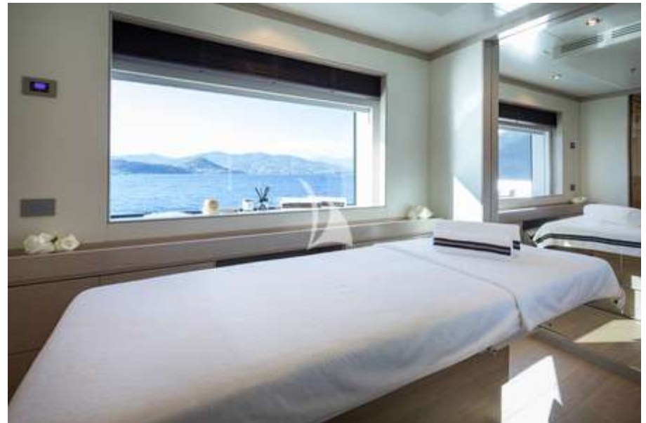
Upper Deck Massage Room