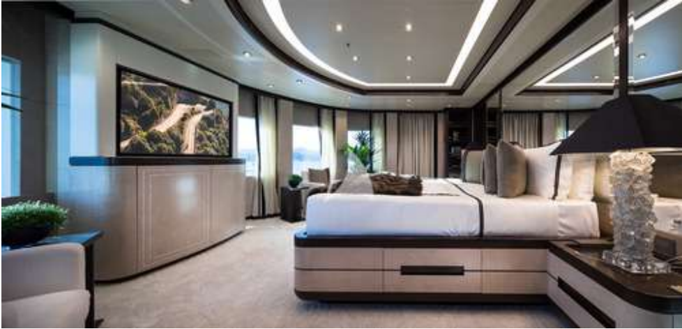
Upper Deck Master