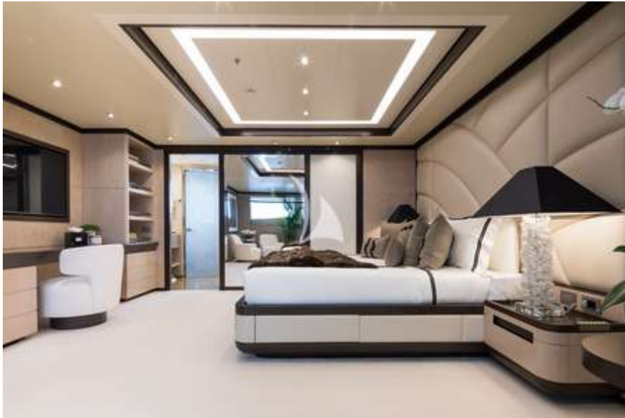
Main Deck Second Master