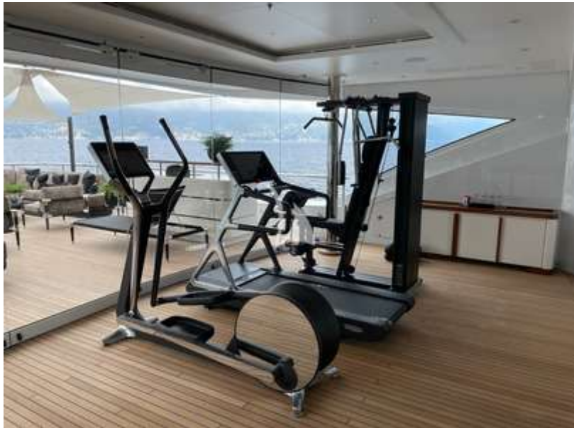
Bridge Deck Full Gym