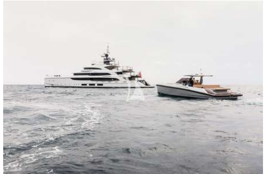
Wally 48 Chase Tender