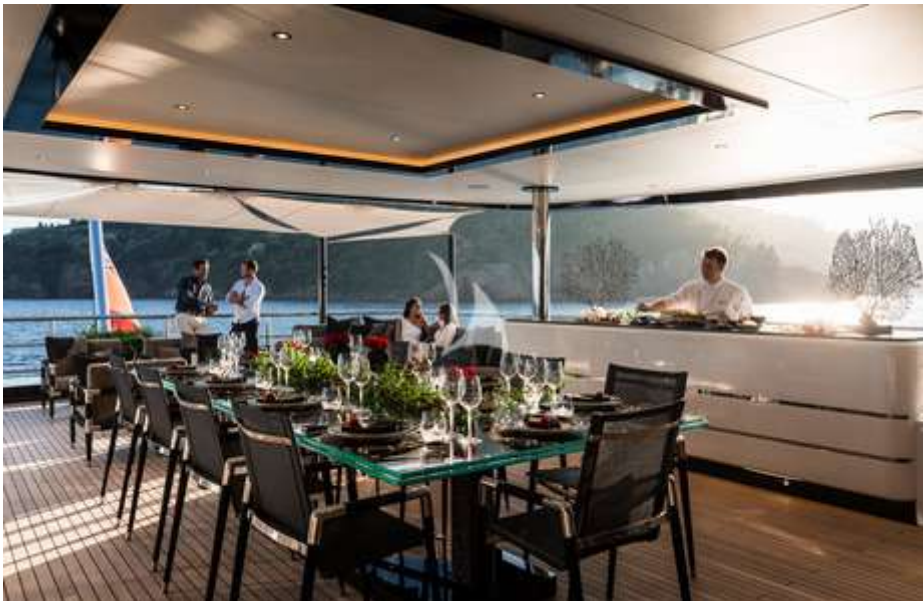
Upper Aft Dining