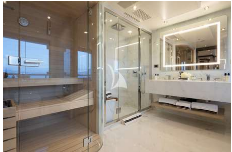
Master's Ensuite with Sauna