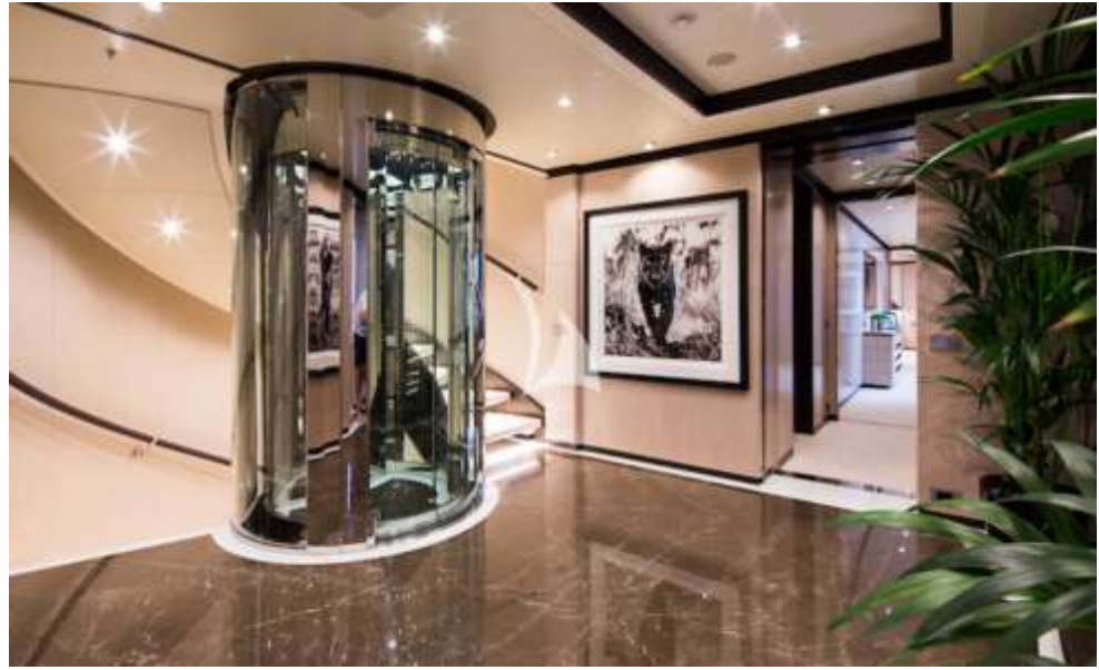
Main Lobby Lift