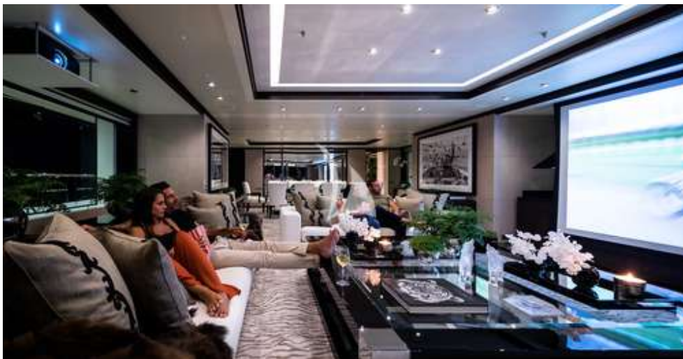
Main Lounge Cinema