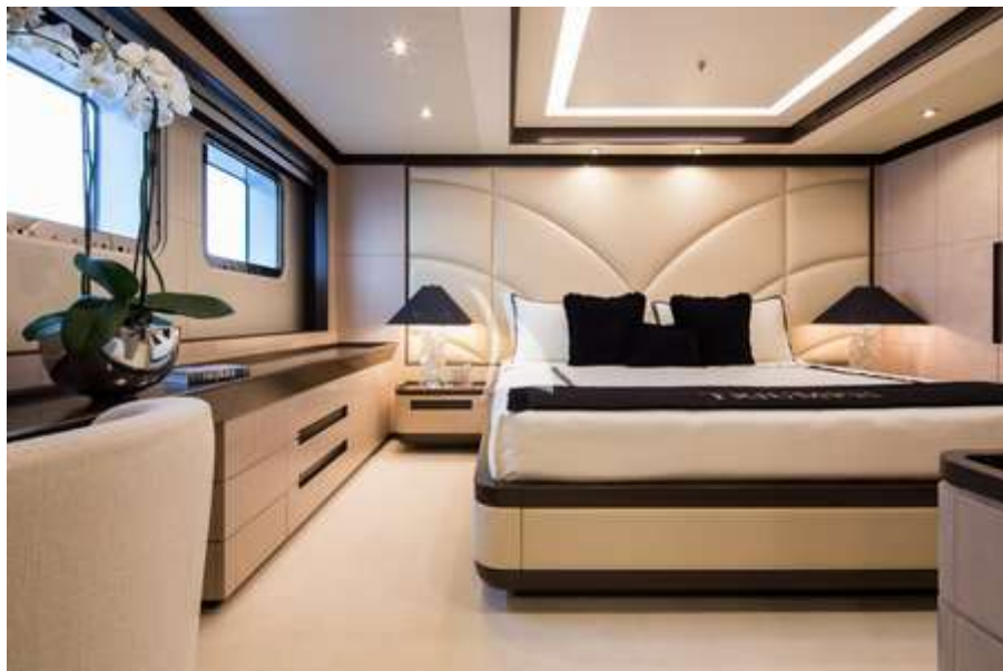
Lower Deck VIP