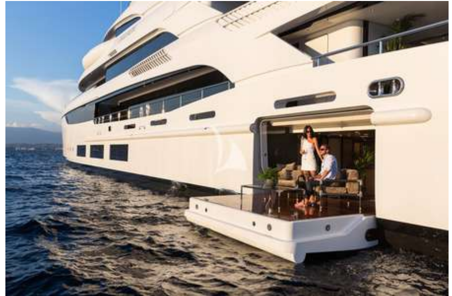
Port Side Platform