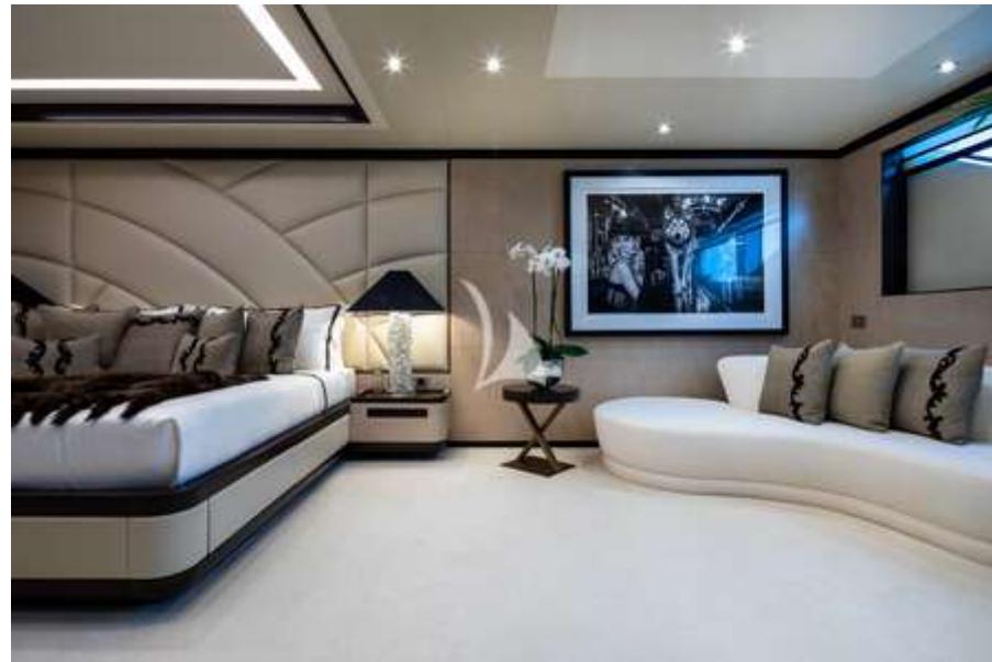
Main Deck Second Master