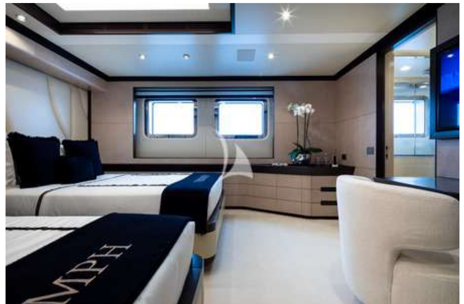
Lower Deck VIP Twin/Convertible