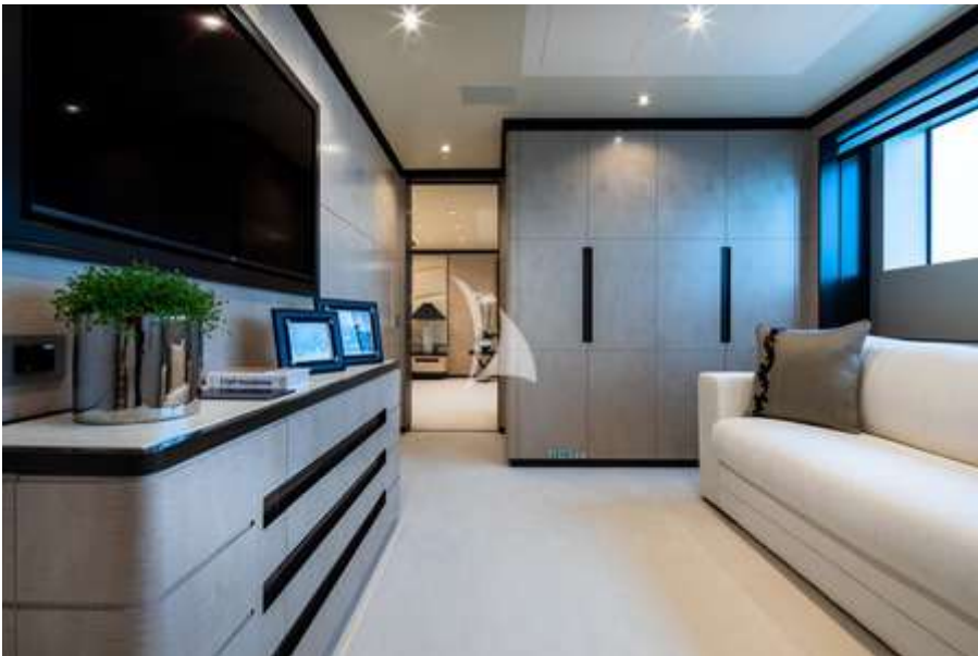
Main Deck Second Master's Lounge