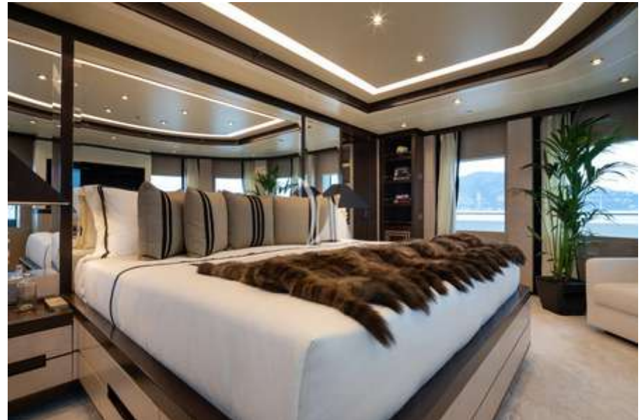
Upper Deck Master