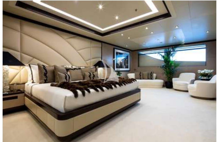
Main Deck Second Master