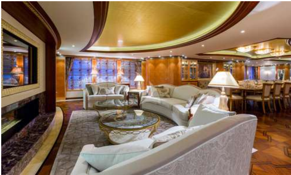
Main deck Salon TV