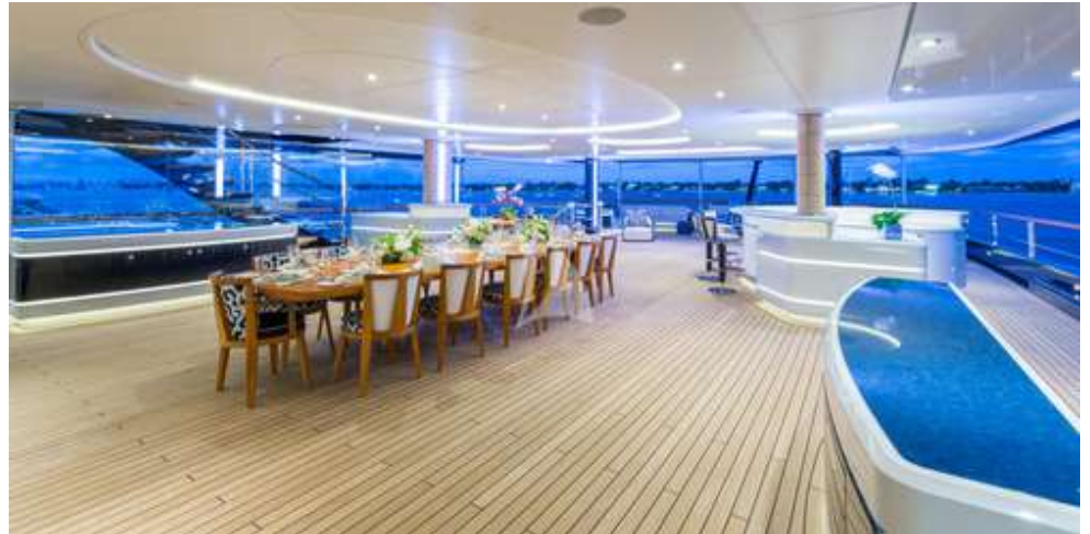
Owner's deck aft