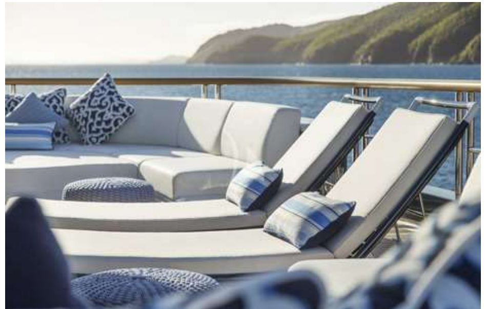
Owner's deck aft