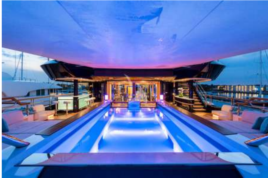
Bridge deck Pool