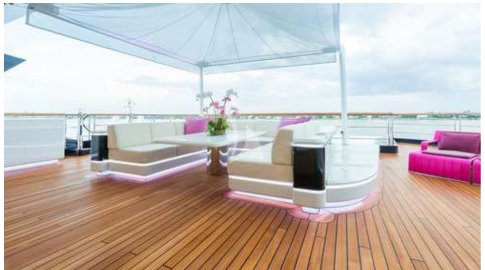
Top deck aft