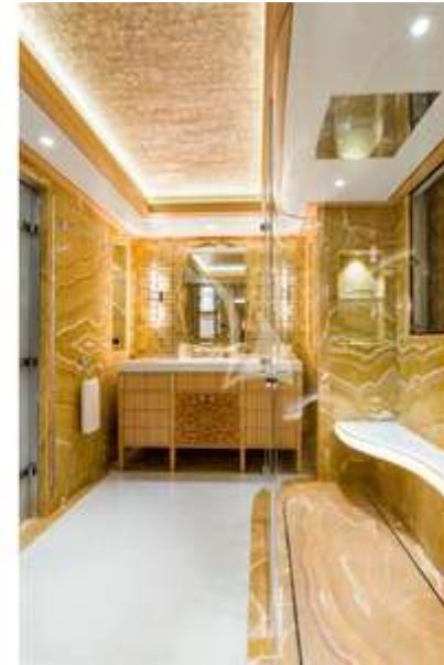
VIP Bathroom 1