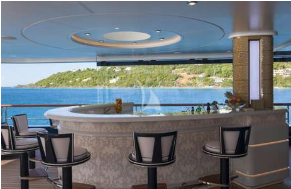
Owner's deck Bar