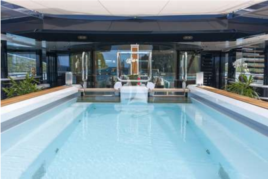
Bridge deck Pool