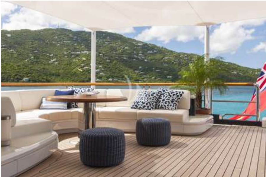
Owner's deck aft