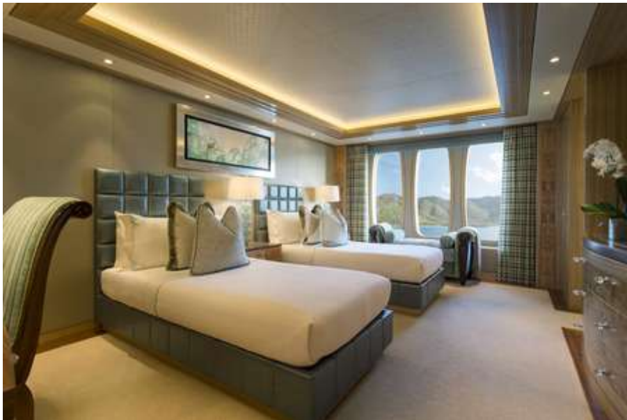
Guest Stateroom 4