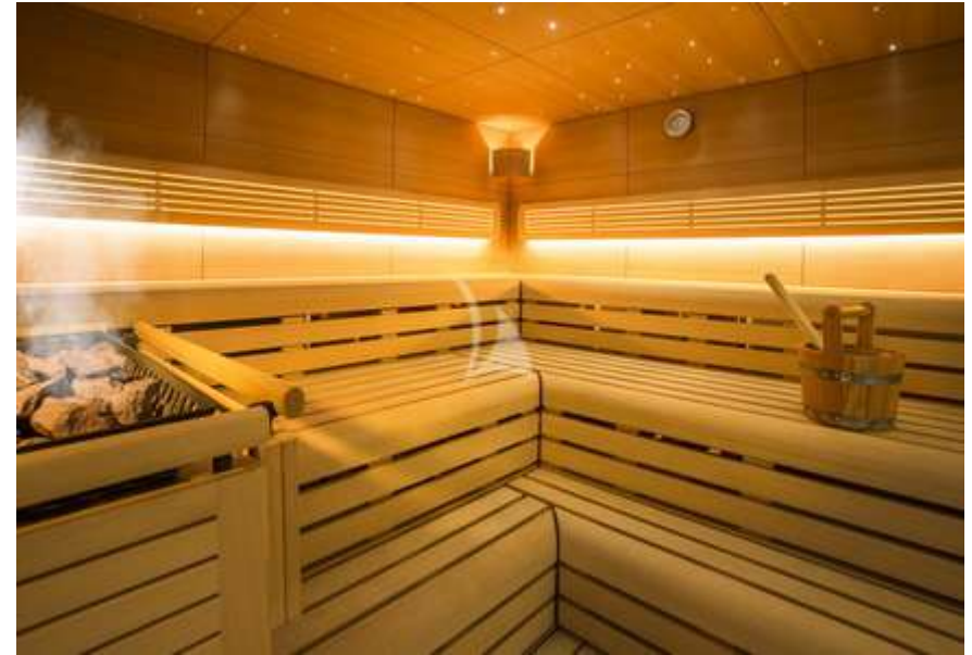
Bridge deck Sauna