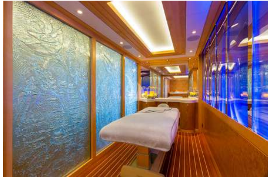
Bridge deck Massage room