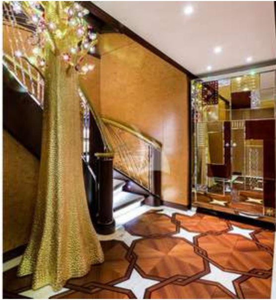
Tree of Life