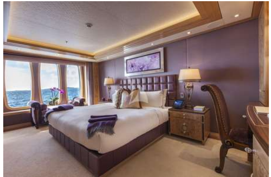
Guest Stateroom 3