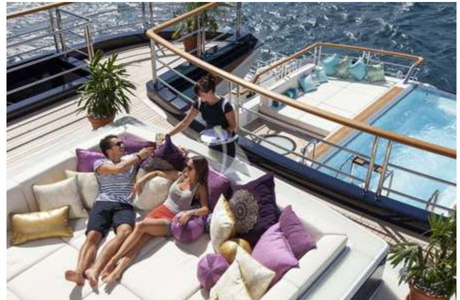
Bridge deck Pool