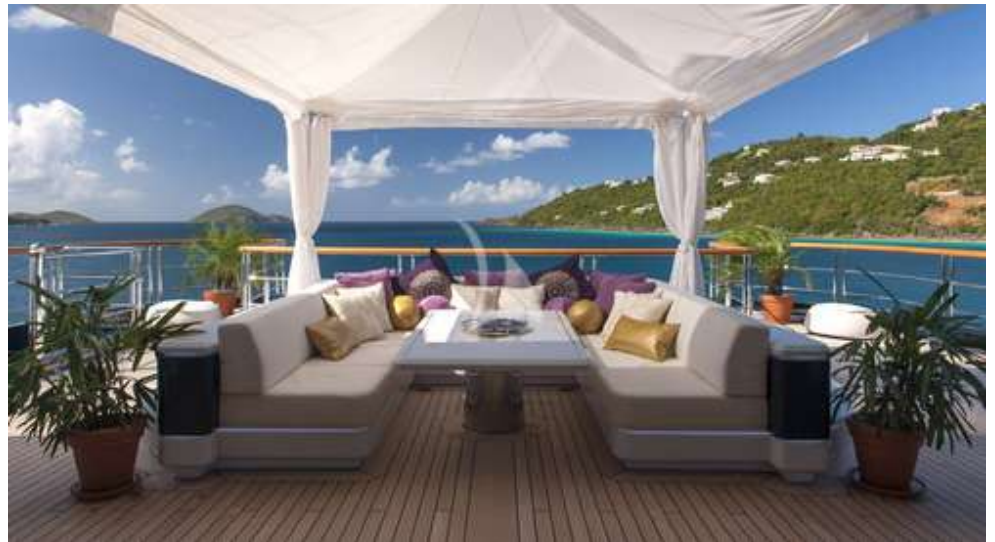
Top deck aft