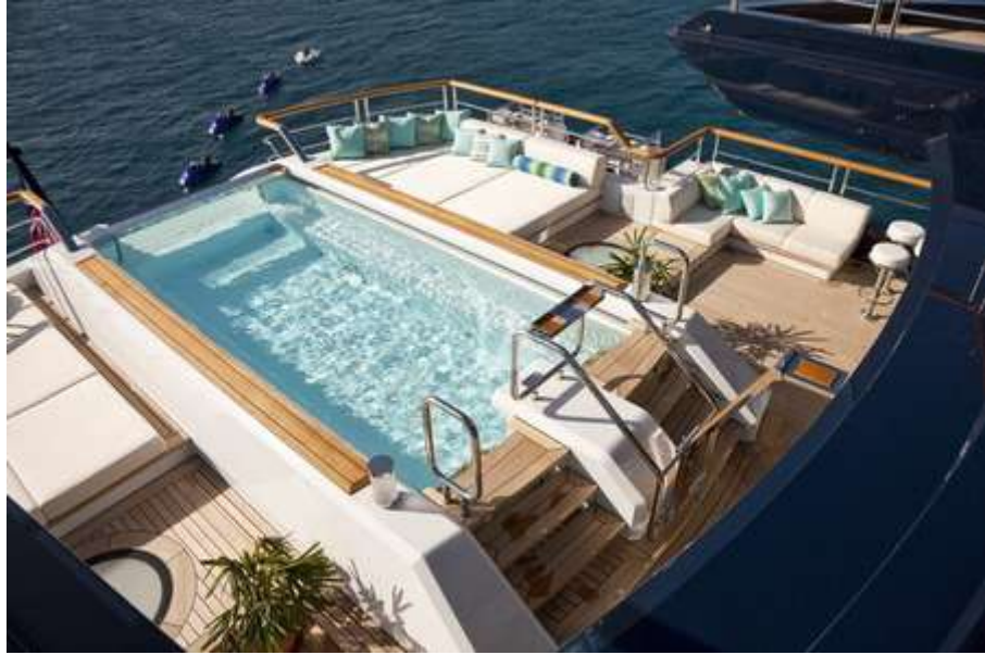
Bridge deck Pool