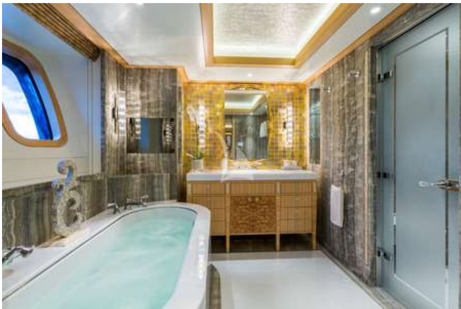
VIP Bathroom 2