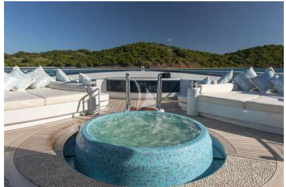
Owner's deck Jacuzzi