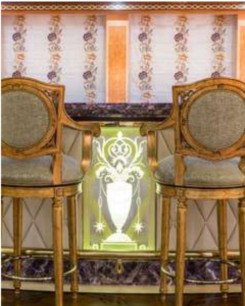
Main Salon Bar