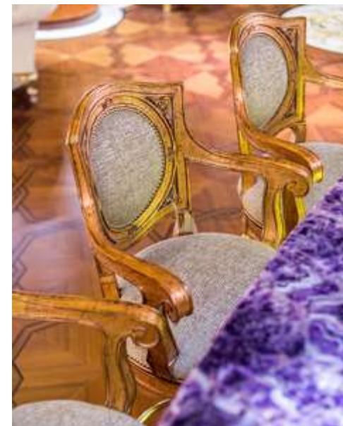
Main Salon Bar