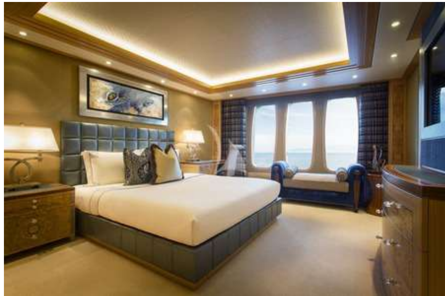
Guest Stateroom 2