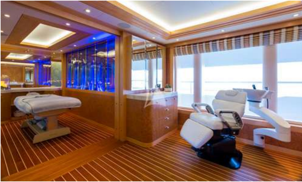
Bridge deck Massage room