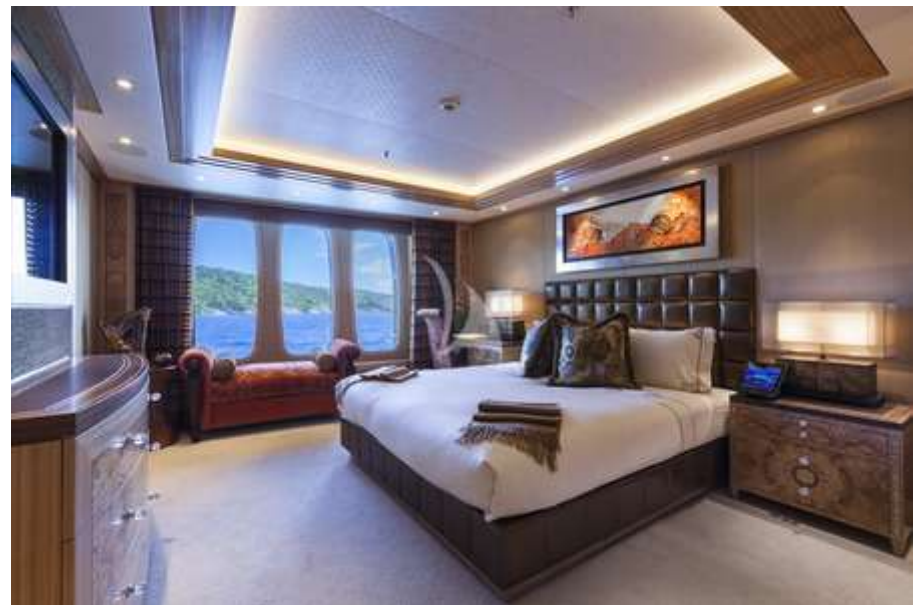
Guest Stateroom 1