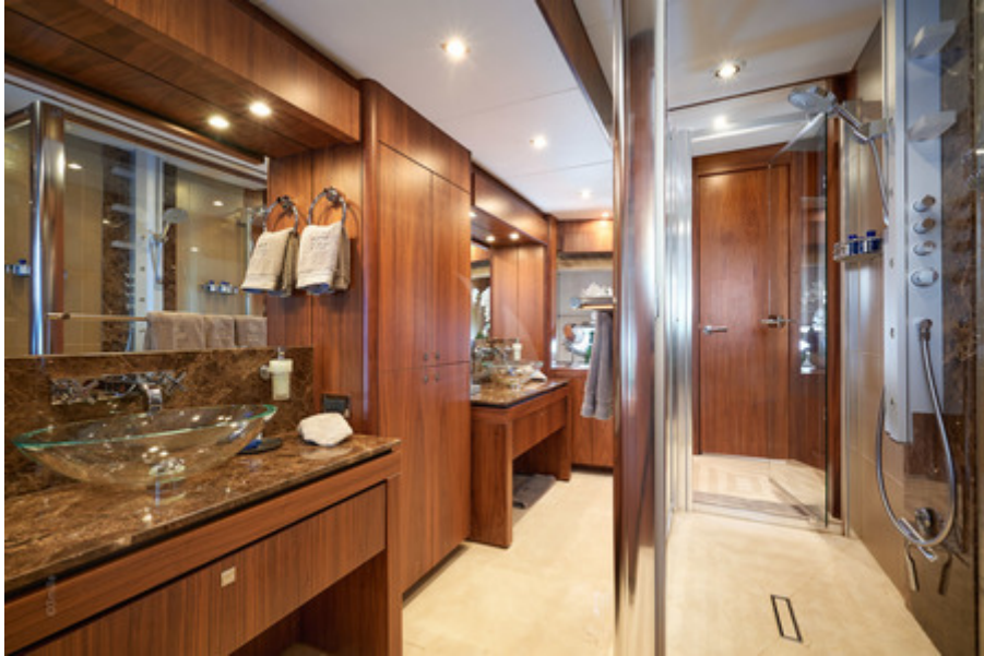
Master Cabin Ensuite