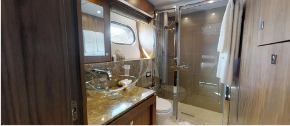
Twin Cabin Ensuite