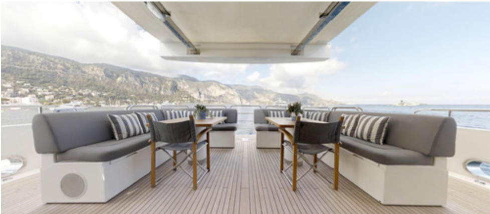
Aft Deck tables