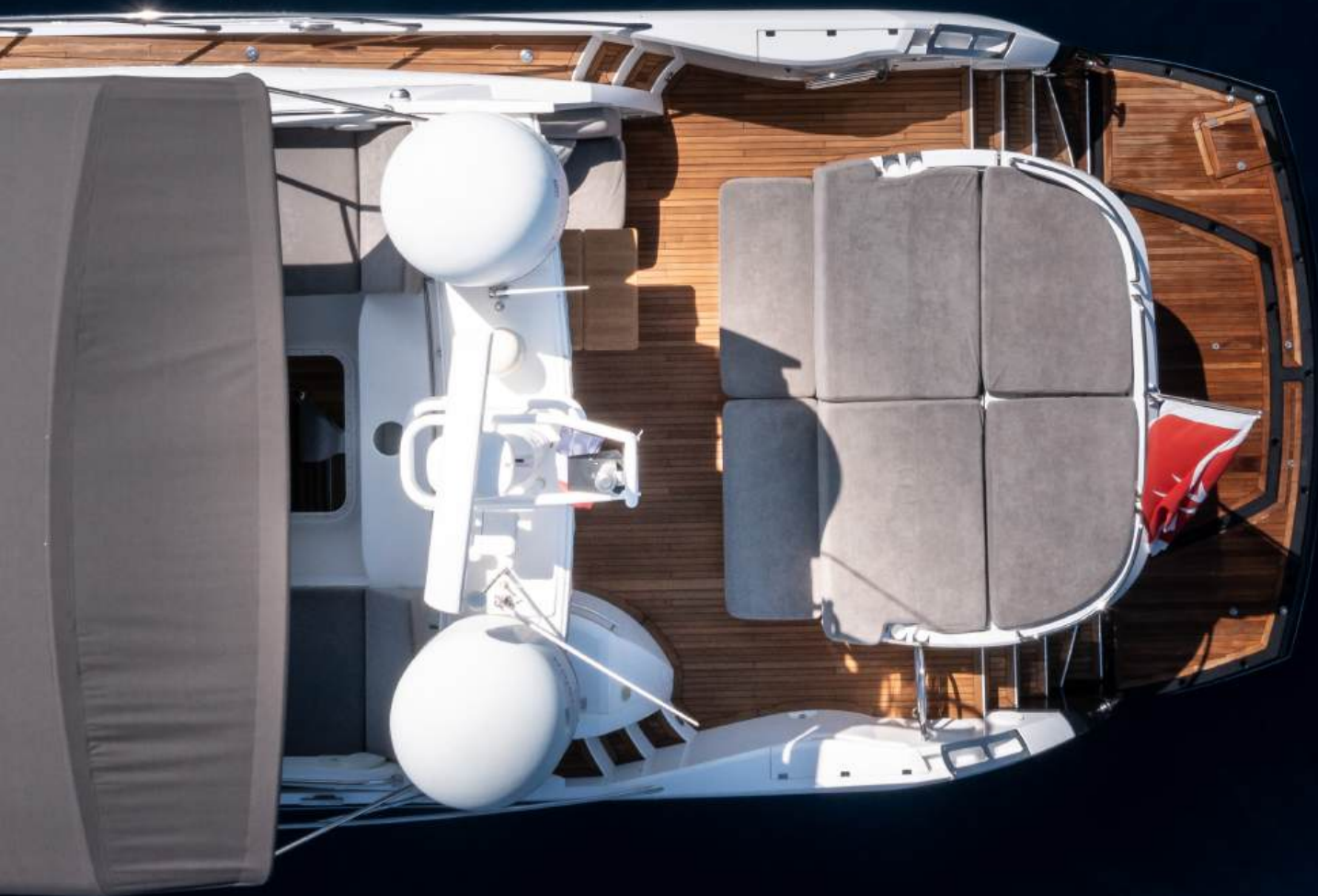
M/Y STAR OF SEVEN SEAS