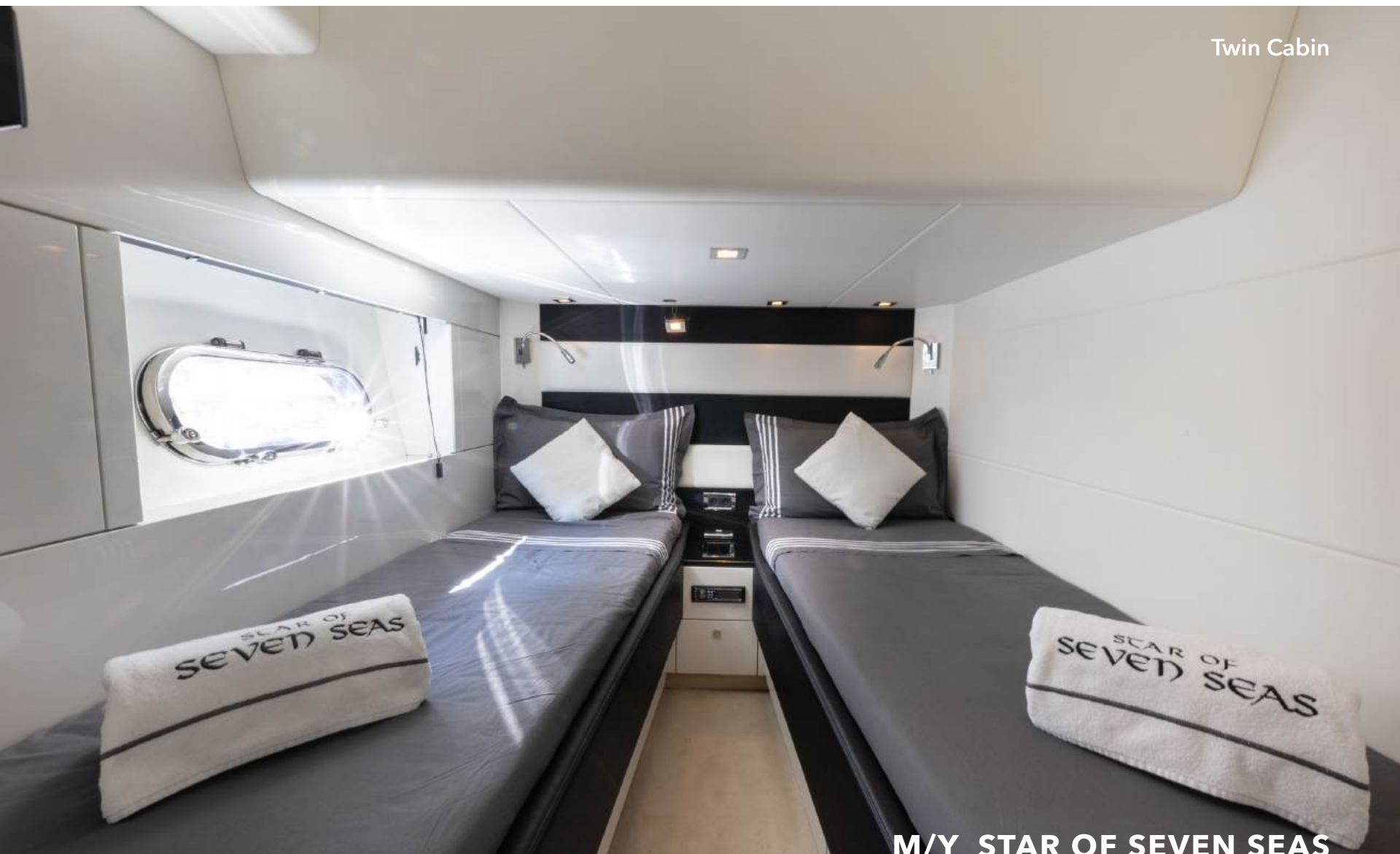
M/Y STAR OF SEVEN SEAS