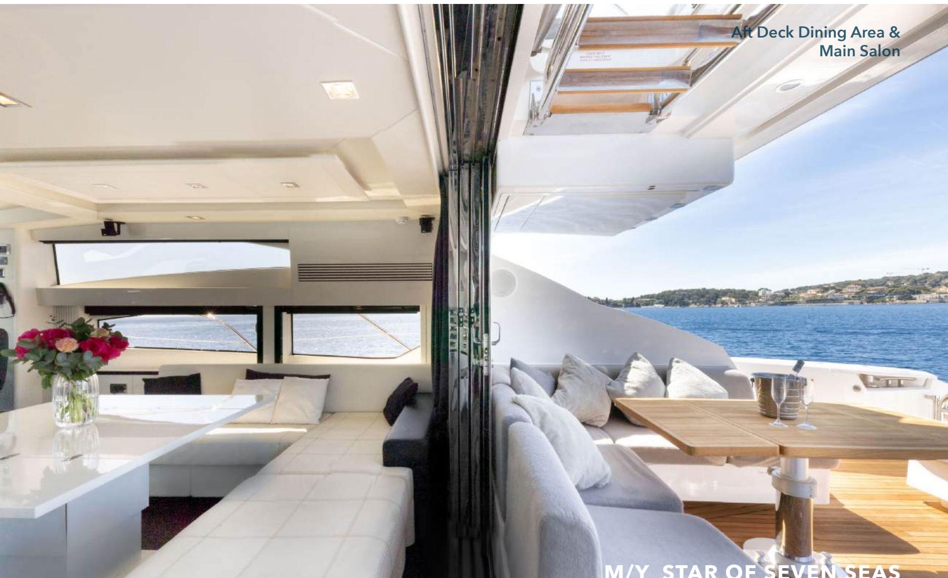
Aft Deck Dining Area & Main Salon