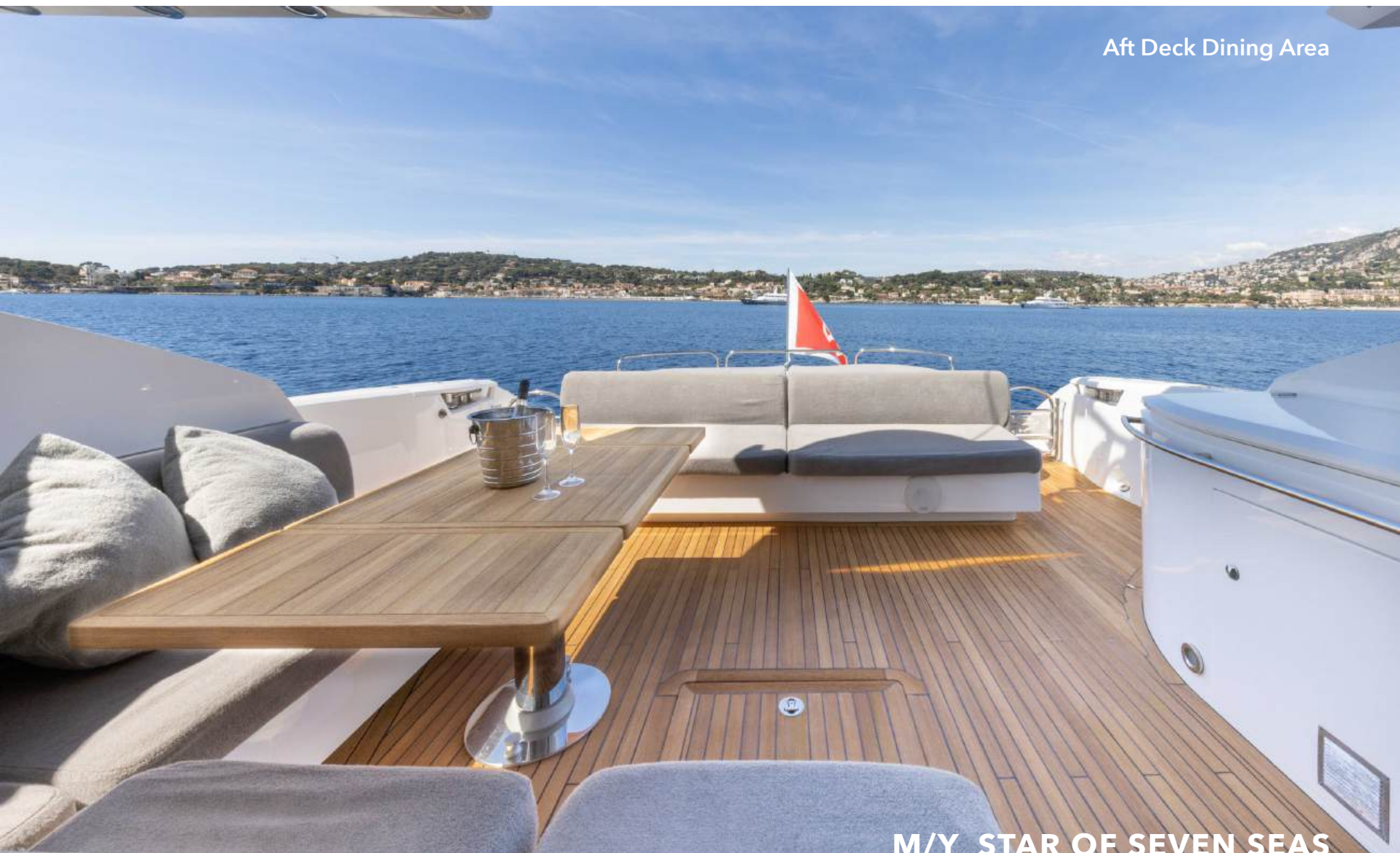
M/Y STAR OF SEVEN SEAS