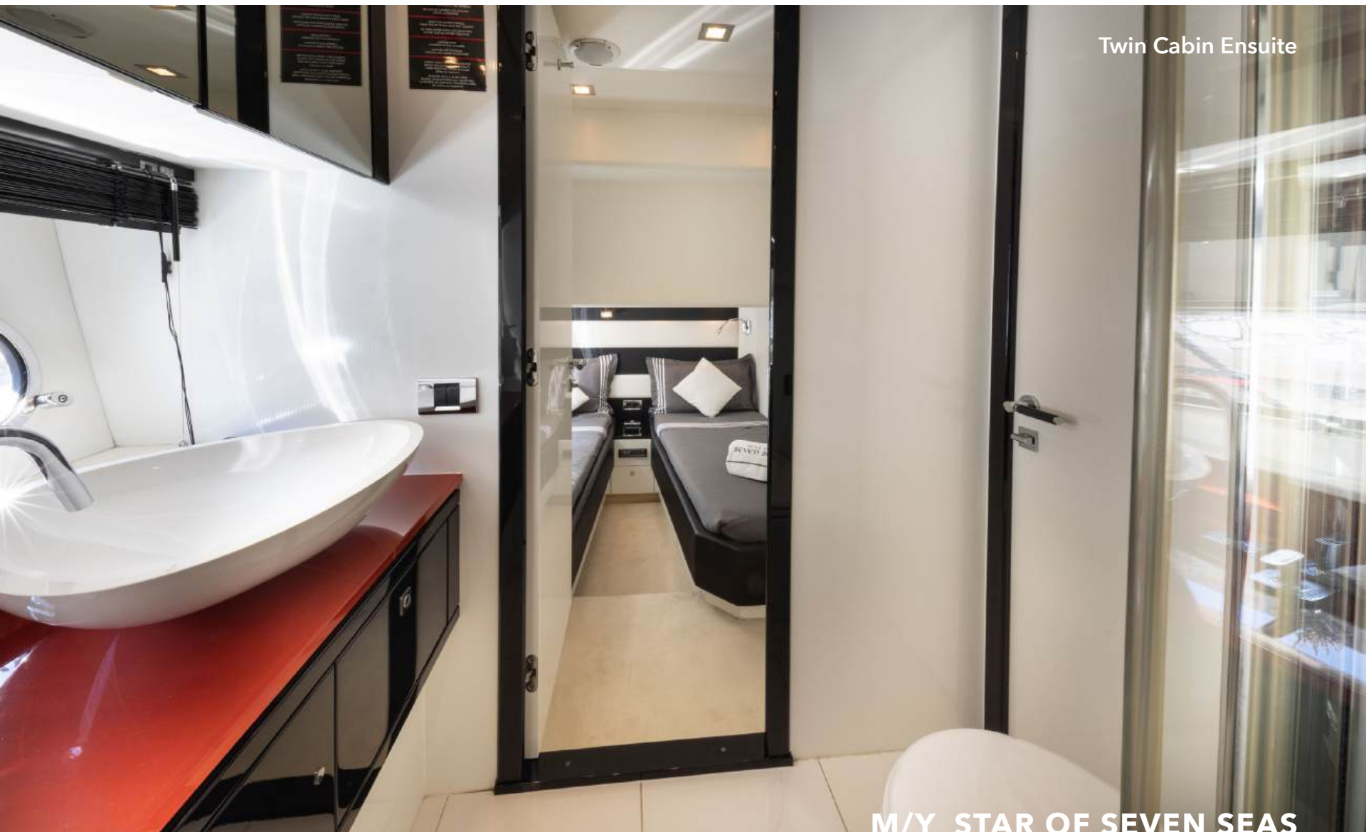
Twin Cabin Ensuite