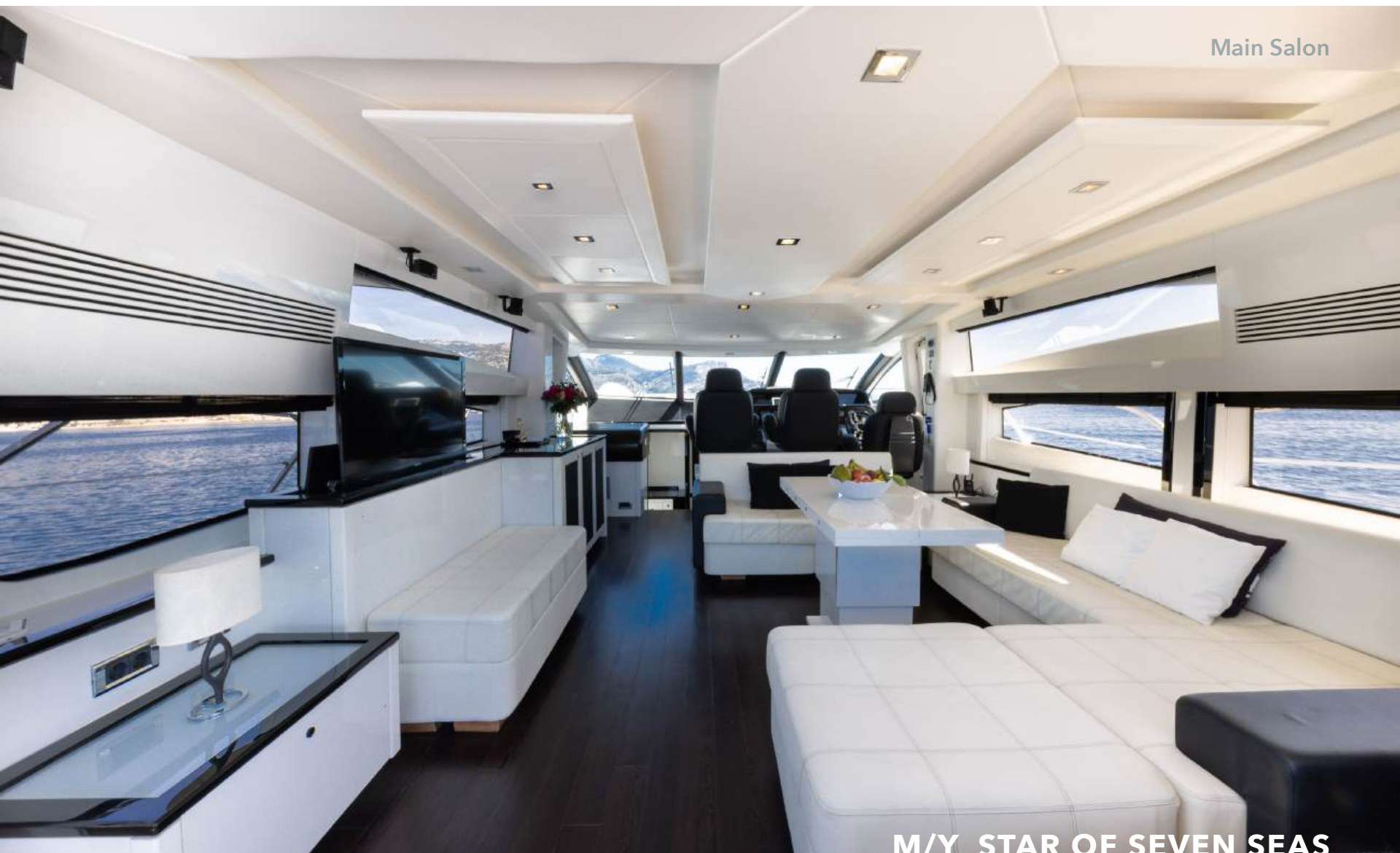
M/Y STAR OF SEVEN SEAS