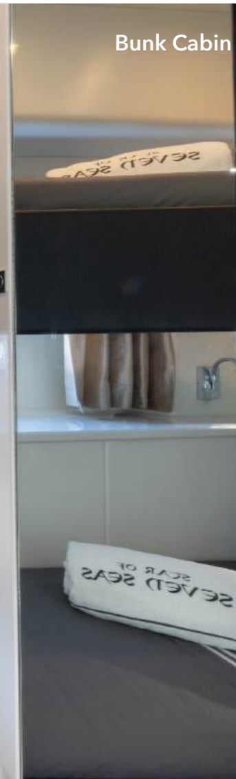
M/Y STAR OF SEVEN SEAS