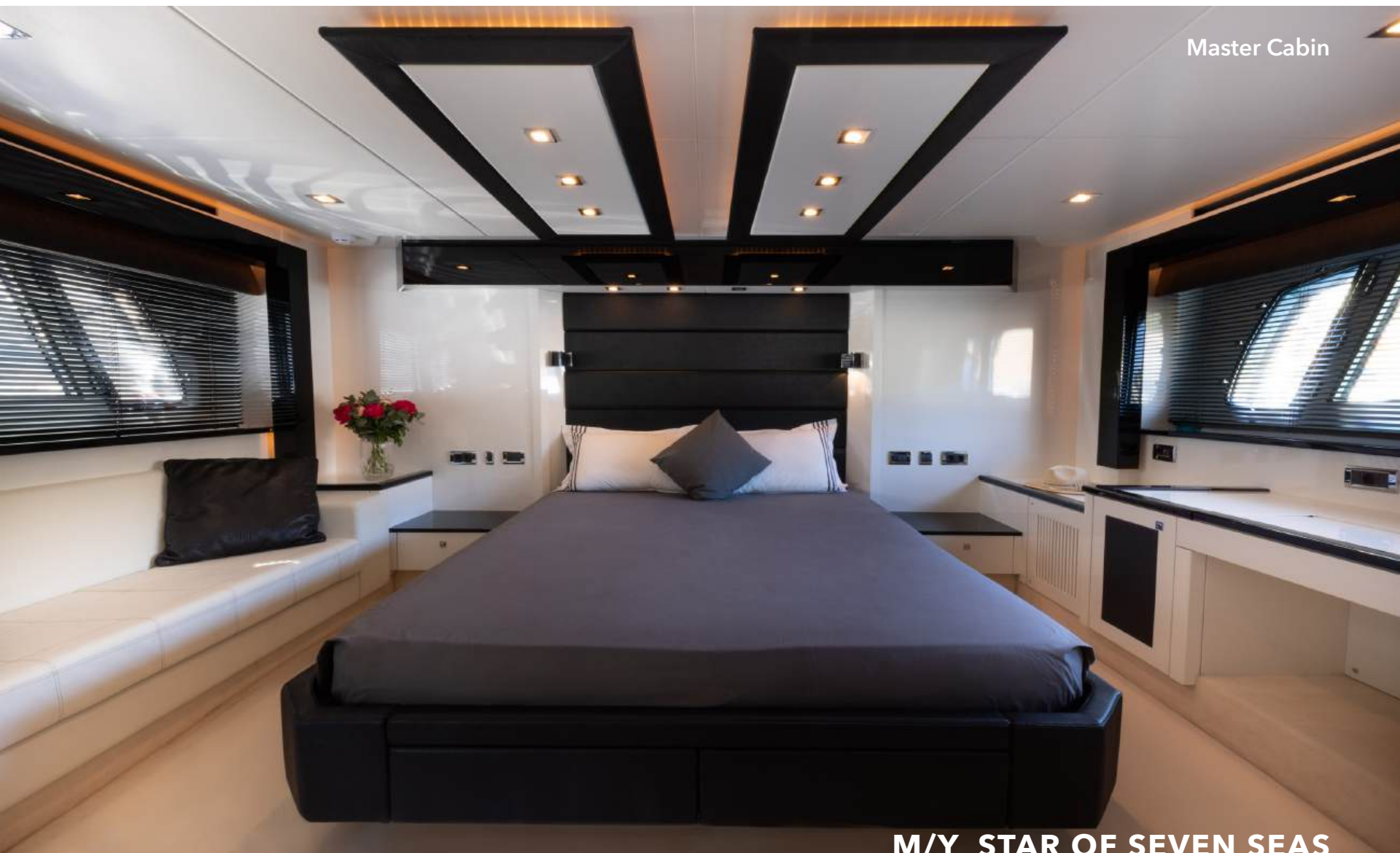
M/Y STAR OF SEVEN SEAS