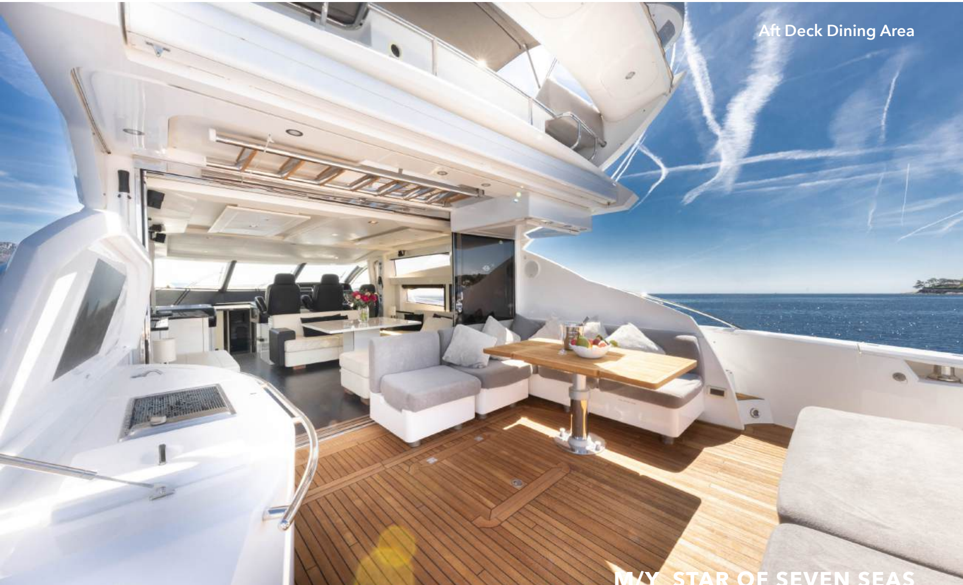
Aft Deck Dining Area