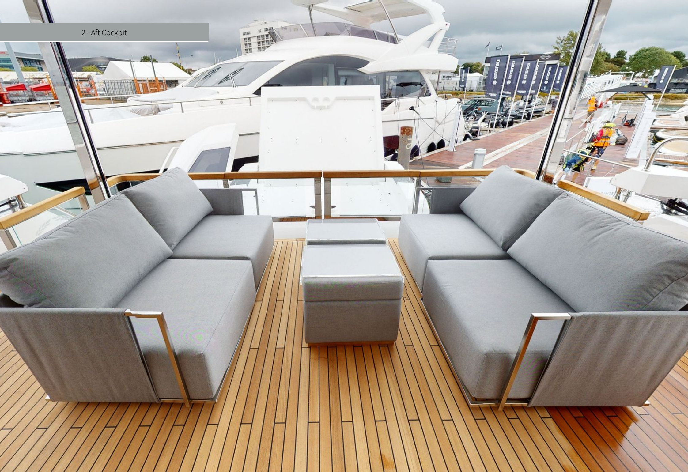
2 - Aft Cockpit