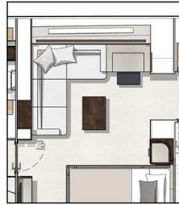
LOWER DECK OPTION Shown with optional sofa in Master Stateroom