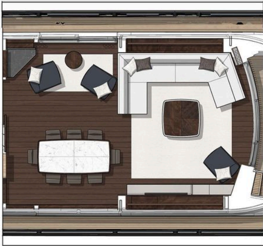
MAIN DECK OPTION Shown with alternative Salon & Dining arrangement