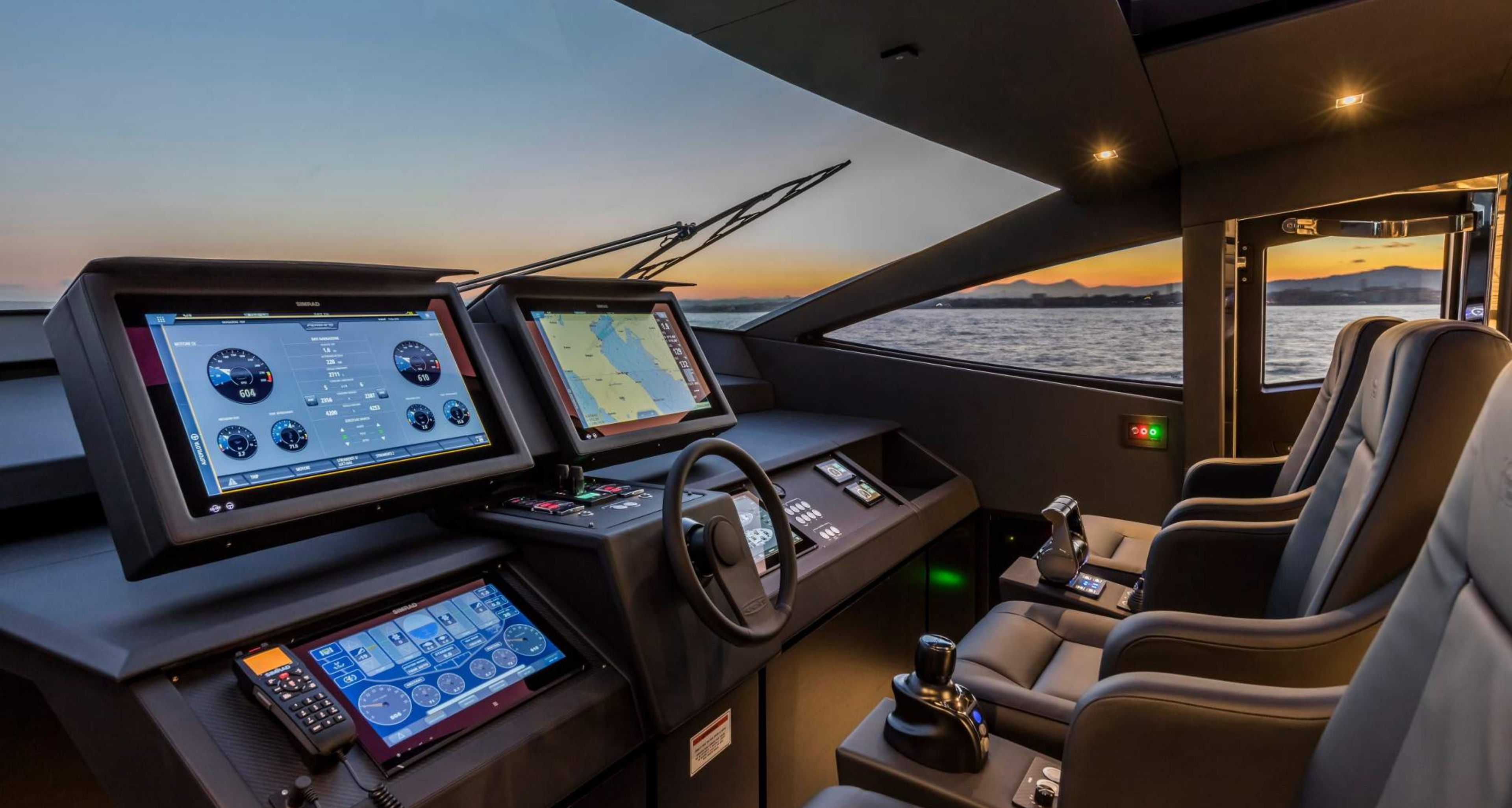
PHOTOS PROVIDED ARE OF A SISTER SHIP. A PHOTOSHOOT OF CHERRY IS SCHEDULED FOR EARLY 2024.